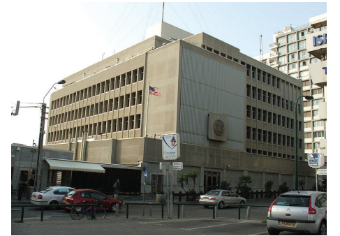
U.S. Embassy in Tel Aviv.

have family members who still live in the African country. There are at least 9,000 Ethiopian Jews still waiting to emigrate to Israel, following Prime Minister Benjamin Netanyahu's approval to process their immigration through a $1 billion program.