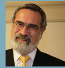
JONATHAN SACKS LONDON

One reason religion has survived in the modern world despite four centuries of secularisation is that it answers the three questions every reflective human being will ask at some time in his or her life: Who am I? Why am I here? How then shall I live?