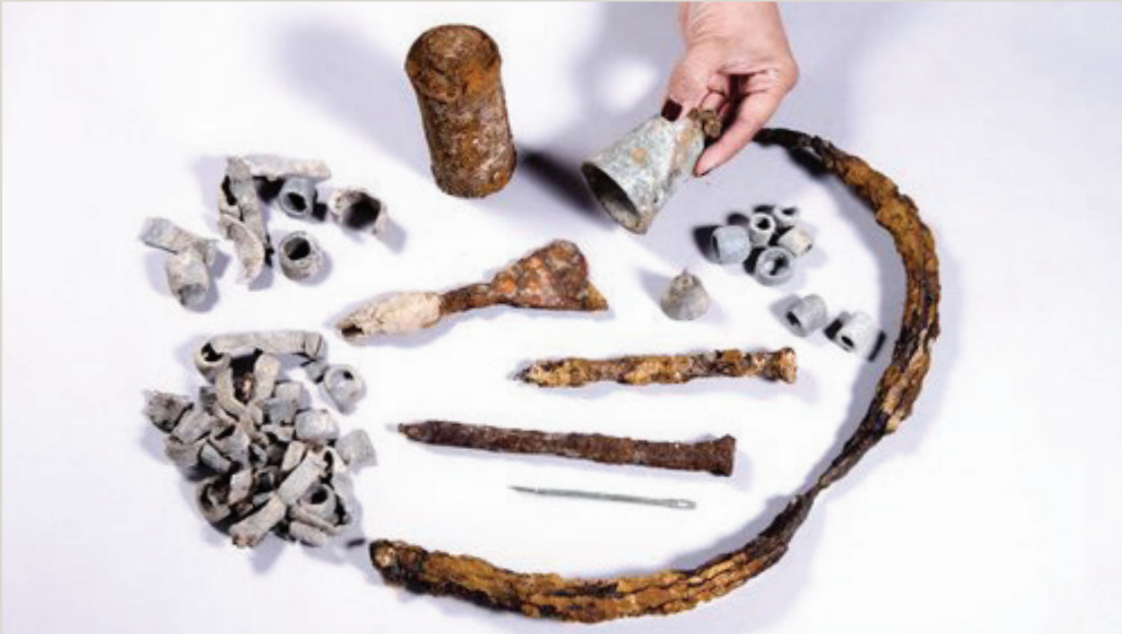
Metal fish hooks, dozens of lead weights and a large bronze bell were among the finds.