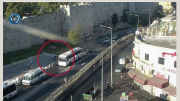
The site of Monday's terrorist attack at Herod's Gate in the Old City of Jerusalem.