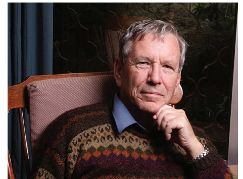
Amos Oz.

Oz's display was disgusting, plain and simple. Nothing new there. But the way his interview is being reported by one media outlet after the other is equally disturbing. Somehow, the main message that has been plucked selectively from his vile pontification was his acknowledgment that the denial of Israel's right to exist — or claim that it shouldn't have been established in the first place — "crosses the line from anti-Zionism to