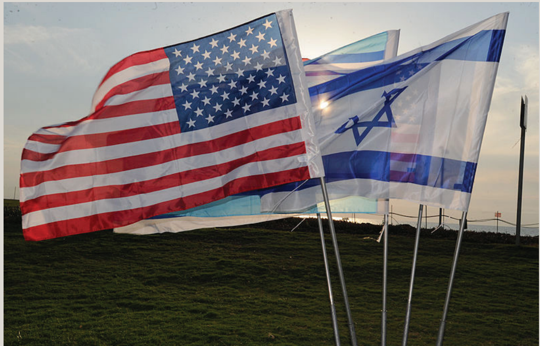
The American and Israeli flags.

relatively unimportant rituals that exist in American life designed to reinforce identity and pride in the nation, and I think he is wrong to offend those. Coming from Europe, one of the things that strikes us is American pride — the flag, the Pledge of Allegiance, singing God Bless America — even if we know full well the sordid side of its history. Silly as they are, we’re impressed by them. Most Americans