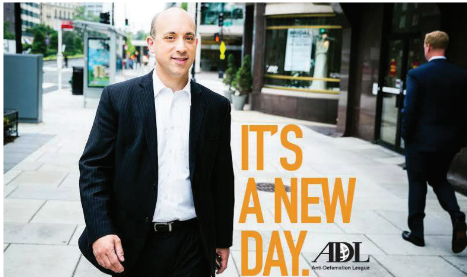
ADL director Jonathan Greenblatt.

This article was originally published by The Jerusalem Post and Israel Hayom.