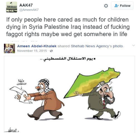
Continued on Page A6

Ameen’s social media accounts, Canary Mission found, are rife with posts spreading terrorist groups’ incitement, propagating antisemitic blood libels and stereotypes, inciting against homosexuals and transsexuals, and demonizing Israel.