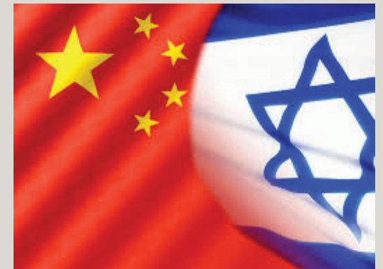
China and Israel flags.

The ministry is offering a nearly $4,000 grant to each undergraduate or graduate student of East Asia Studies who undergoes the rigorous tour-guide course and becomes licensed to lead Chinese groups.