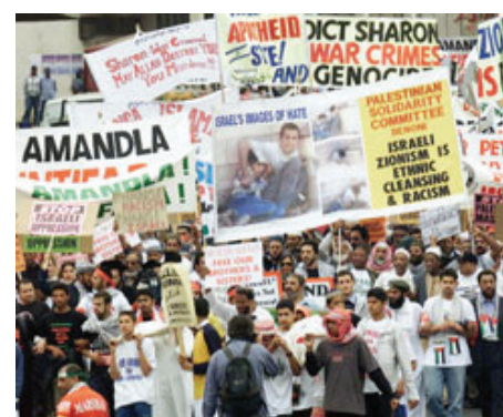
The Durban II conference in 2009.

While some of the anti-Israel rhetoric was ultimately removed from the final governmental Declaration and Programme of Action, the NGO Forum overwhelmingly adopted its own Final Declaration that depicted Israel as committing "crimes against humanity," "ethnic cleansing," "apartheid" and "genocide" against the Palestinians. The NGOs at Durban also called for "a policy of complete and total isolation of Israel as an apartheid