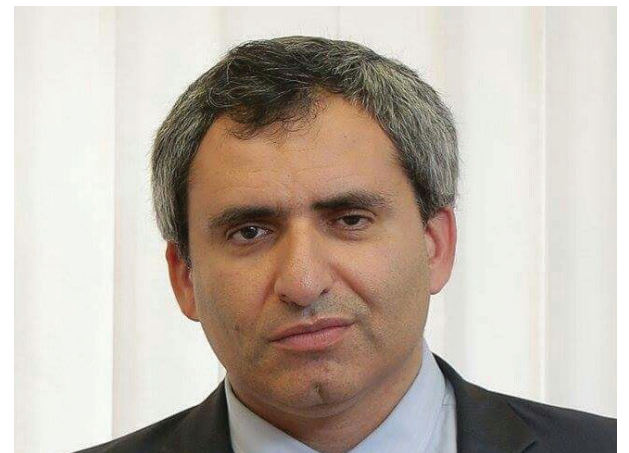
Jerusalem Affairs Minister Ze'ev Elkin.

As The Algemeiner reported, Australian Foreign Minister Julie Bishop recently wrapped up a trip to Israel, during which Prime Minister Benjamin Netanyahu accepted her invitation to become the first head of the Jewish state to pay an official visit Down Under.