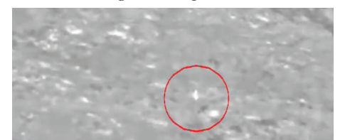
CCTV footage of a Palestinian terrorist, prior to his stabbing of an IDF officer.

This was the latest Palestinian terrorist incident over the past 48 hours, with rock-throwing, stabbings and a car-ramming in Jerusalem and Hebron. It is the latest upswing in the surge in violence against Israelis that began last September.