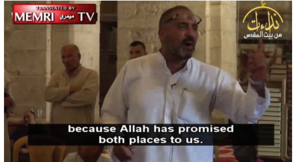
Palestinian Muslim cleric Abdallah Ayed.