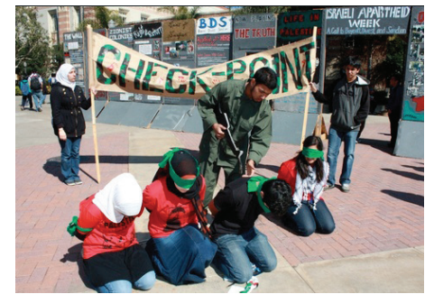
A mock Israeli checkpoint set up during "Israeli Apartheid Week" in May 2010 on the University of California, Los Angeles campus.

The State of Israel has both the right and the duty to demand that any money it provides for Jewish causes abroad come with