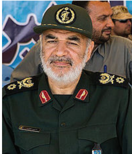
IRGC commander, Brigadier General Hossein Salami.

These statements are examples of increasingly threatening rhetoric emanating from Tehran since its signing of the Joint Comprehensive Plan of Action with world powers last year.