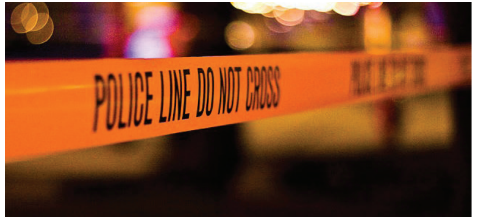
Antisemitic attacks in the US are often a precursor to larger-scale terrorist strikes against the general American population, a new report says.