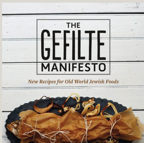
The cover of "The Gefilte Manifesto."