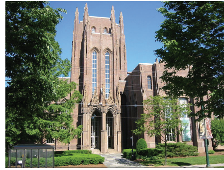
The Peabody Museum of Natural History at Yale University.

But that was then. Once the Halloween fiasco subsided, Calhoun became the villain of choice for Yale students who demanded the