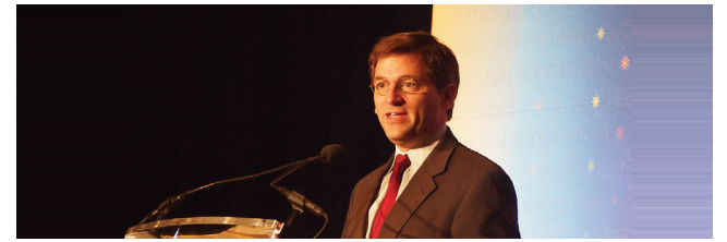
The now-former New York Times Jerusalem Bureau Chief Peter Baker.

For Times readers who care about the Jewish state, a vacant Israel bureau has its pluses and minuses. On the positive side, if the Times doesn't have a high-powered journalist based in Israel, there's less chance that Times readers will be subjected to some long and prominently displayed dirge about how Jewish Israeli settlers are the sole cause of any and all the problems that have ever afflicted the Middle East. On the other hand, in the event that some actual news breaks out unexpectedly, the newspaper won't be particularly well-positioned.