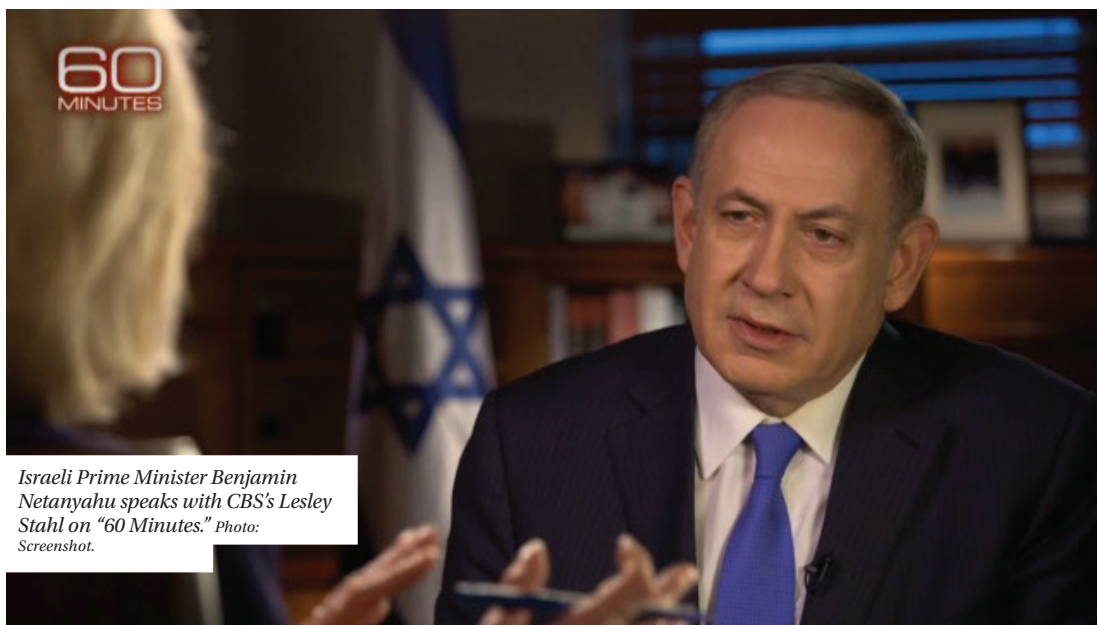
Israeli Prime Minister Benjamin Netanyahu speaks with CBS's Lesley Stahl on "60 Minutes."