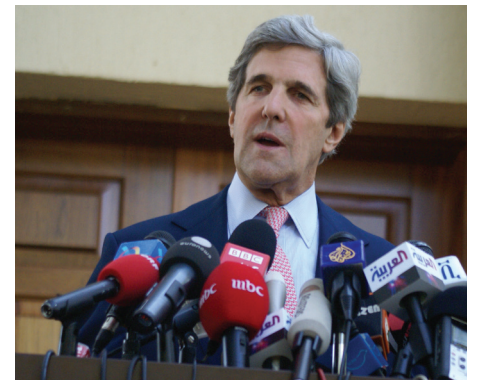
US Secretary of State John Kerry.

So what did Kerry talk about at the Saban Forum in Washington?