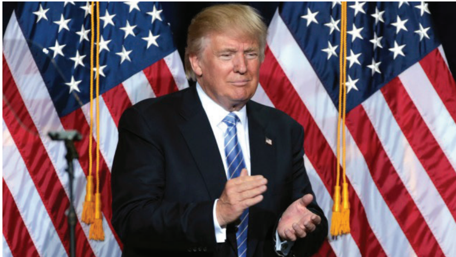
President-elect Donald Trump.