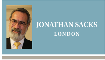
JONATHAN SACKS LONDON

Why is Jacob the father of our people, the hero of our faith? We are “the congregation of Jacob,” “the children of Israel.” Yet it was Abraham who began the Jewish journey, Isaac who was willing to be sacrificed, Joseph who saved his family in the years of famine, Moses who led the people out of Egypt and gave it its laws. It was Joshua who took the people into the Promised land, David who became its greatest king, Solomon who built the Temple, and the prophets through the ages who became the voice of God.