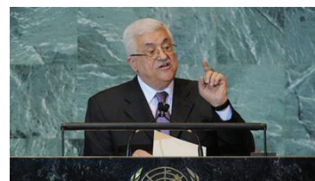
PA President Mahmoud Abbas at the United Nations.

Those concerns were heightened with the recent publication of a New York Times op-ed by former President Jimmy Carter, a proponent of the slanderous lie that Israel is evolving into an apartheid state. Carter called for American recognition of "Palestine" through a UN Security Council resolution that would define the end of result of negotiations before they begin, and punish Israel for not following these measures to the letter. The UN resolution concerns were further solidified by