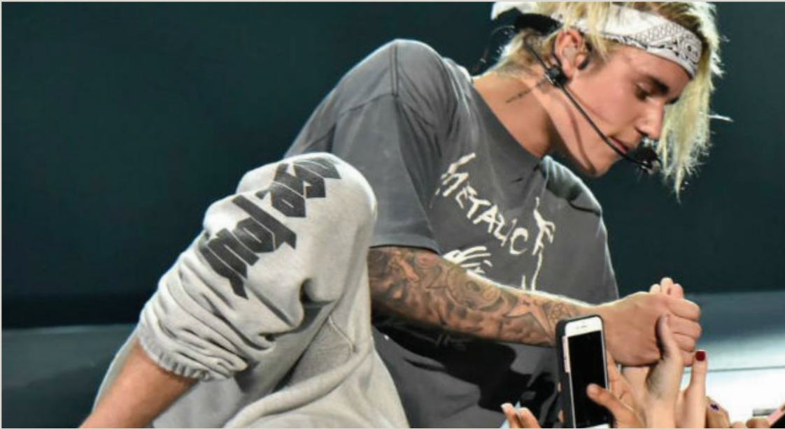
Canadian pop superstar Justin Bieber.