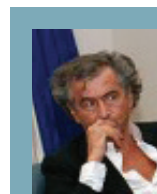
BERNARD-HENRY LÉVY PARIS, FRANCE

The following speech by famed French humanitarian and philosopher Bernard-Henry Lévy was delivered on March 7, 2017, in Erbil, capital of Iraqi Kurdistan, on the occasion of the advance premiere of his new film, The Battle of Mosul .