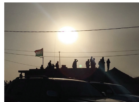
Peshmerga fighters.

I believe that, in reality, you will be a pole