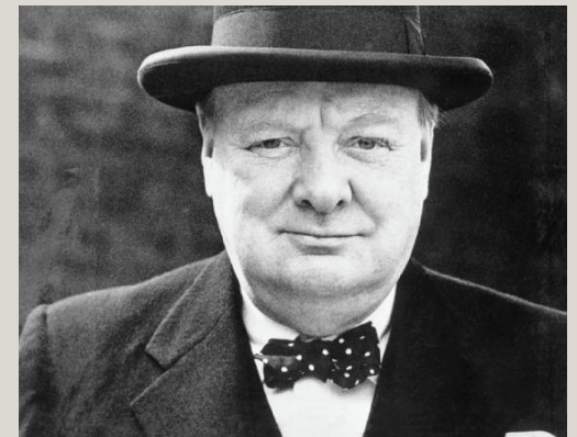
Winston Churchill.

• In early 1945, Churchill made abortive efforts to create a Jewish state within a larger Arab federation by unsuccessfully seeking to enlist — through financial inducements and other things — the support of Saudi King Saud.