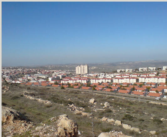
The settlement bloc of Ariel in the West Bank (Judea-Samaria).

The New York Times has now issued a correction of that part of the editorial: