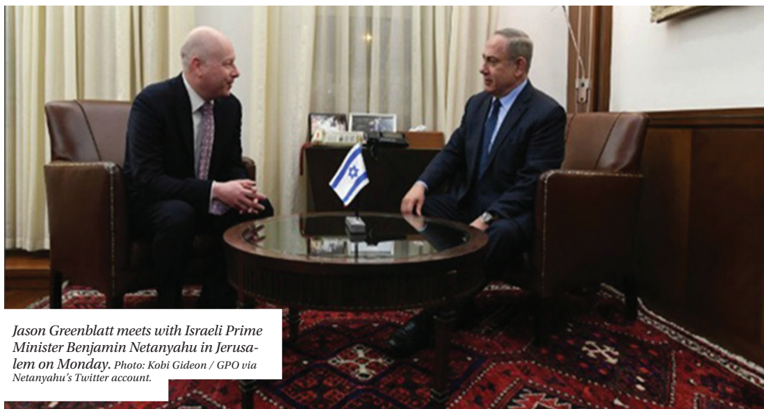
Jason Greenblatt meets with Israeli Prime Minister Benjamin Netanyahu in Jerusalem on Monday.