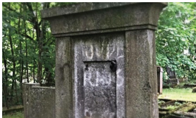
A desecrated tombstone at the Jewish cemetery in Poland.

The first was World War II. While I was born after the war ended, it has heavily