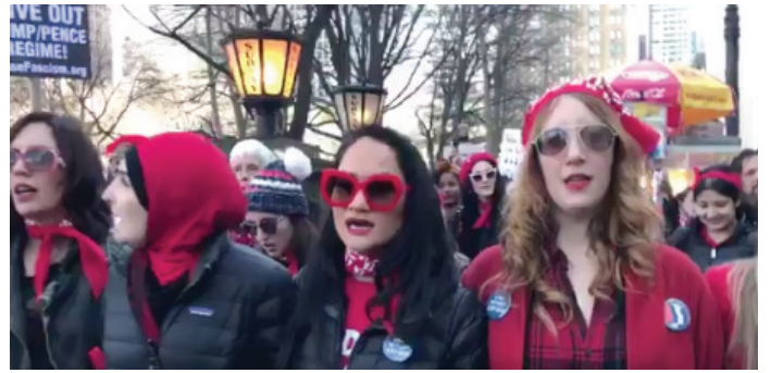
A snapshot of the Women's Strike.