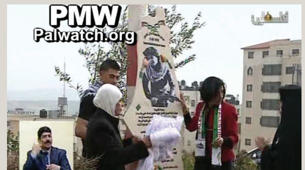
A monument in a Ramallah square dedicated to the terrorist Dalal Mughrabi.

According to the Daily Mail, despite public outrage over the UK government's payments to the PA as part of a commitment to spend £12 billion on foreign aid — following an expose by the paper last year about how taxpayers' money was going toward paying salaries to convicted terrorists and families of suicide bombers — the schools in question have been continuing to incite students to terrorism through text