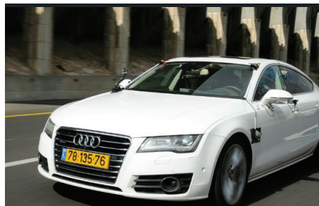
A vehicle fitted with Mobileye technology drives on an Israeli road.

companies developing self-driving vehicles, such as Google parent Alphabet?" MIT Technology Review wrote. "One increasingly popular option is to partner with Mobileye, which makes machine vision systems and motion detection algorithms that warn drivers when they are deviating from driving lanes or about to collide with cars in front of them."