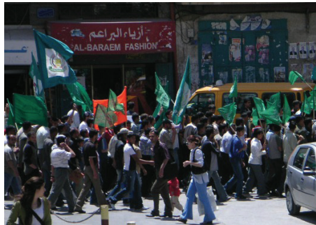
Hamas in the West Bank.