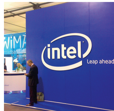
The Intel Corporation logo.