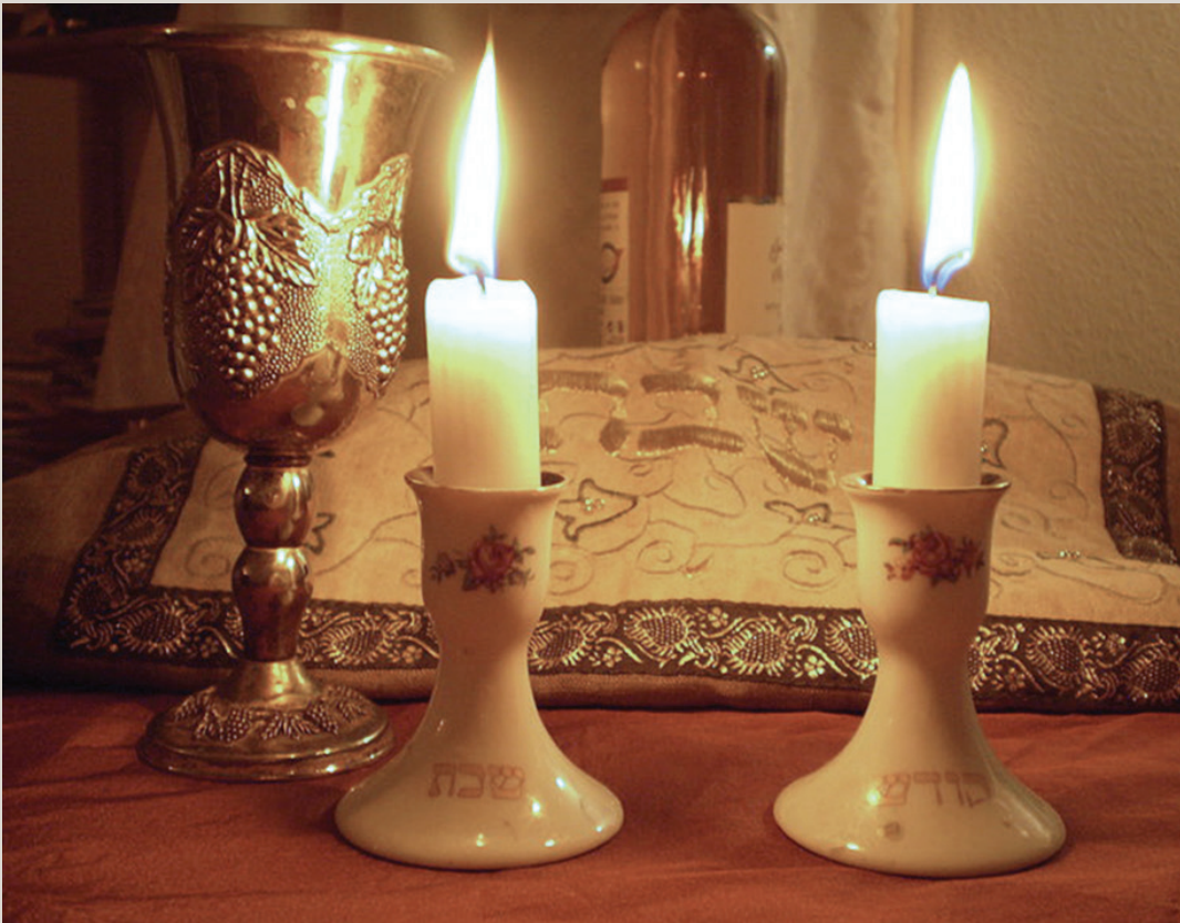
Shabbat candles.