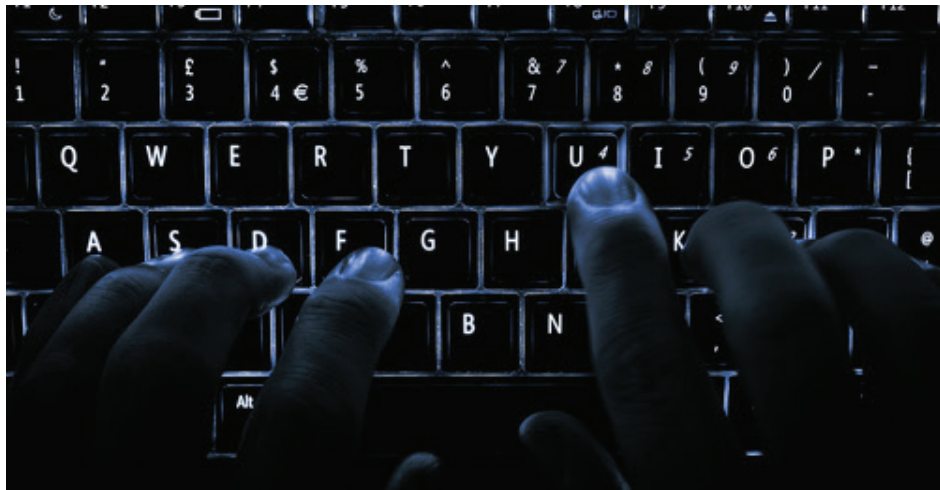
Typing on a computer keyboard.