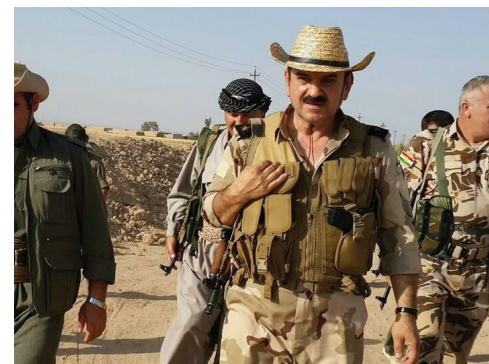
Kurdish fighters in Syria.

Landis' comments come as Chagai Tzurriel,