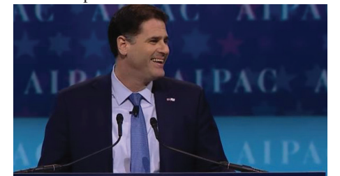
Israeli Ambassador to the US Ron Dermer speaks at the 2017 AIPAC policy conference in Washington, DC on Sunday.

not based on empty hopes and dangerous illusions, but a path based on a clear-eyed understanding of shared threats as well as a common desire for a safer, more prosperous and more peaceful future."