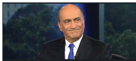
Walid Phares.

Any terrorist actions by anyone anywhere in the world against any nuclear reactor, or any action that causes a radiation leak that damages the region and the world, will be considered international terrorist acts requiring an appropriate response. If Hezbollah wishes to anger the international community, including Arab and Muslim countries, and other countries, chiefly the US, this would be unprecedentedly reckless. Hezbollah knows this, and [nevertheless] threatens such attacks. The results [of these attacks] would be devastating, mostly for Hezbollah itself. I am not saying they would be devastating for Lebanon. Perhaps the Lebanese are worried and fear the response of Israel and the international community, or of [Arab] countries in the Middle East. No. There is a clear understanding, at least here in Washington, that if this happens, the response will specifically target Hezbollah and its institutions if it threatens international security.