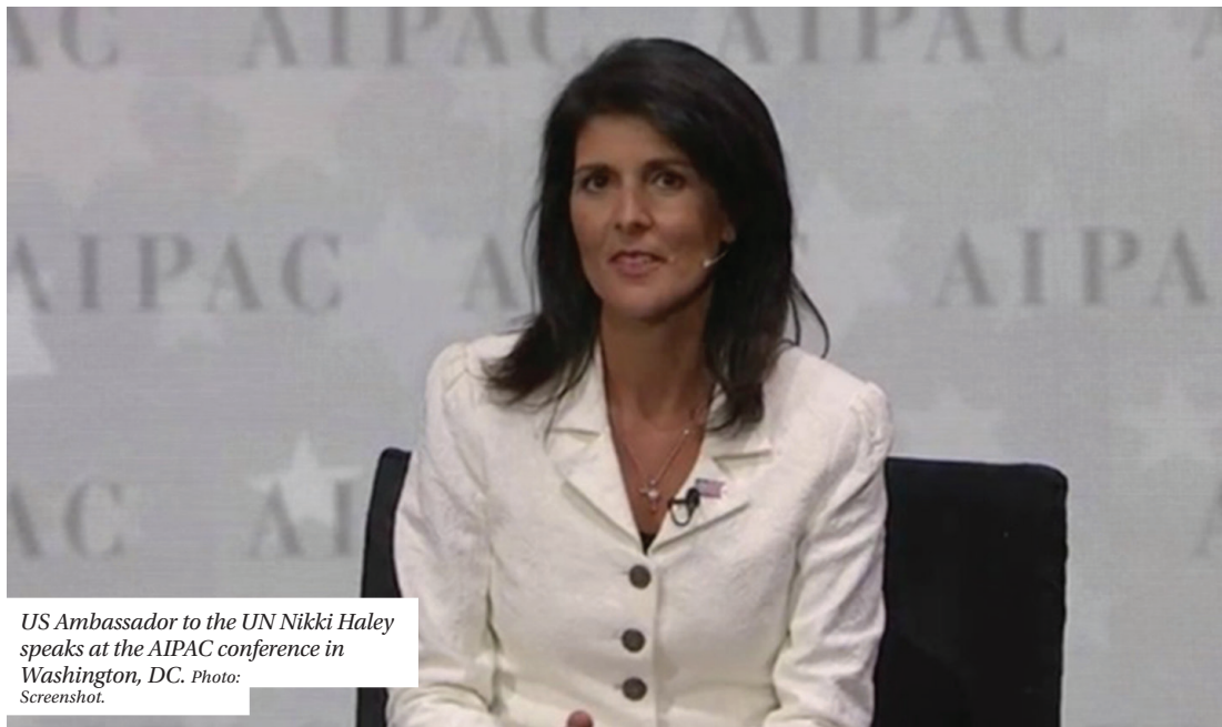
US Ambassador to the UN Nikki Haley speaks at the AIPAC conference in Washington, DC.