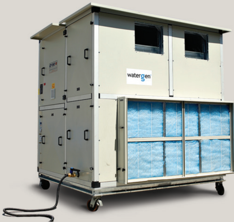
A Water-Gen large-scale water generator.