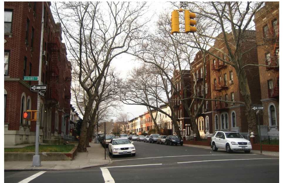
Crown Heights, Brooklyn.