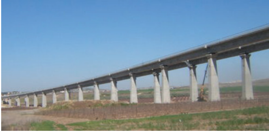
The bridge over the Valley of Ayalon, a landmark of the Tel Aviv-Jerusalem rail project set for completion in 2018.