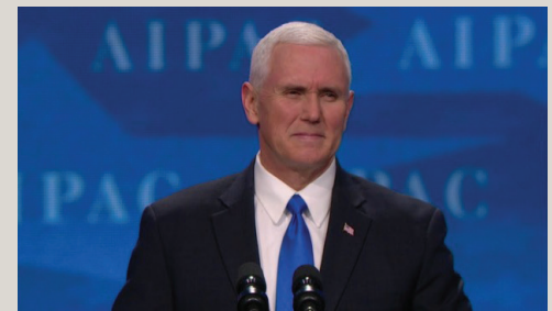
US Vice President Mike Pence speaks at the AIPAC conference in Washington, DC on Sunday.

At the same session, Obama's former ambassador to Israel, Dan Shapiro, said that Trump needs to define his policies on Syria, Iraq and Iran. Shapiro also warned that Trump's proposed cuts to foreign aid could damage relations with the Arab world, and promote instability in countries