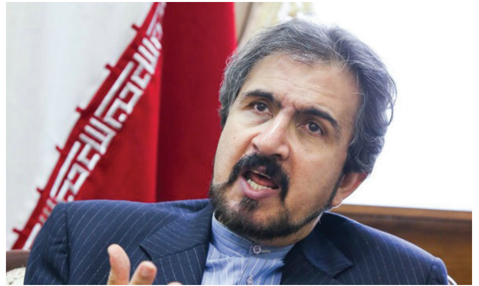
Iranian Foreign Ministry spokesman Bahram Qassemi.