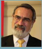
JONATHAN SACKS LONDON, UK

Vayikra is about sacrifices, and though these laws have been inoperative for almost 2000 years since the destruction of the Temple, the moral principles they embody are still challenging.