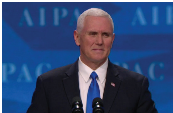
US Vice President Mike Pence speaks at the AIPAC conference in Washington, DC on Sunday.

"Let me clear," Pence emphasized. "Under President Donald Trump, the United States of America will not allow Iran to develop a nuclear weapon. This is a solemn promise to you, to Israel and to the world."