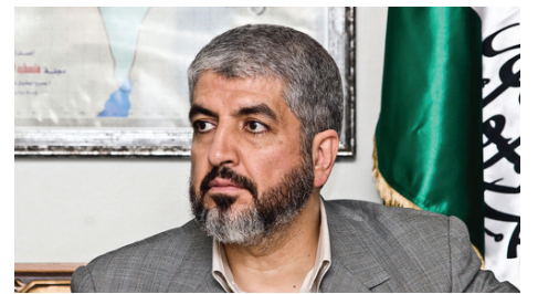
Hamas leader Khaled Mashaal.