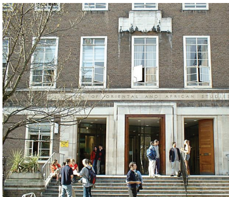
SOAS.

The video's release comes weeks after SOAS Director Baroness Valerie Amos appeared on the BBC's "Sunday Politics" program and said the university does not allow racism or antisemitism on campus, and fosters a culture of respect and tolerance.