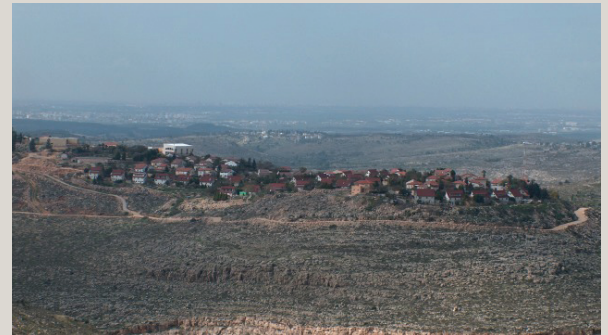
An Israeli settlement in the West Bank.

The poll — conducted by Mina Tzemach on behalf of the Jerusalem Center for Public Affairs (JCPA) think tank — found that only 36 percent of Israeli Jews back a pullout from the West Bank as part of a peace agreement with the