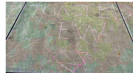
Graffiti at Carlmont High School.

As The Algemeiner reported, a Minnesota public high school has been rented out for an upcoming event whose organizers and speakers have expressed support for terrorism against Israel.