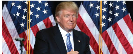
President Donald Trump.

"We will discuss a range of regional issues of mutual concern, including the need to counter the threats posed by Iran and its proxies, and by ISIS and by other terrorist groups," Trump continued. "We will also discuss ways to advance a genuine and lasting peace between