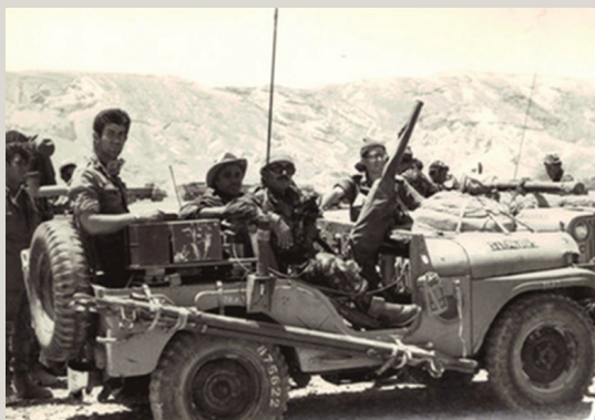
Israeli reconnaissance forces from the Shaked unit in the Sinai region during the 1967 Six-Day War.

For people who are unfamiliar with the history, In Our Hands does an outstanding job of highlighting the challenges faced by the Jewish state two decades after