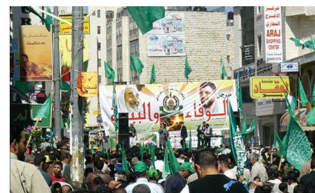
A Hamas rally in Ramallah.

George Orwell, as so often, put his finger on the problem, as long ago as 1940, when he