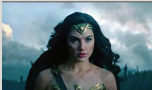
Wonder Woman

Gadot unveiled the final trailer for "Wonder Woman" on Sunday night at the MTV Movie & TV Awards. The action film will be out in theaters June 2, 2017.