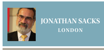
JONATHAN SACKS LONDON

Alongside the holiness of place and person is the holiness of time, something parshat Emor charts in its deceptively simple list of festivals and holy days (Lev. 23:1-44).