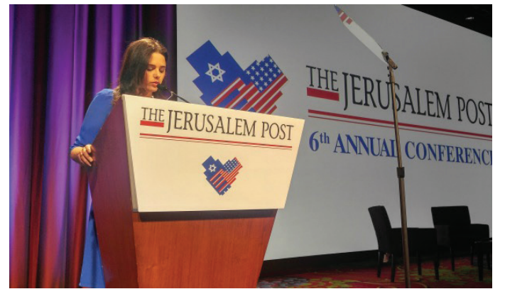
Israeli Justice Minister Ayelet Shaked at the Jerusalem Post conference in New York.

Shaked, however, is deeply skeptical of the president's more recent forays into the arena of Israeli-Palestinian peacemaking. "I think that he will know in a few weeks or a few months that the gaps are much too big and there will be no deal in the current years," she predicted. "The majority of people in Israel think that the two-state solution based on the 1967 lines is a catastrophe for Israel and this