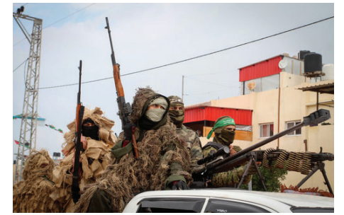
Hamas fighters in the Gaza Strip.

Given Israeli Prime Minister Benjamin Netanyahu's political and legal troubles at home, Abbas may think that he can win a game of chicken with the prime minister. In this scenario, the Israelis would pull out of talks before the Palestinians, thus enabling the Palestinians to look good without actually making peace. But the US objective here needs to be laying the groundwork for a genuine change in Palestinian behavior, rather than a symbolic handshake that would give Trump a political boost or support his