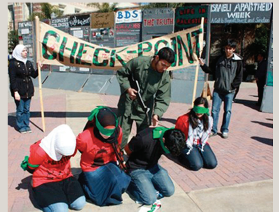
Israeli Apartheid Week is an annual anti-Zionist initiative. The pictured event took place on the University of California, Los Angeles (UCLA) campus.

In addition, in dozens of incidents, Jewish students were singled out and targeted for harmful behavior by individuals who were clearly motivated by antipathy towards the Jewish state — as demonstrated by their affiliation with an anti-Zionist group (e.g. SJP) or expressions of anti-Zionism that they had made prior to, or at the time of, the incident