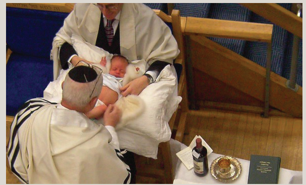
Norway's Progress Party wants circumcision banned for the under-16s.

The Progress Party — a partner in Norway's ruling coalition and known for its free market advocacy and anti-