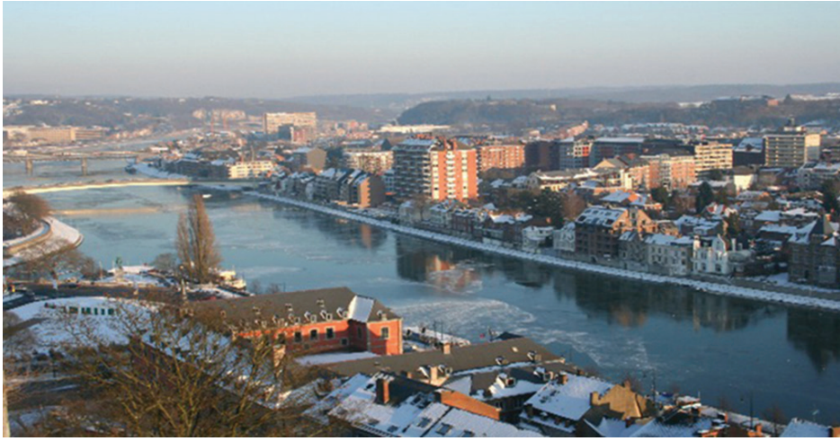
The parliament in Belgium's Walloon region voted for a ban on kosher and halal slaughter.