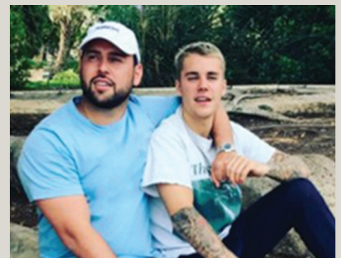
Scooter Braun, left, and Justin Bieber in Israel.