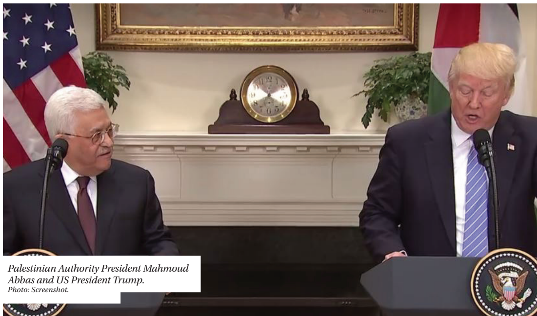
Palestinian Authority President Mahmoud Abbas and US President Trump.