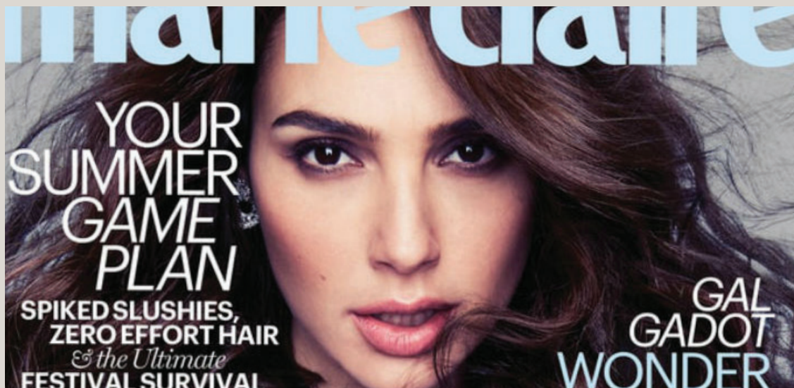
Gal Gadot on the cover of Marie Claire.