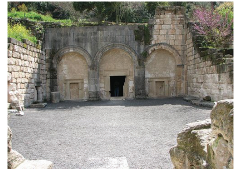
Israel's forthcoming "Sanhedrin Trail" will span the Lower Galilee between Tiberias and Beit She'arim National Park (pictured).

Since the ancient Greeks, people have searched for a single principle that would explain everything, or the single point Archimedes sought at which to move the world, or