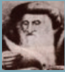
ELDER OF ZIYON NEW YORK