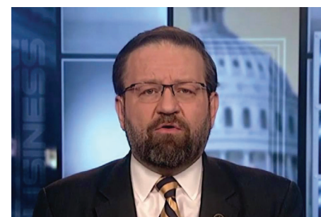
Sebastian Gorka.

But first of all, who is Gorka? He is a British-born scholar with expertise in radical Islam and counter-terrorism. His father was a political prisoner in Communist Hungary who continued fighting to free his country