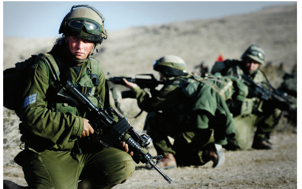
Members of the IDF's Caracal battalion in training.