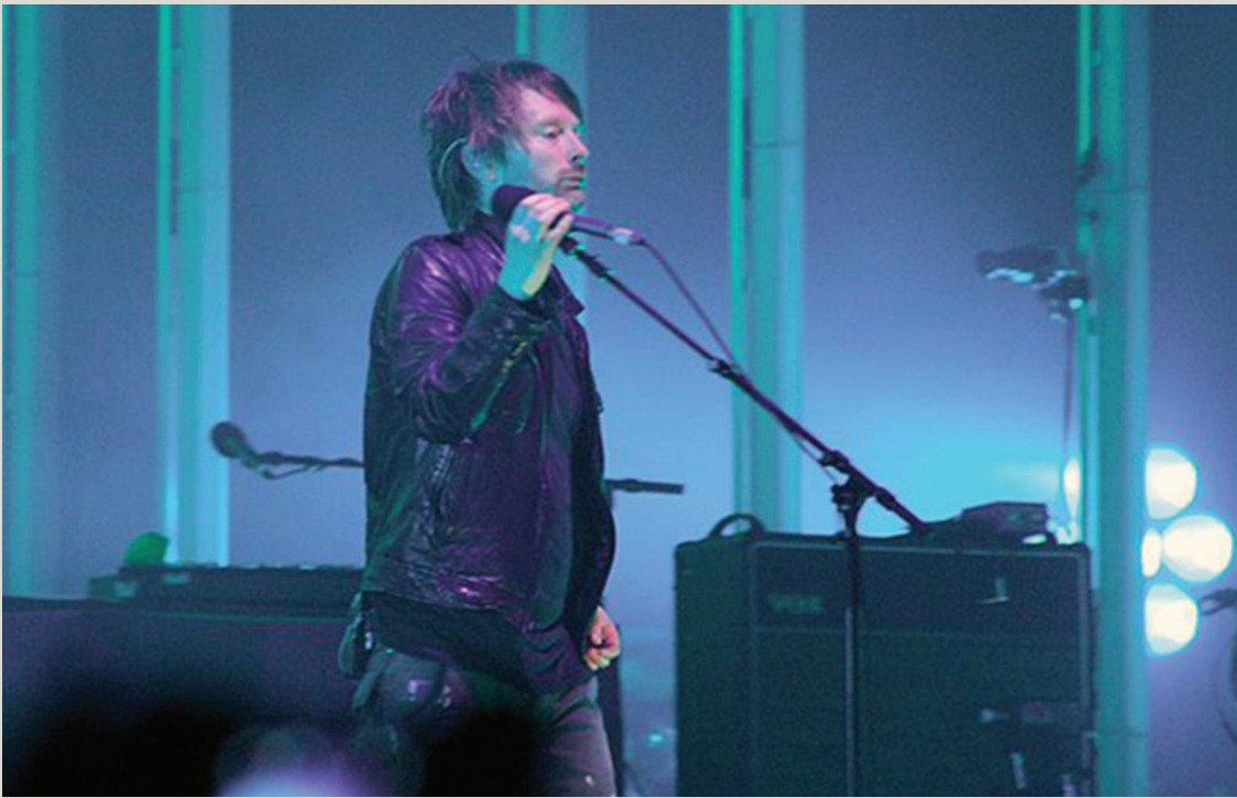
Thom Yorke.