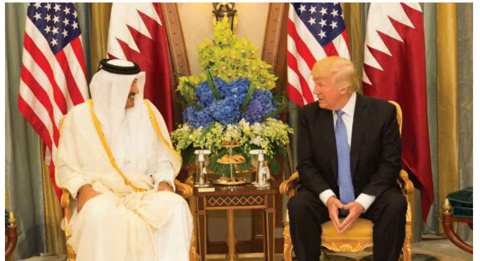
US President Donald Trump meeting with the emir of Qatar at the Ritz-Carlton Hotel in Riyadh, Saudi Arabia last month.