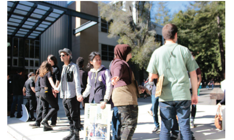
An anti-Israel demonstration at UC-Santa Cruz.

There's no guarantee that such a demonstration would move the chancellor to act, but