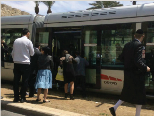
Jerusalem's light rail system.

The average annual growth rate of Israel's population from 1990-2017 has been approximately 2.25 percent. This is "among the highest rate of population growth in the Western world," Professor Yoram Shiftan,