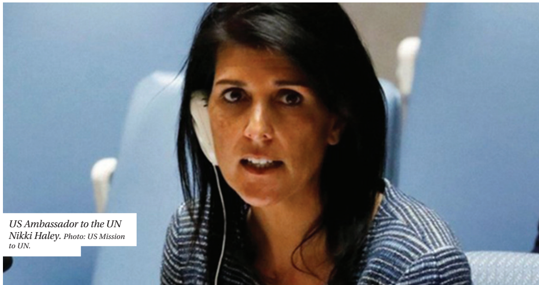
US Ambassador to the UN Nikki Haley.