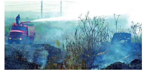
Israeli firefighters extinguish a blaze.