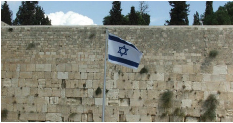
The Israeli flag at Jerusalem's Western Wall.