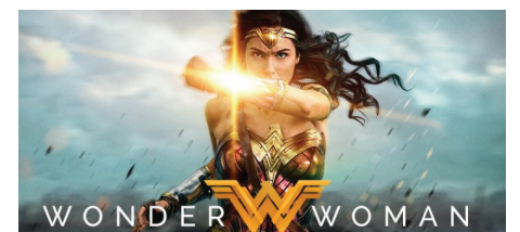
Gal Gadot in an ad for "Wonder Woman."

the news into. It's chosen, clearly, to interpret the movie's commercial success as a victory for women, and not to interpret it as a victory for Jews or Israelis. There may be reasons why the Times made this decision: The Wonder