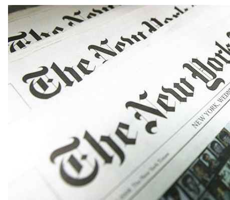
The New York Times.

And that's just the beginning of the problems with the Times article, written by Nathan Thrall of the International Crisis