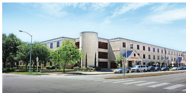
Bellaire High School in Texas.