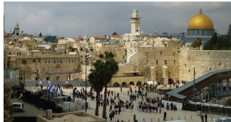
The Western Wall and Temple Mount in Jerusalem's Old City.