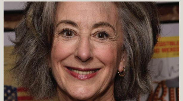
British Jewish actress Maureen Lipman.

Lipman — whose credits include a starring role in Roman Polanski's 2002 film about the Holocaust,