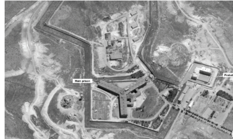
Sednaya Prison.

And, his answer was to tear through that disconnect, to write a book that could