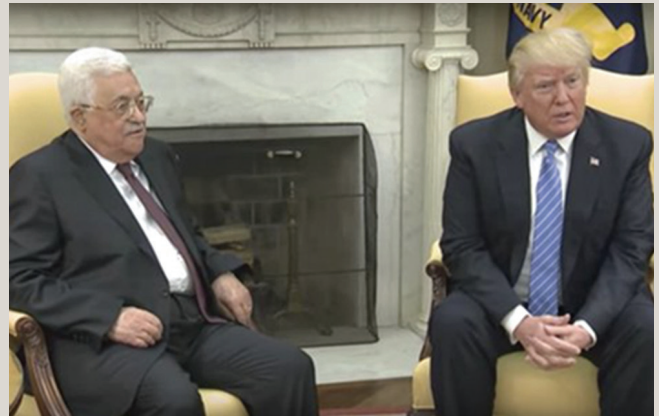
Palestinian Authority President Mahmoud Abbas and President Donald Trump at the White House last month.

This is where the Trump administration needs