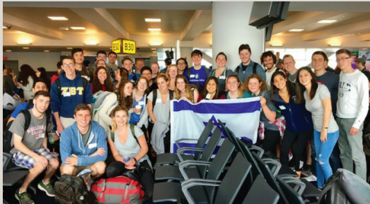
Muhlenberg College students leaving for a Birthright Israel trip.

The Israel Fellows program, which aims to help students make positive connections to Israel, currently deploys a network of 75 Israeli young profes-