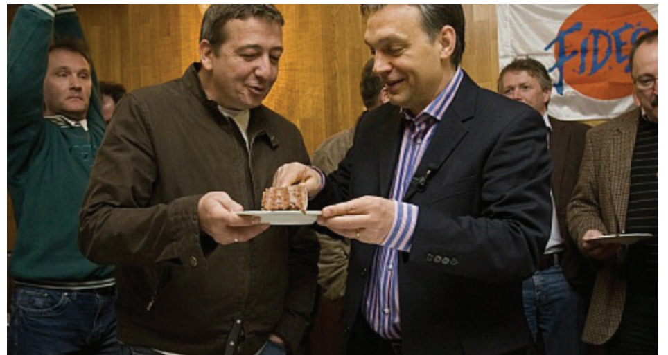
Hungarian Prime Minister Viktor Orban (right) shares a slice of cake with antisemitic journalist Zsolt Bayer.