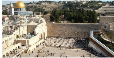
The Western Wall in Jerusalem.

Worrying every day about a rocket crashing into your child's kindergarten, or