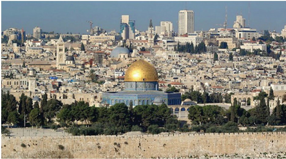
A view of Jerusalem.