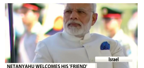
NETANYAHU WELCOMES HIS 'FRIEND'

"As part of the MoU, the governments intend to achieve several objectives such as putting water conservation on the national agenda in India, encouraging each citizen to save water in everyday life, promoting its re-use, recharge and recycling," a statement announcing the agreement stated.