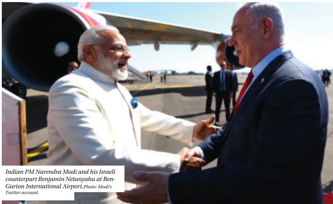
Indian PM Narendra Modi and his Israeli counterpart Benjamin Netanyahu at Ben-Gurion International Airport.