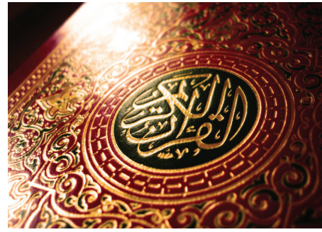
The cover of a Koran.

Many of today's 50 Muslim countries deny the most fundamental rights to minorities, women, non-Muslims and LGBT communities. Yet the UN and other international bodies, countries and NGOs ignore all of these crimes, and continue to make apologies for people who are committing