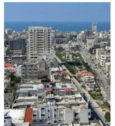
A view of Gaza City.

The Palestinian Authority is literally complicit in killing its own people. But it is embarrassed when that fact is publicized.