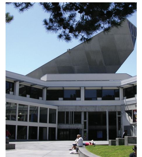
San Francisco State University.

This article was originally published on CAMERA's blog