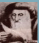
ELDER OF ZION NEW YORK