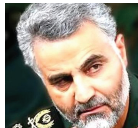
Iranian Quds Force Commander Qassem Soleimani.

The video also notes, about the “internal monitoring,” “critics say this intelligence is a double edged sword and has been used to monitor political dissidents and crush opposition to the government.”