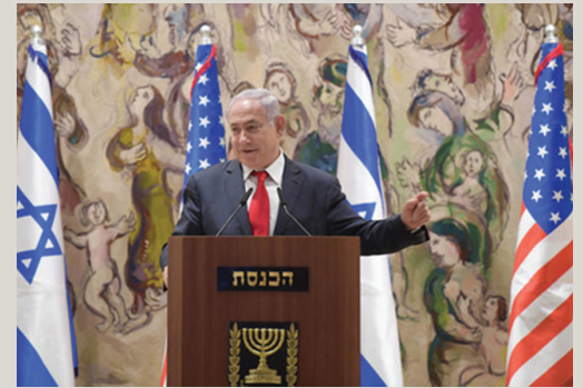
Prime Minister Benjamin Netanyahu.

An Israeli government truly willing to live up to