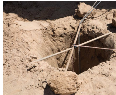
A Hamas terror tunnel that extends from the Gaza Strip into Israel.

No less interesting is the footage we do not tend to see — such as Hamas launching missiles from hospitals and schools, thereby endangering all non-combatants around them. Still more uncommon footage shows Israelis scrambling for bomb shelters as Hamas fires rocket barrages into Israeli towns. Equally rare are interviews and footage of Israel blanketing Gaza suburbs with leaflets