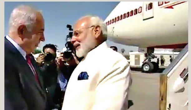
Israeli Prime Minister Benjamin Netanyahu greets his Indian counterpart Narendra Modi at Ben-Gurion International Airport on Tuesday.

"The natural partnership between India and Israel, formally elevated 25 years ago to full diplomatic relations, has grown stronger from year to year," the two premiers