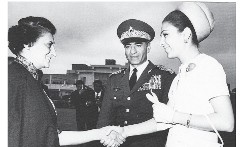
India Prime Minister Indira Gandhi (left) with Shah Reza Pahlavi of Iran (center) and Farah Pahlavi (right) in 1970.