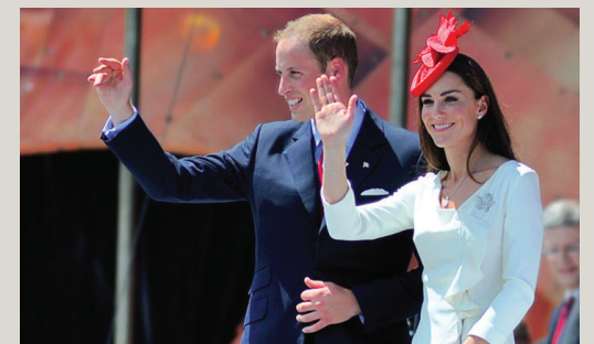
Prince William and Duchess Kate in 2011.

Kensington Palace announced that the Duke and Duchess of Cambridge will tour the former Stutthof concentration camp in Poland, the Warsaw