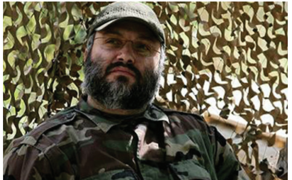
Late Hezbollah terrorist leader Imad Mughniyeh.