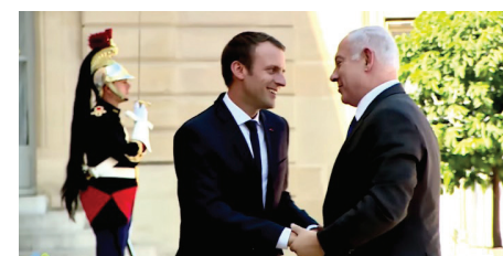
French President Emmanuel Macron greets Israeli Prime Minister Benjamin Netanyahu at the Elysee Palace in Paris earlier this month.

In 2006, very few protested the kidnapping, 24-day torture and the subsequent murder of Ilan Halimi. But notably, Nicolas Sarkozy, then France’s interior minister, declared that the murder was an antisemitic crime. This affirmation set the stage for yet another battle over acknowledging the source