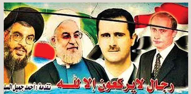
The other quartet: a poster showing Hezbollah leader Hassan Nasrallah, Iranian President Hassan Rouhani, Syrian dictator Bashar al-Assad and Russian strongman Vladimir Putin.