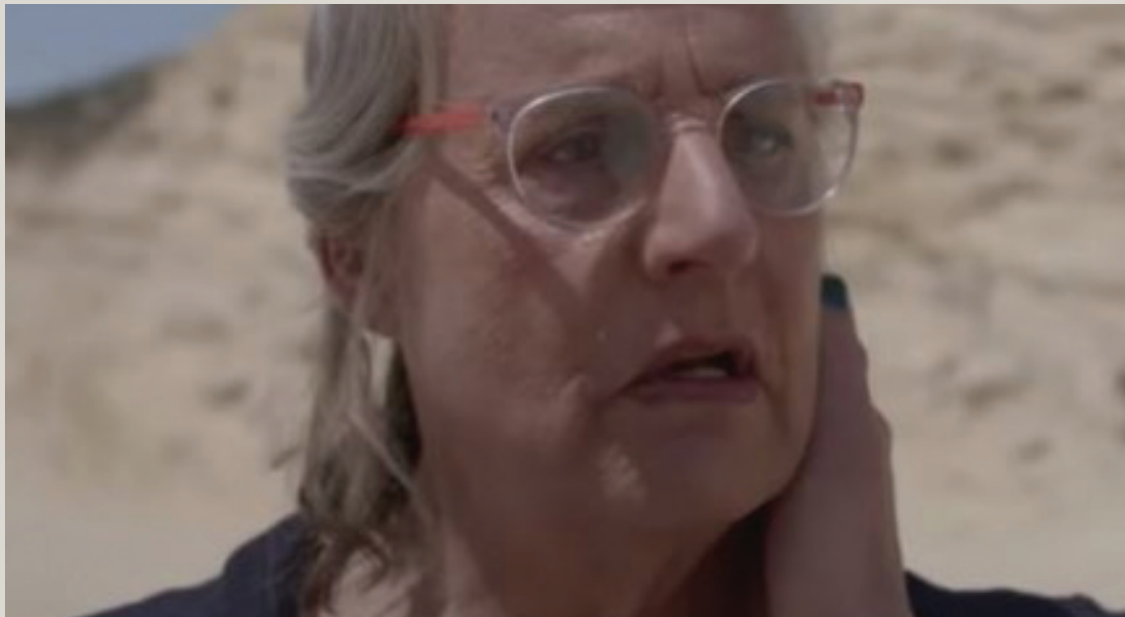
Actor Jeffrey Tambor in the season 4 trailer for "Transparent"