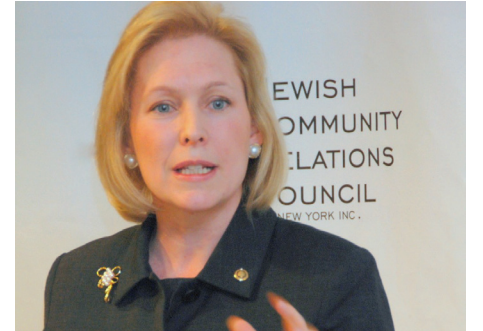
Senator Kirstin Gillibrand speaking to a Jewish group.