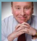
JONATHAN S. TOBIN JNS.ORG

The last two weeks were not a good time to be the prime minister of Israel.