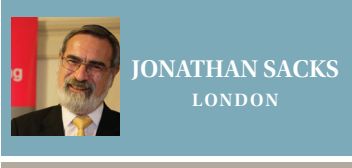
JONATHAN SACKS LONDON

What was the first commandment? On this there are two fascinating disagreements in Judaism. One was between Moses Maimonides (1135-1204) and the author of the Halakhot Gedolot, written in the period of the Gaonim, probably by R. Shimon Kayyara (eighth century), that for the first time enumerated in a systematic way the 613 commands. The other was between Maimonides and the poet and thinker Judah Halevi (c. 1080-c.1145). These were two different arguments, and they touched, as we will see, on fundamentals of faith.