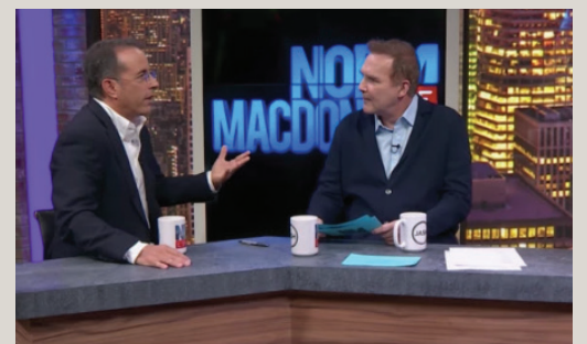
Jerry Seinfeld during a guest appearance on "Norm Macdonald Live"

The "Comedians in Cars Getting Coffee" star explained that host Macdonald and other non-Jews might not find the humor in the somewhat confusing joke, but, Seinfeld said, "That's the joke, is that you won't get it."