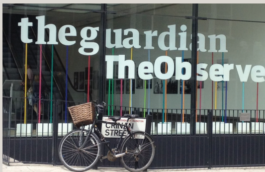
The Guardian office in London.

Senior IDF officials later said that Lyons' claims were "completely fictitious."