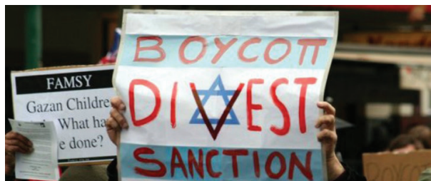
A pro-BDS demonstration.

Cervantes is an evangelical Christian and the founder of the Social Encounter Party. During his visit, he discussed methods for improving ties between Mexico and Israeli communities in the West Bank.