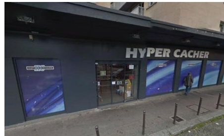
The Hyper Cacher kosher supermarket in Paris that was attacked by an Islamic terrorist in January 2015.

Yet there was another vision launched some 50 years afterwards by the Lubavitcher Rebbe, Rabbi Menachem Schneerson. Far