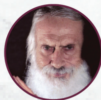
YAACOV AGAM ARTIST