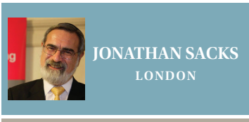
JONATHAN SACKS LONDON

It is by any standards a strange, almost incomprehensible law. Here it is in the form it appears in this week's parsha: