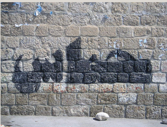
Tag Representing Hamas.

Abbas' strategy for peace with Israel, on the other hand, is the same as it has been for years: keep rejecting all offers, until one comes along that makes Abbas happy.