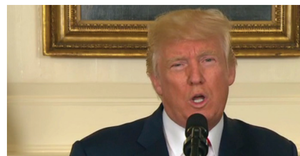
US President Donald Trump.

But as with prior presidential decisions, such as