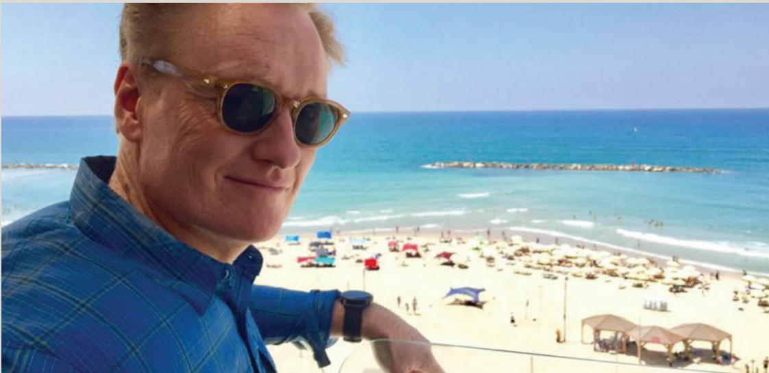
Conan O'Brien in Israel.