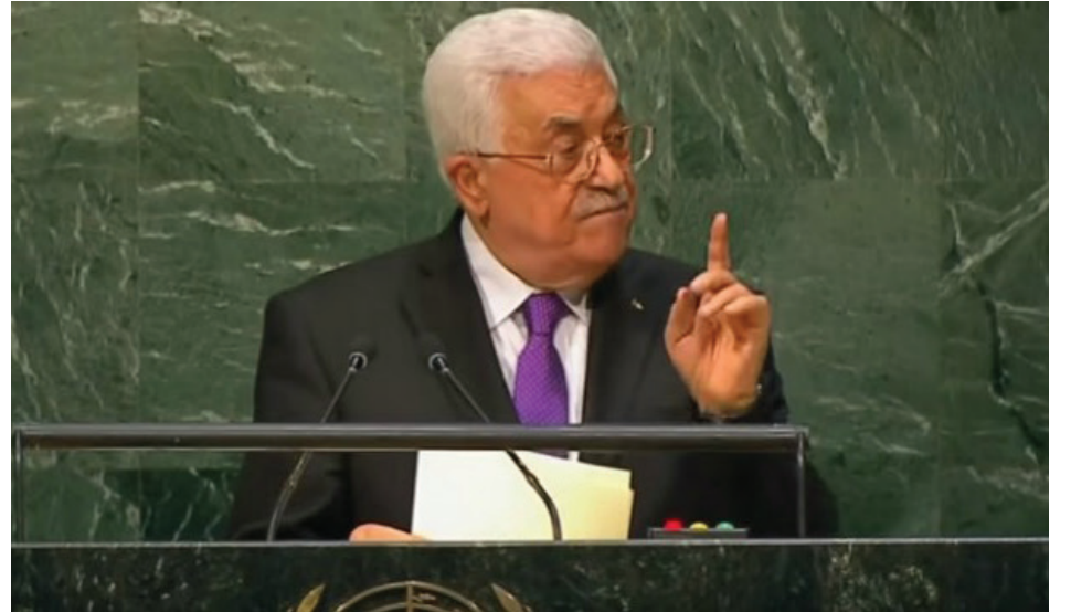
Palestinian Authority President Mahmoud Abbas.