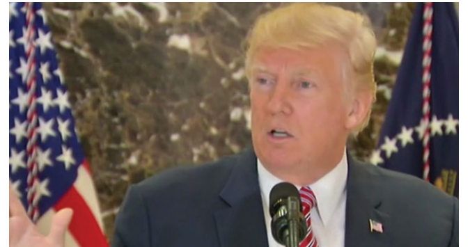
President Donald Trump during a press conference, speaking about the Charlottesville neo-Nazi protest.

Perhaps what Trump said is worse than the sins of all previous presidents, including Franklin Delano Roosevelt's indifference to the fate of the six million Jews who died in the Holocaust or Barack Obama's appeasement of Iran. While some defend both FDR and Obama on the merits, the truth is that many Jews did not openly oppose them because