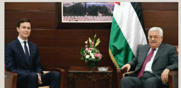
Senior Trump administration official Jared Kushner with PA President Mahmoud Abbas at a June 2017 meeting in Ramallah.

Al-Quds, a Jerusalem-based newspaper that is close to the PA, reported that Kushner had raised the issue of the so-called "martyr payments" made to convicted terrorists