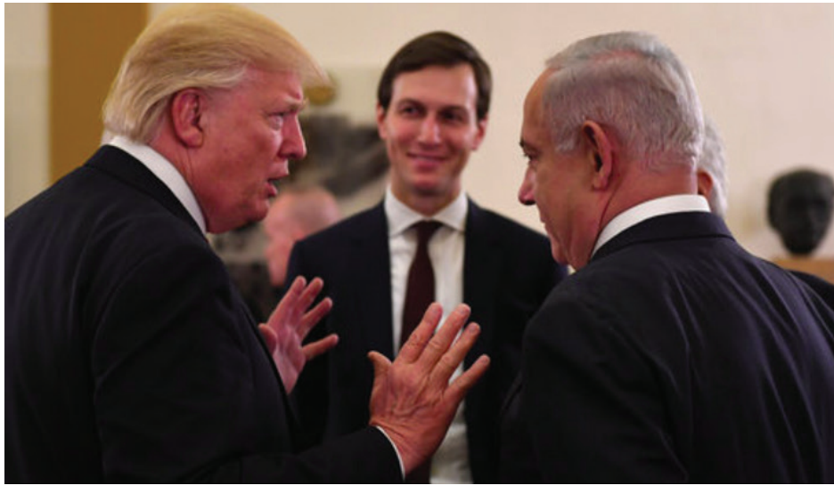
Prime Minister Benjamin Netanyahu (right) and President Donald Trump (left) with Jared Kushner (center) at a May 22 meeting in Jerusalem.