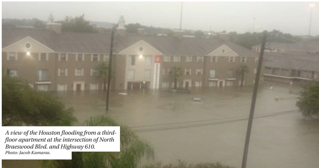
A view of the Houston flooding from a third-floor apartment at the intersection of North Braeswood Blvd. and Highway 610.