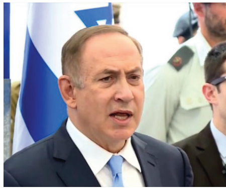
Israeli Prime Minister Benjamin Netanyahu. Photo: Screenshot.

An official Israeli government ceremony marking the same events from 1967 will take place in the Kfar Etzion community on Sept. 13.