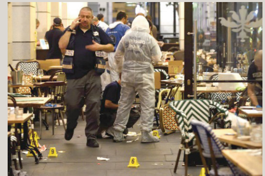
The aftermath of a Palestinian terror attack at a Tel Aviv restaurant in June 2016.

It's questionable to characterize — as USA Today does — "several hundred Palestinians" throwing "rocks and Molotov cocktails" as a "minority." It's even more questionable to draw the conclusion that, as the online version of the report was headlined: "Palestinians learn value of non-violent protests in mosque security standoff