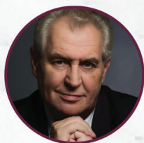
MILOŠ ZEMAN PRESIDENT OF THE CZECH REPUBLIC