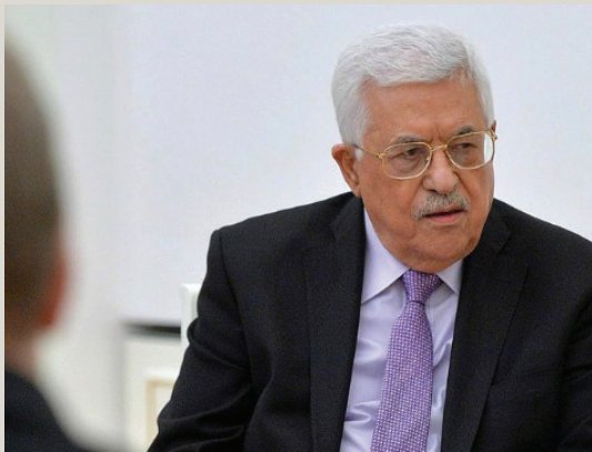
Palestinian Authority President Mahmoud Abbas.

The PLO leader recently met with Turkish leader Erdogan, and presented him with a framework to unify Abbas' PLO and Hamas (yet again). The details of the plan aren't important, but they include Hamas dissolving its administrative committee that controls Gaza; the forming of a national unity govern-