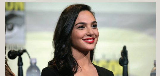
Israeli actress Gal Gadot.

"His entire family was murdered — it's unthinkable," Gadot told Rolling Stone. "He affected me a lot. After all the horrors he'd seen, he was like this damaged bird, but he was always hopeful and positive and full of love. If I was raised in a place where these values were not so strong, things would be different. It was very easy for me to relate to everything that Wonder Woman stands for."