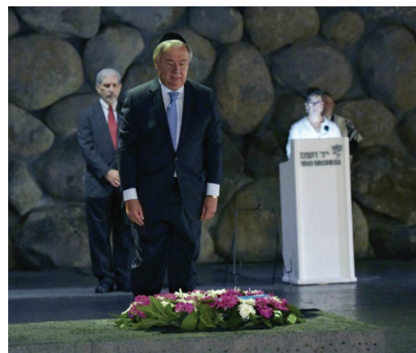
UN Secretary-General Antonio Guterres at Yad Vashem on Monday.

have power over the members. I know also that the members don't always reflect their good relations with Israel that are expanding rapidly in the way that they vote in international bodies. Yet I believe that your leadership can make a difference. I believe that merely focusing on these changes that are so obvious, are so sensible, and are so necessary for the advancement of stability and security and peace, and ultimately prosperity, I believe that you can make an important difference."