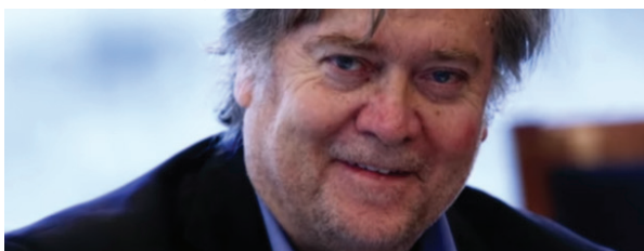
Steve Bannon.

Bannon aggressively petitioned President Donald Trump to relocate the US Embassy in Israel from Tel Aviv to Jerusalem, but was blocked by Trump's son-in-law and senior adviser Jared Kushner, Vanity Fair reported last week. Additionally, when Palestinian Authority President Mahmoud Abbas visited the White House in May, Bannon boycotted the meeting, sending a text message to a friend stating that he would not "breathe the same air as that terrorist," according to Vanity Fair.