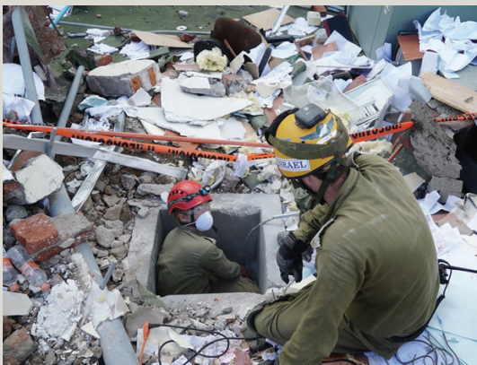
Members of the IDF delegation in action on the ground in Mexico City.

Since their arrival in Mexico City on Thursday, members of the Israeli delegation have been taking part in search-and-rescue operations, as well as surveying damaged buildings.