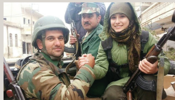
Kurdish Peshmerga from Syria and Iraq on the frontline against ISIS.

"When you think that the three of them have the nerve to appeal to international law," he said. "The hands of Iran's leaders are still wet with the blood of the 400,000 Syrians that Bashar al-Assad has butchered with the help of Hezbollah.