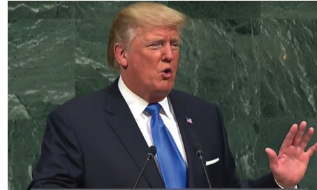
US President Donald Trump delivers his first address before the UN General Assembly last week.

“Rocket man” and his “band of criminals,”