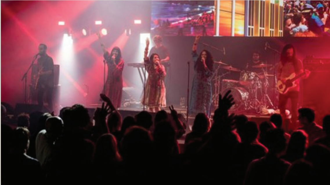
Performers at the "Women in Power" concert during the TLVinLDN event in London.