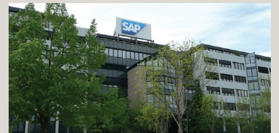
SAP headquarters in Germany.

Gigya employs 100 people in Israel. Its core operations focus on analyzing user data for large