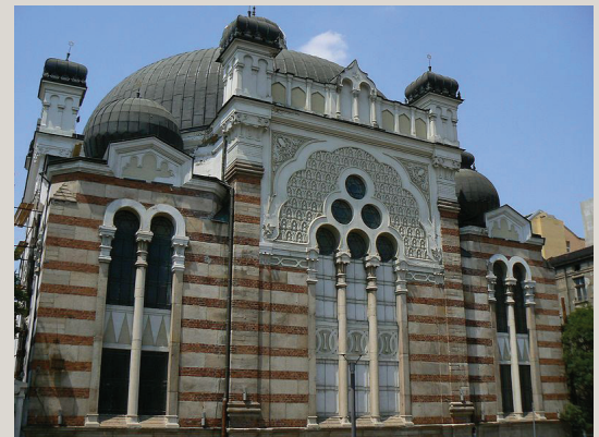
The Sofia Synagogue in Bulgaria's capital city.

The rescue of the Bulgarian Jews remained a long kept-secret until the end of the communist regime in 1989. Fortunately, documents that recorded details of it were only hidden and locked