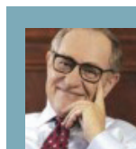
ALAN DERSHOWITZ BOSTON

Valerie Plame had to know what she was tweeting. Plame re-tweeted a virulently antisemitic article by a well-known bigot, which she characterized as "thoughtful." Now she's trying to make excuses, but they don't wash.