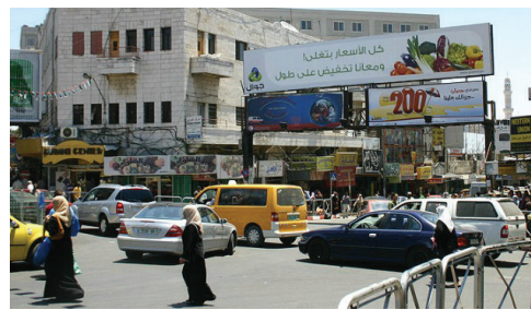
Palestinians in Ramallah.

While Abbas periodically threatens to disband the PA in response to Israeli actions, as if this would somehow punish the Israelis, 50%