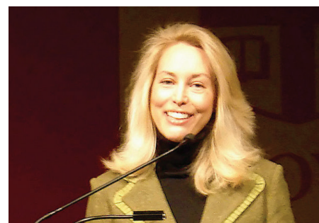
Valerie Plame.