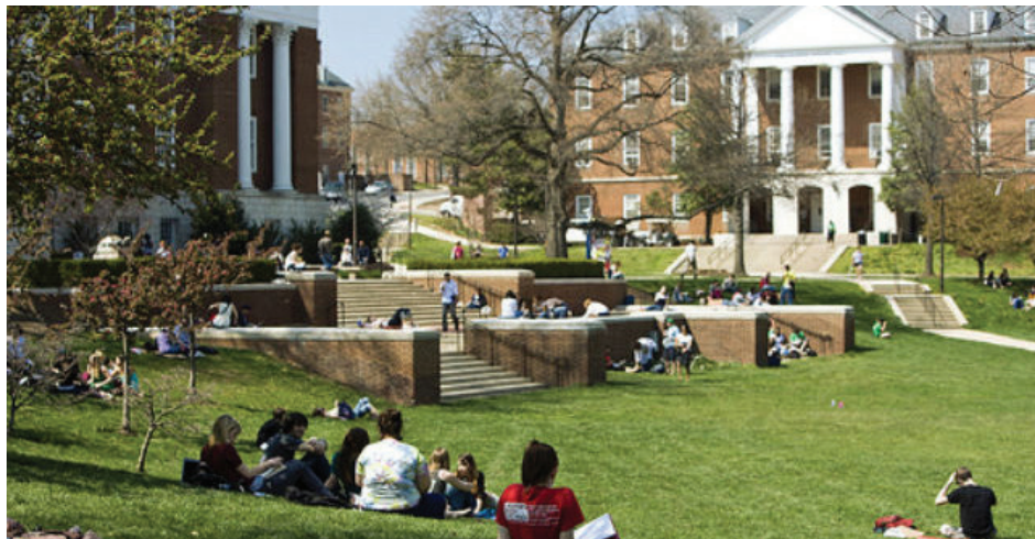
The University of Maryland-College Park campus.