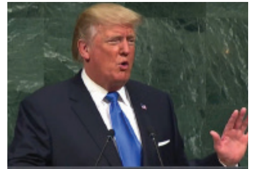
US President Donald Trump delivers his first address before the UN General Assembly.

In other words, the Iran nuclear pact is an indefensible swindle negotiated by an administration so determined to get a deal at any price that it abandoned every principle that it should have defended. Were it not the personal project of Obama and the particular