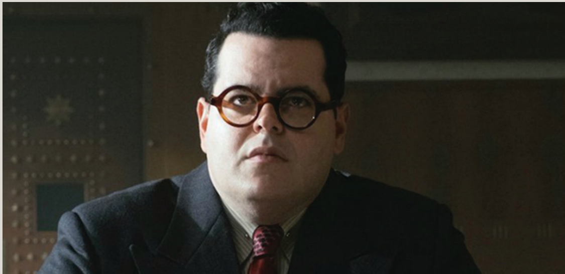
Josh Gad in "Marshall."