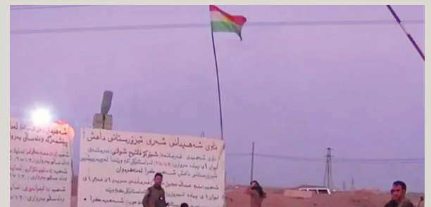
Kurdish Peshmerga fighters at a checkpoint near Kirkuk.

Thousands of people began fleeing Kirkuk as Iraqi troops and Shia fighters entered the majority-Kurdish city,