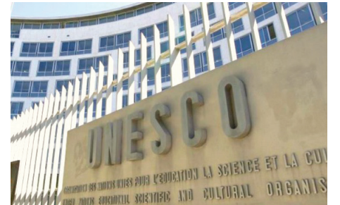
The UNESCO headquarters in Paris.

This is not the first time that the United States has pulled out of the hypocritical UN