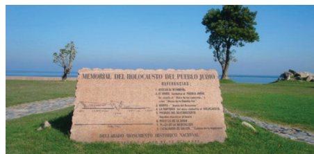
The Holocaust memorial (pictured) in Montevideo, Uruguay, was vandalized twice in one week.

"We repudiate the anti-Semitic graffiti with concepts that deny the Holocaust of the Jewish people, and with that we are hopeful and encouraged by the quick action of cleaning the site and launching a prompt investigation," stated the Israelite Central Committee, the country's Jewish umbrella organization.