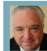
STEPHEN M. FLATOW/ JNS.ORG

European countries are not exactly known for their love of Israel. Yet recent actions taken by the governments of Norway and Belgium suggest that, in at least one important respect, those two nations have gone much further than the US in confronting the problem of Palestinian incitement against Israel.