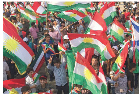
An Israeli flag in a sea of Kurdish flags at an independence rally in Erbil.

East's broader, spreading anarchy, and it provides the context for Kurdish Iraq's overwhelming support for independence from Baghdad.