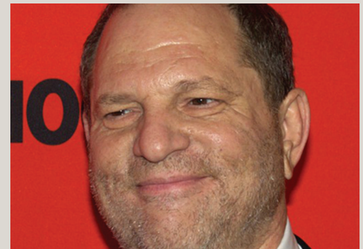
Harvey Weinstein.