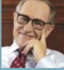
ALAN DERSHOWITZ BOSTON

This article was first published by Gatestone Institute.