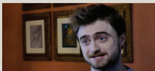
British actor Daniel Radcliffe.