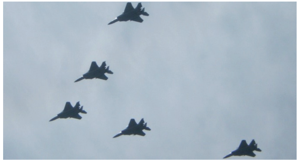
IAF planes flying in formation.