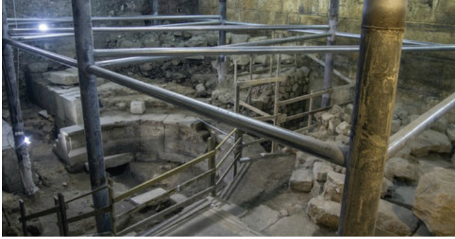
A view of the Wilson's Arch excavation in Jerusalem's Western Wall Tunnels.