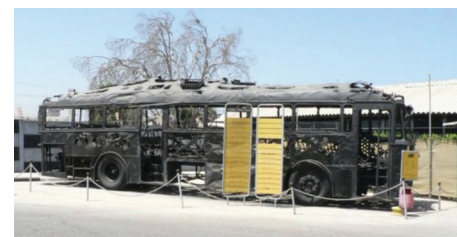
The remains of the Israeli bus hijacked by Palestinian terrorists in 1978 in an attack in which Dalal Mughrabi.

A spokesperson for the Belgian Foreign Ministry told The Algemeiner , "Belgium unequivocally condemns the glorification of terrorist