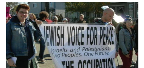
A demonstration in Seattle by the anti-Israel group Jewish Voice for Peace.