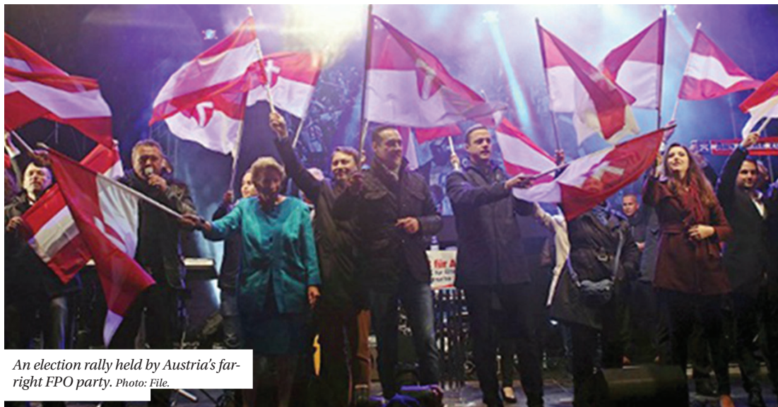
An election rally held by Austria's far-right FPO party.