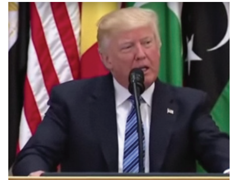
President Donald Trump.

Some of the Israeli tactics, such as raiding banks, were criticized in the West — even by President George W. Bush — as being "Wild West" in nature. But eventually, the United States came to appreciate Israel's tactics, and