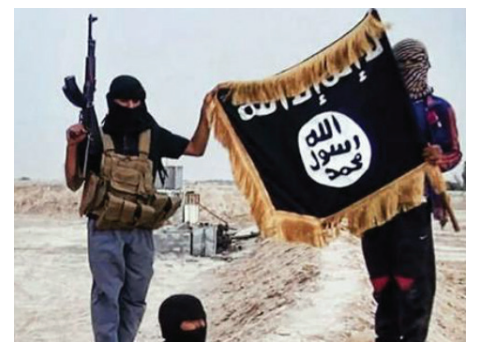
Islamic State terrorists.

The Jewish state formed a multiagency task force — codenamed Harpoon— to wage