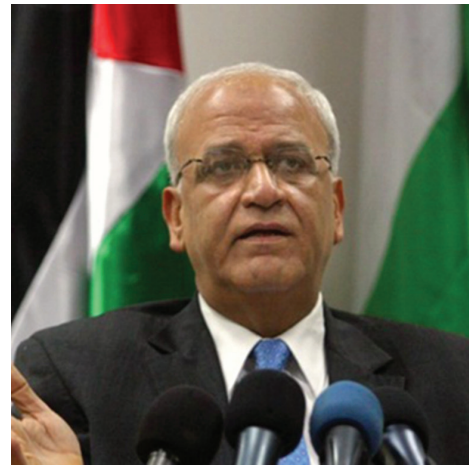
PLO Secretary-General Saeb Erekat.

order to move to the top of the waiting list to get a lung — because you've got, at most, six hours to get that transplant. You have to be close to the donor hospital.