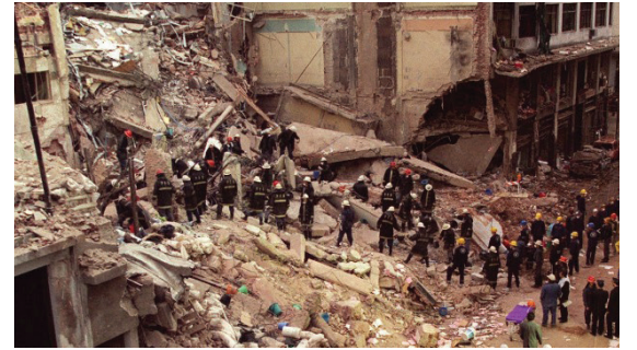
The aftermath of the bombing of the AMIA building in Buenos Aires on July 18, 1994.

Iran may have lost its friends in Latin America like Kirchner and the unlamented Chavez — the man who fathered the current destruction of Venezuela — but its influence in its own region is as never before. President Donald Trump makes many of the right noises in response, but the kind of structural ambiguity plaguing his policy toward Iran ultimately serves the Iranian regime more than anyone else.