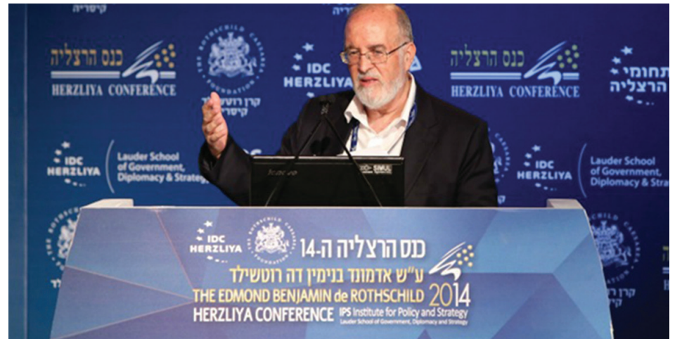
IDF Maj. Gen. (ret.) Isaac Ben-Israel.