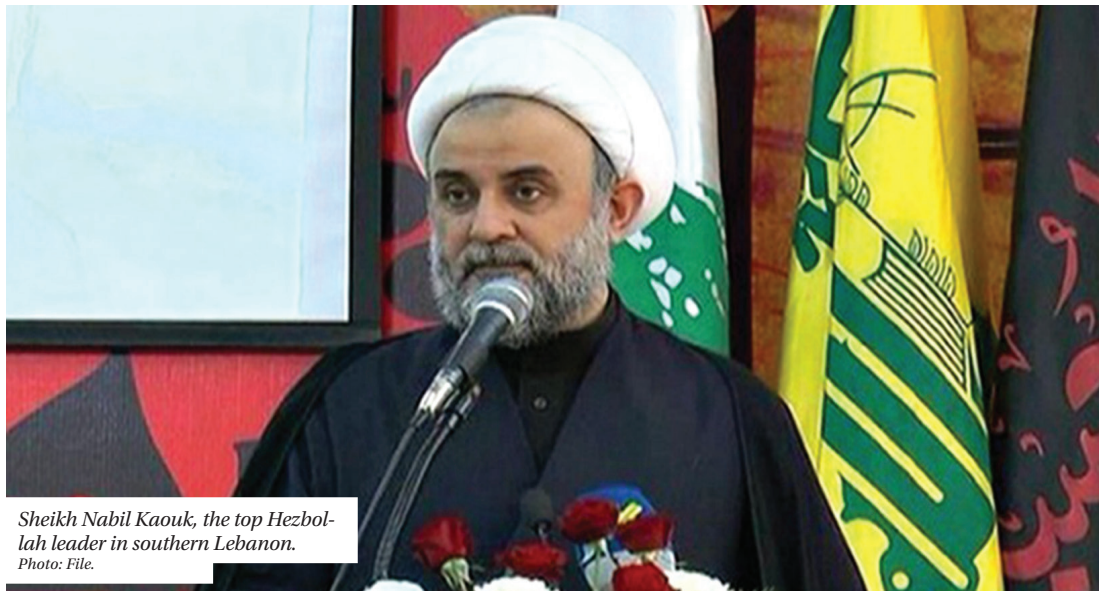
Sheikh Nabil Kaouk, the top Hezbollah leader in southern Lebanon.