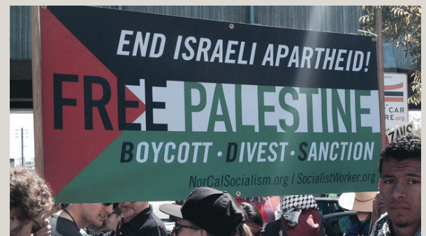
Supporters of the boycott, divestment and sanctions campaign.

In a new report published on Tuesday, the AMCHA