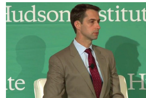
Sen. Tom Cotton speaks at the Hudson Institute counterterrorism conference in Washington, DC.

"Europe has no right to meddle in our defense affairs," the head of the Islamic Repub-