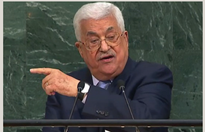
PA President Mahmoud Abbas addresses the UN General Assembly last month.

Earlier in the year, both Lapid and Herzog, Gabbay's predecessor, also made it clear neither of them saw real peace with the Palestinians as a possibility for the foreseeable future. Herzog thought that it would take 10 years for the Pales-