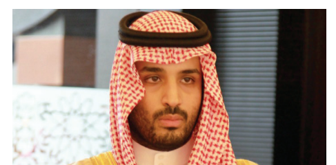
Saudi Crown Prince Mohammed bin Salman.

In June, the US, Israel, the Palestinian Authority, Saudi Arabia and Jordan reportedly agreed in secret negotiations to coordinate the first flight of Palestinian pilgrims to Saudi Arabia from Israel's Ben-Gurion International Airport, to visit the holiest Islamic sites in Mecca and Medina during Ramadan.