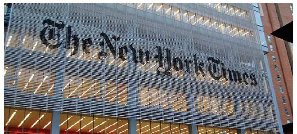
The headquarters of The New York Times.

All in all, it’s a typically disappointing example of how the Times covers Israel and American Jews. The newspaper picks four writers to “ruminate on Jewish identity” and Israel. And of the four, they’ve got one self-described pork lover, a second who has a character make the trite, inaccurate and odious Israel-apartheid comparison, and a third who uses the opportunity to denounce Adelson and Netanyahu. Except for the pork part, which might turn off devout Muslims, the whole feature would do just great translated into Farsi and aimed at the Iranian audience that the Times seems to be eyeing for its business growth strategy.