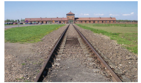
The entrance to Auschwitz-Birkenau.

The honorees in our International Air and Space Hall of Fame are feted for their contributions to aerospace technology. While we do not want to appear indifferent to the fact that Heinkel employed slave