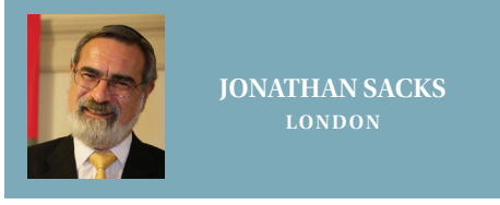
JONATHAN SACKS LONDON

What exactly is a sukkah? What is it supposed to represent?