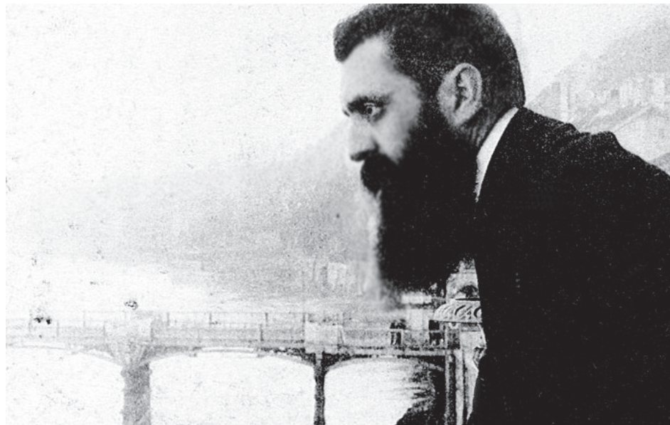
Theodor Herzl in Basel, Switzerland, in 1897.