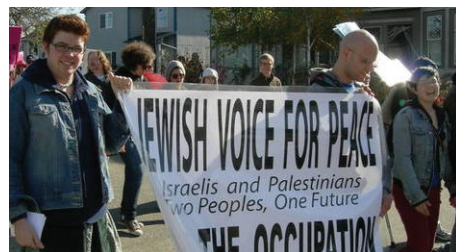
A demonstration in Seattle by the anti-Israel group Jewish Voice for Peace.

For decades, the American Jewish community didn't need to make the case that Zionism addressed an urgent, ongoing