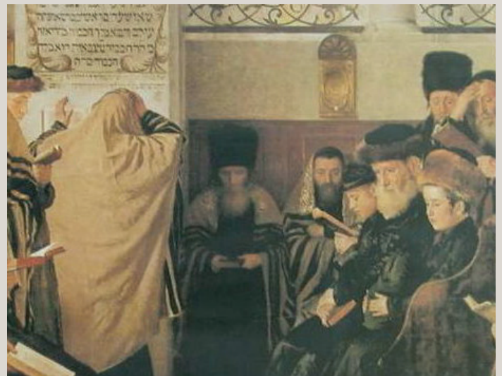
A Yom Kippur painting circa 1900 by Isidor Kaufmann.

4. Make tzedakah part of your business. We all give to charity — whether at a community event, to our shul or to those in need. But can you do more to make tzedakah part of your business? That doesn't mean giving away all of your hard-earned profits; it means finding ways to make giving back part of your company's core values. Take what charity work you already do, and incorporate it into your business. Let customers and employees identify your good work with your company's brand.