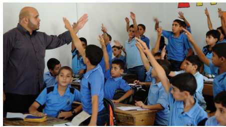
Students raise their hands in a Palestinian school run by the UNRWA.

dean and director of global social action at the Simon Wiesenthal Center — told The Algemeiner , “It’s a war curriculum, not a peace curriculum.”