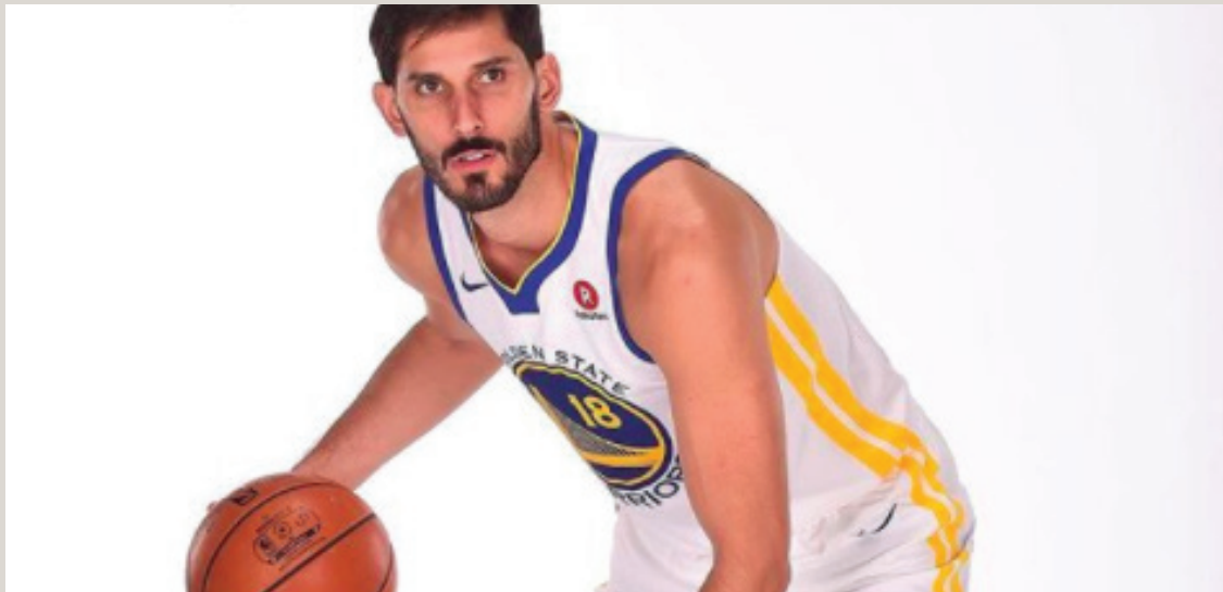
Omri Casspi.