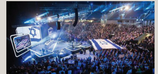
The Feast of Tabernacles celebration in Jerusalem in 2015.

"There also is the added attraction of celebrating