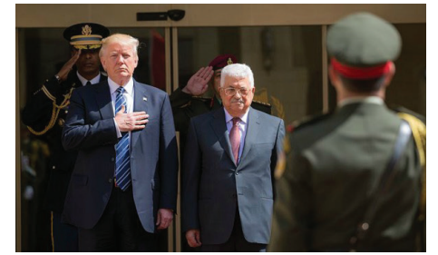
US President Donald Trump and Palestinian Authority President Mahmoud Abbas in Bethlehem on May 23, 2017.

The White House official is wrong. Accelerated Jewish construction in the territories