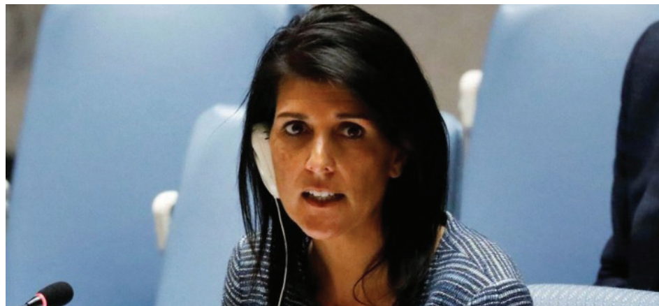
US Ambassador to UN Nikki Haley.