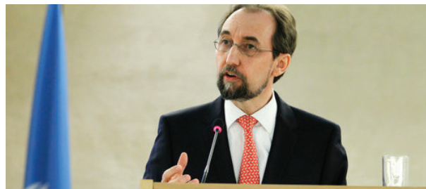
United Nations High Commissioner for Human Rights Prince Zeid bin Ra'ad Zeid al-Husseini.

US Ambassador to the UN Nikki Haley has threatened to cut funding to the UNHRC if it publishes the database.