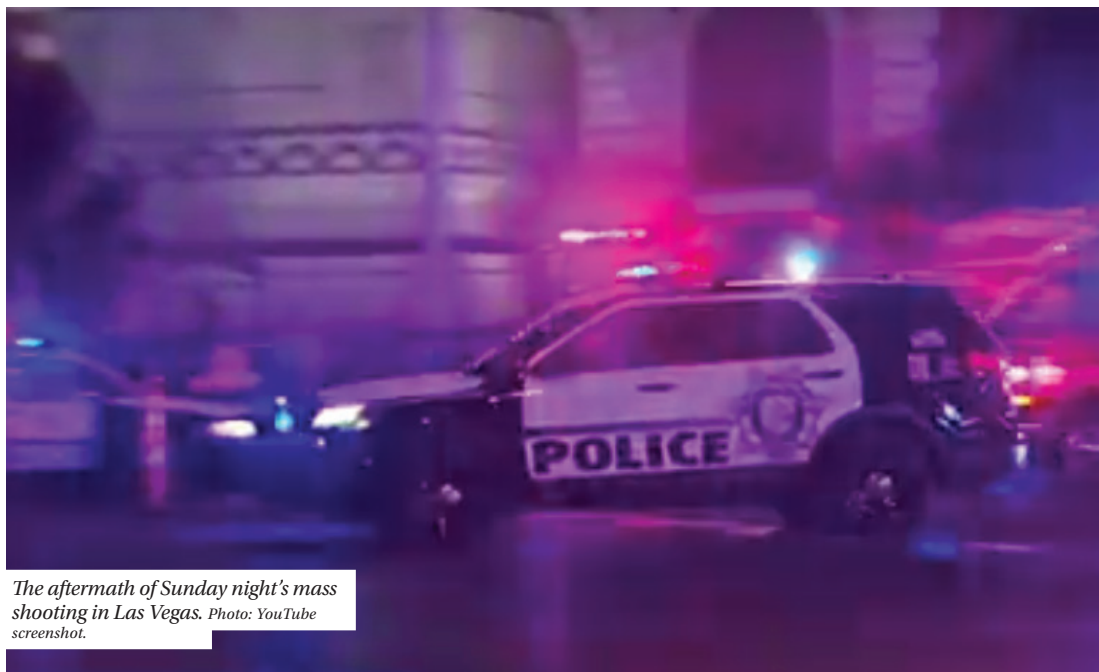
The aftermath of Sunday night's mass shooting in Las Vegas.