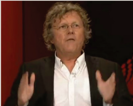
Columnist Rowan Dean.

That "I'm sorry," Dean writes, should be for a long list of shortcomings: Failing to mourn the Israeli athletes killed at the 1972 Olympic Games, dismissing Palestinian terrorist attacks, blaming the lack of Middle East peace solely on Israel, ignoring