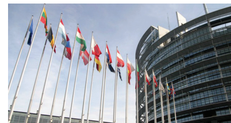
The flag court outside the European Parliament building in Brussels.

The Zionist movement, she stated, “aligns with all the capitalists in the world,” and she added that “in the next 100 years, they [the Zionists] will be able to dominate the world economy.”