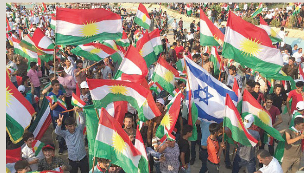
An Israeli flag in a sea of Kurdish flags at an independence rally in Erbil.