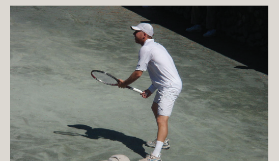
Israeli professional tennis player Dudi Sela.

According to Israeli media outlets, the match had been pushed up at Sela's request, but this was not enough to enable its completion before sundown on Friday.