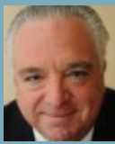
STEPHEN M. FLATOW/ JNS.ORG

The Trump administration is pressuring Israel for further delays in the construction of Jewish homes in Judea and Samaria, according to apparently reliable media reports. If true, friends of Israel have good reason to be concerned.