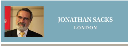
JONATHAN SACKS LONDON

Previously, in Covenant and Conversation , I pointed out the other side of the Esau story. There is a midrashic tradition that paints him in dark colours. But there is a counter-tradition that sets him in a more positive light.