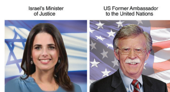
Ayelet Shaked & John Bolton

John Bolton is a world renown expert on international affairs. He has been a key political figure since he was tapped to serve in the Reagan administration in the 80's. He was the U.S. Ambassador to the United Nations under George W. Bush. He is a frequent guest on CNN, FOX News and many other major broadcast networks...And very important, John Bolton is the chairman of the 'Pro Israel' Gatestone Institute, championing causes for