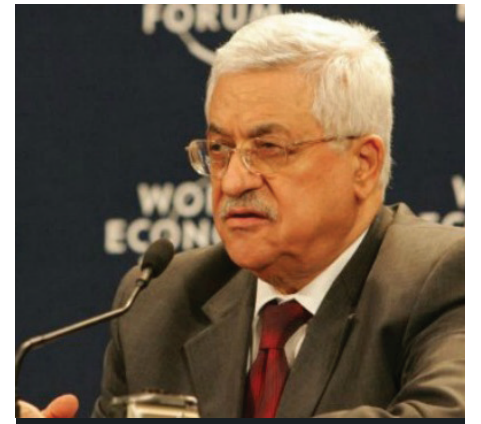
Palestinian Authority President Mahmoud Abbas.

We cannot achieve peace while one side refuses to accept the fact that the other side has won — and has the right to exist. To Israel, victory means the state of Israel being recognized as the homeland of the Jewish nation.