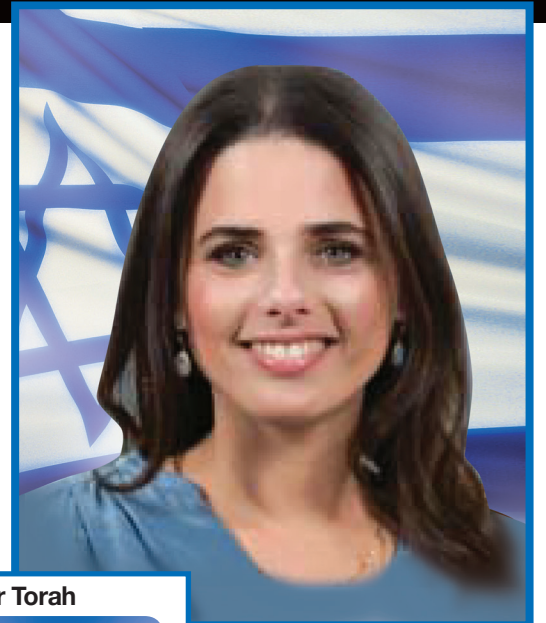
Ayelet Shaked Israel's Minister of Justice