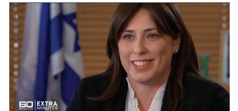
Israeli Deputy Foreign Minister Tzipi Hotovely.

state but also is now promoting antisemitic blood libels, while denying a platform to a representative of the democratically elected government of Israel, is a product of this kind of upside-down thinking.