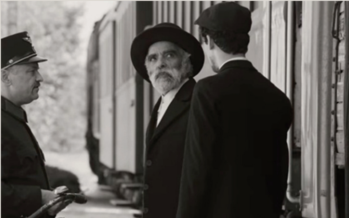
A screenshot from the film "1945."