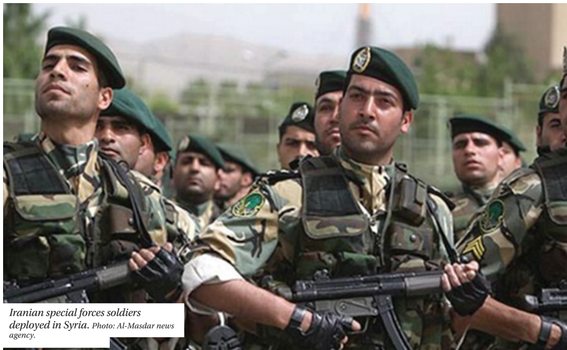
Iranian special forces soldiers deployed in Syria.