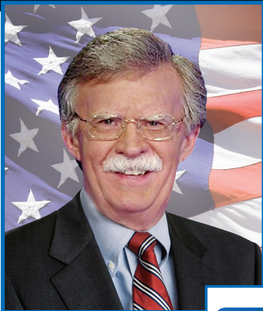
John Bolton US Former Ambassador to the United Nations

JOHN BOLTON & AYELET SHAKED TWO INCREDIBLE PATRIOTS DEDICATED TO ONE GREAT CAUSE