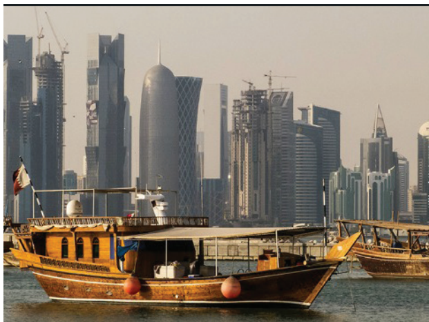
Doha, Qatar.