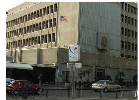
The US Embassy in Tel Aviv.

two years. Israel's Knesset must also approve the agreement due to the sensitivity and private nature of the government data that would be shared with US authorities.