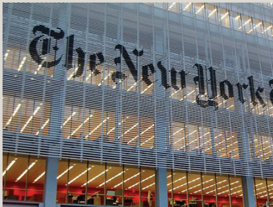
The headquarters of The New York Times.

The New York Times has added an "editor's note" and revised a travel section article about a California bakery with a mural depicting a Jew-killing Arab terrorist, after The Algemeiner criticized the original version of the article.