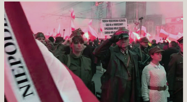
Far-right demonstrators marking the 99th anniversary of Polish independence in Warsaw.