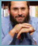
SHMULEY BOTEACH ENGELWOOD