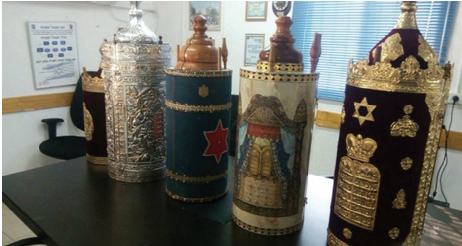
The Torah scrolls that were stolen from a Jaffa synagogue on Thursday and returned on Sunday.