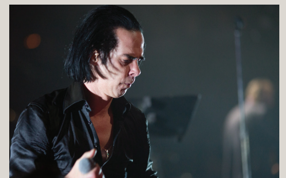
Nick Cave.

"So at the end of the day, there are two reasons why I'm here. One is that I love Israel and I love Israeli people, and two is to make a principled stand against anyone who wants to censor and silence musicians. So really, you could say in a way that the BDS made me play Israel," he said.