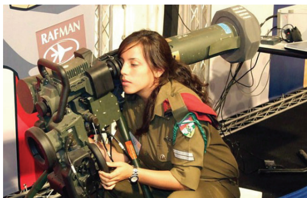
An Israeli soldier displays a Spike anti-tank missile launcher.

India is Israel's 10th-largest trade partner worldwide and its second-largest trade partner in Asia. In 2016, trade between Israel and India amounted to $4 billion.