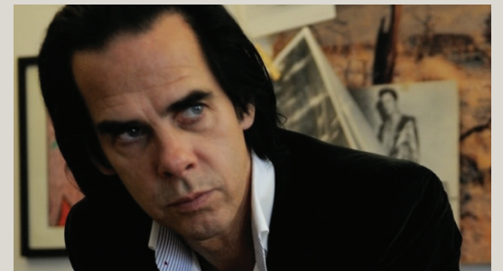
Nick Cave.

"What if it was your demolished home? Your invaded country? Your villages razed to the ground to build stadiums for the invaders to promote pop concerts on?" Waters said. "Nick thinks this is about censorship of his music? What? Nick, with all due respect, your music is irrelevant to this issue, so is