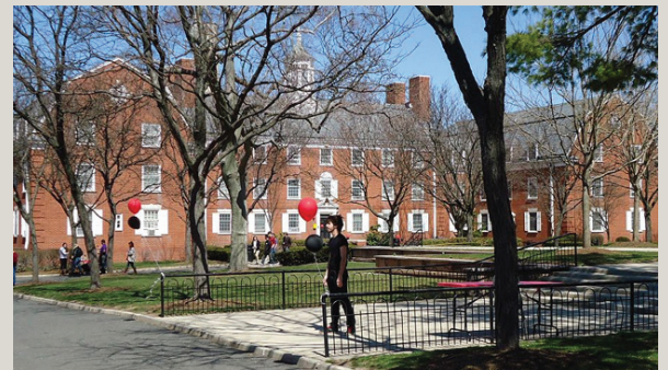
The College Avenue campus of Rutgers University in New Jersey.