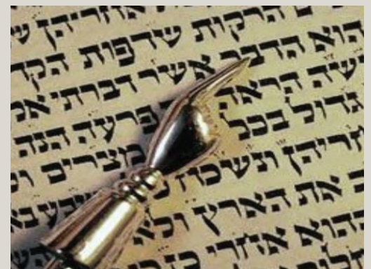
A Torah scroll.

Mourners ought to discipline ourselves to listen, to be polite and to be generous enough to recognize