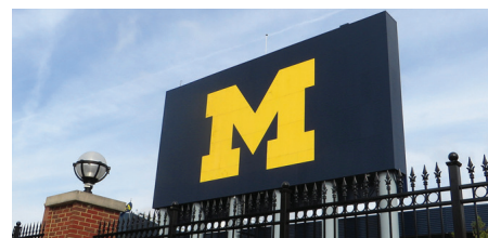
Michigan Stadium, at the University of Michigan, Ann Arbor.