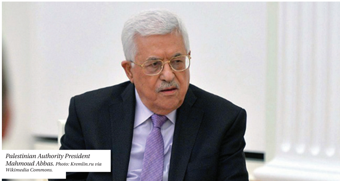
Palestinian Authority President Mahmoud Abbas.