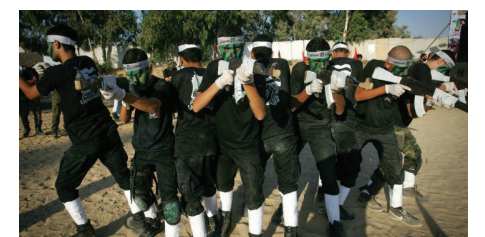
Palestinian youths participate in the graduation ceremony for a military-style camp organized by the Hamas terror group in Gaza on Aug. 18, 2017.

Yes, the Israeli army does arrest a significant number of Palestinian minors. That's because a significant number of Palestinian minors engage in terrorism. In the past two years, there have been at least 79 terrorist