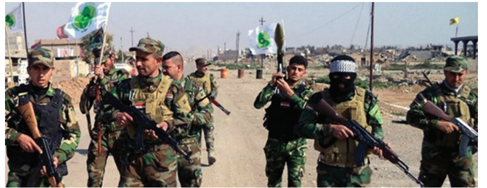
Hashd al-Shaabi fighters in Iraq.