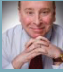
JONATHAN S. TOBIN JNS.ORG

What are the details of the Middle East peace plan that President Donald Trump will use to craft what he hopes is the “ultimate deal?” Sometime in the next few months, they will be unveiled as part of an effort to revive the dead-in-the-water peace process between Israel and the Palestinians. Though we’ll have to wait and see what exactly is in the proposal being cooked up by a team led by presidential son-in-law Jared Kushner and chief negotiator Jason Greenblatt, the only two things that seem certain are that it is likely to be acceptable to Saudi Arabia and that it will have zero chance of success.