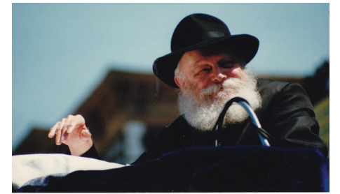
Menachem Mendel Schneerson, the Lubavitcher Rebbe.

At the conference, they announced the 100th country where Chabad has now opened. No doubt, with the sect's staggering birthrate and about half of all its members dedicating themselves to a lifelong posting, by the year 2020, Chabad will be fielding more than 15,000 emissaries in nearly all of the world's nations, and will be the mainstream Jewish branch in most. In countries like France, Russia, Australia and Britain, this has largely happened. But even in countries with robust and highly developed Jewish communities, like the United States and Canada, the smart money should be on