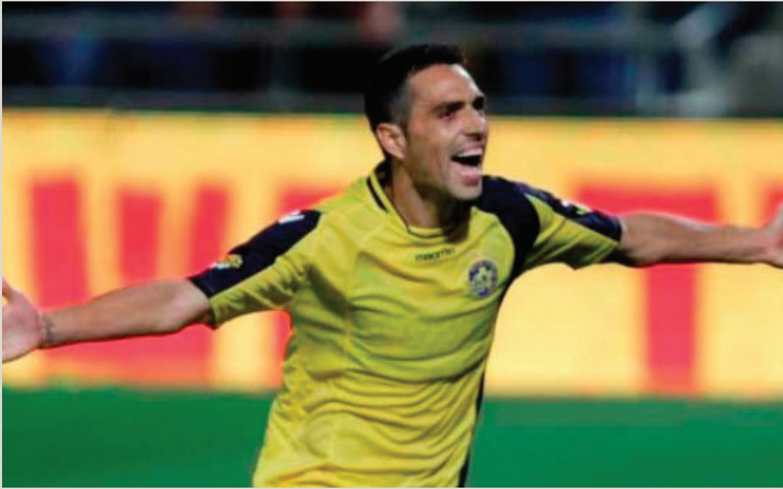
Israeli soccer star Eran Zahavi.