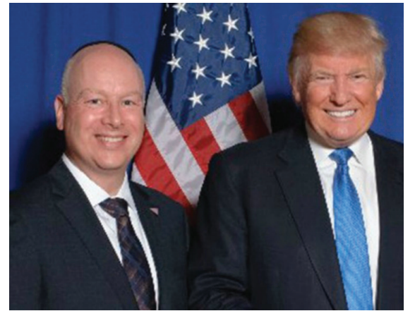
Jason Greenblatt with US President Donald Trump.

Critics of the #IsraelVictory idea mock its simplicity. But generations of would-be peacemakers have forgotten that it really is