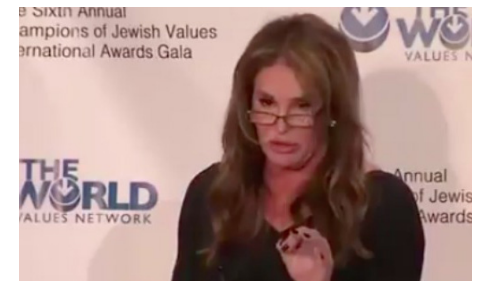
Caitlyn Jenner speaking at the 2018 Champions of Jewish Values International Awards Gala.