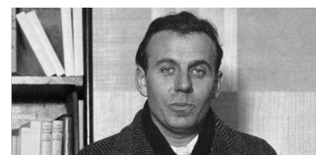
Louis-Ferdinand Céline.

That was why French President Emmanuel Macron explicitly addressed what has become a bitter domestic controversy in his remarks this week at the annual dinner in