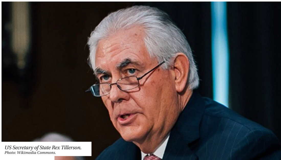
US Secretary of State Rex Tillerson.