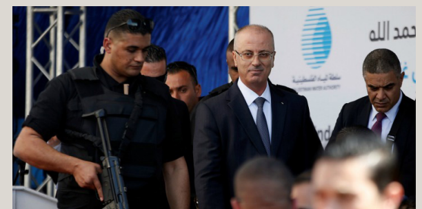
Palestinian Prime Minister Rami Hamdallah arrives at the inauguration ceremony of a waste treatment plant after an explosion targeted his convoy, in the northern Gaza Strip March 13, 2018.

There was no immediately claim of responsibility for what one Palestinian Authority security official in Gaza said was a roadside bomb blast.