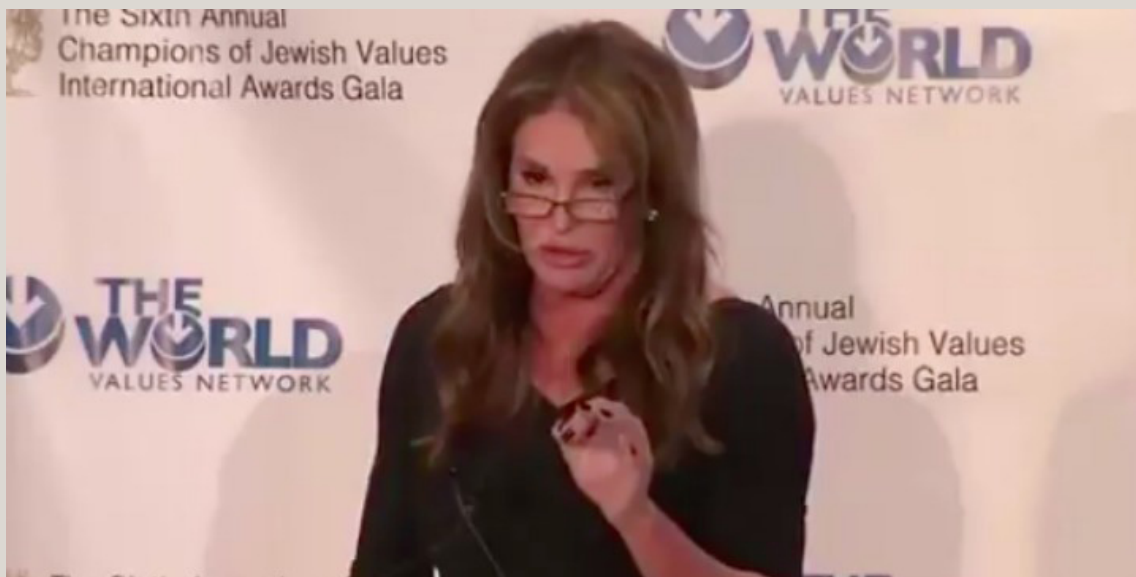
Caitlyn Jenner speaking at the 2018 Champions of Jewish Values International Awards Gala.