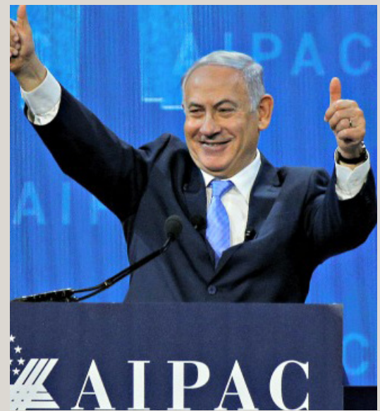
Israeli PM Benjamin Netanyahu addresses the 2018 AIPAC Policy Conference.

AIPAC should follow the lead of Senate Minority Leader Chuck Schumer, a Democrat who, concentrated on the fact that the Palestinians were responsible for the deadlock, condemned false moral equivalence and insisted that Jewish settlement building was not an obstacle to peace. He clearly stated that the problem lay in the Palestinian refusal to accept the existence of a Jewish state. He urged AIPAC supporters to educate young Ameri-