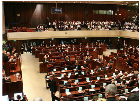
The Knesset.

November 2019. A snap poll that produced a strong vote for Netanyahu despite the corrup-