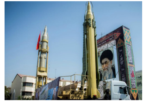
A display featuring missiles and a portrait of Iranian Ayatollah Ali Khamenei is seen at Baharestan Square in Tehran, Sept. 27, 2017.

This can be prevented. The Israeli government has thus far set clear red lines prohibiting the Iranians from building missile bases and ports in Syria and from transferring sophisticated weaponry to Hezbollah. These red