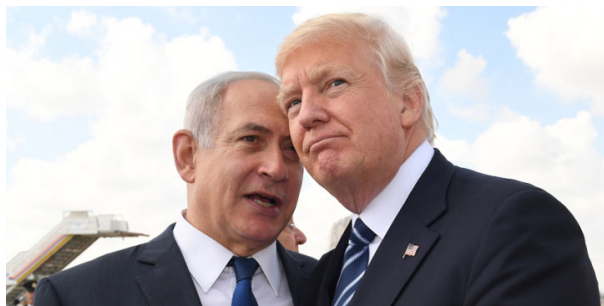
Israeli Prime Minister Benjamin Netanyahu and US President Donald Trump at Ben-Gurion International Airport, May 23, 2017.

"There is no way," he stated, "under these circumstances, with the gaps on the six core issues that define the Israeli-Palestinian problem — borders, security, refugees, Jerusalem, recognition of Israel as the nation-state of the Jews, and end of conflict and claims — that the prime minister of Israel and