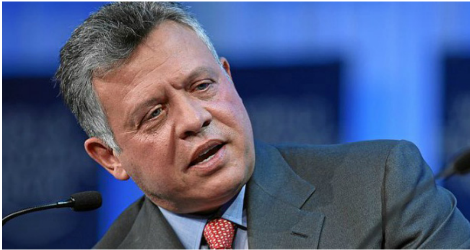
Jordanian King Abdullah II.