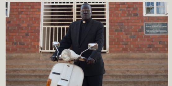
A photo from Ariel Tagar’s “Uganda’s Vespa Club,” in the Sony World Photography Awards competition.

Tagar, from Tel Aviv, was a photographer in the Israel Defense Forces before earning a photography degree from the London College of Fashion.