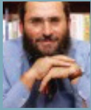
SHMULEY BOTEACH ENGELWOOD

In just a few weeks, Pamela Anderson and I will be releasing our new co-authored book Lust for Love: Rekindling Intimacy and Passion in Your Relationship .