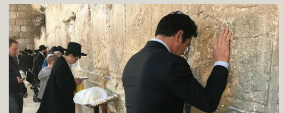
Dean Cain at the Kotel in Jerusalem.

On Wednesday, Cain visited the Western Wall, or Kotel, donning a "Superman" kippah at the holy site.