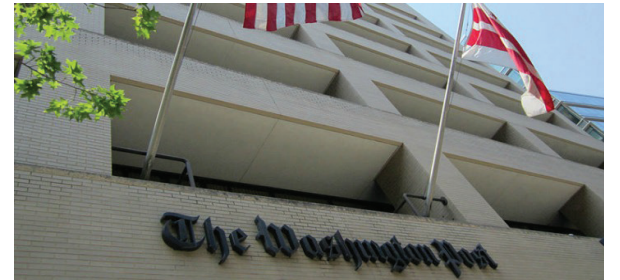
The former Washington Post building.

This is not a matter of mere semantics: combating terrorism begins with defining it. Numerous scholars and media personalities criticized Jukes' turn of phrase, explaining that