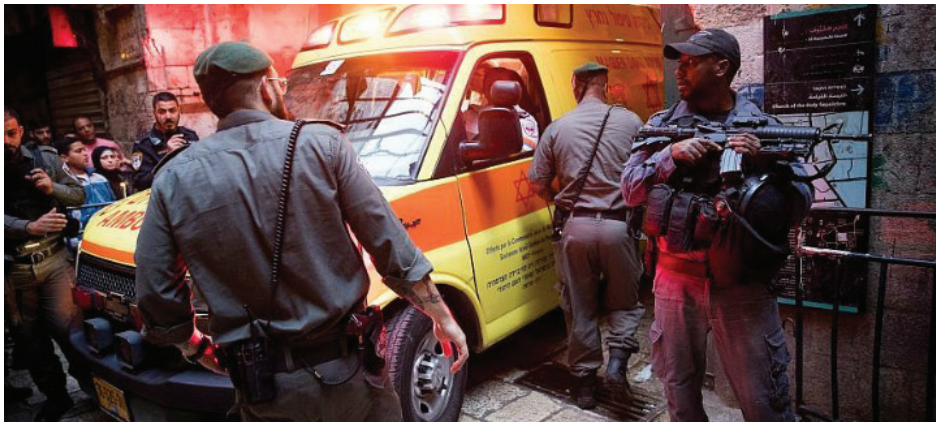
Israeli security personnel at the scene of a terror attack in the Old City of Jerusalem's Jewish Quarter, March 18, 2018.