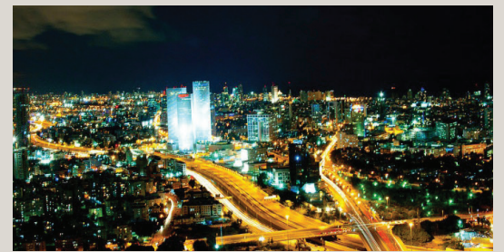
The Tel Aviv skyline at night.

Orbotech is the latest Israeli hi-tech firm to be acquired by an overseas giant, following the likes of