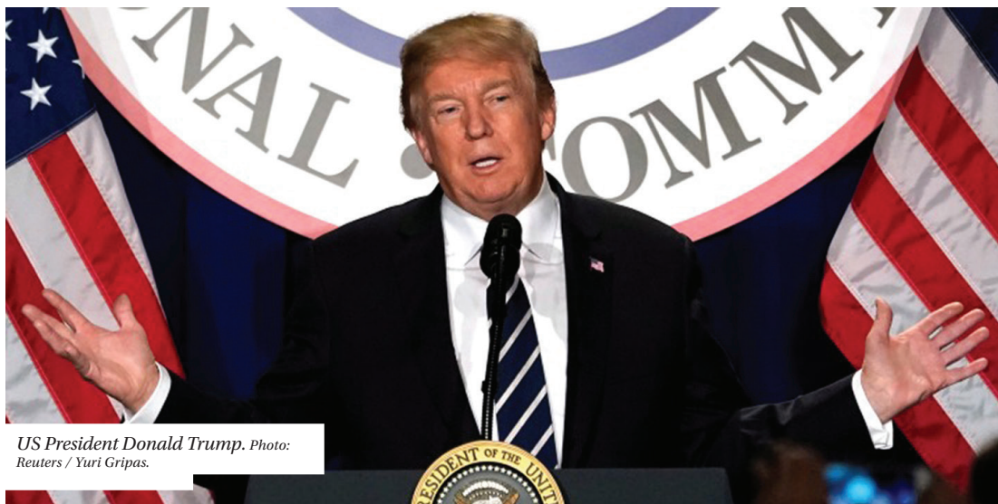
US President Donald Trump.