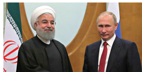
Iranian President Hassan Rouhani alongside Russian President Vladimir Putin at a November 2017 meeting in Sochi.

As the years went by, the red line policy turned from an empty mantra into a river