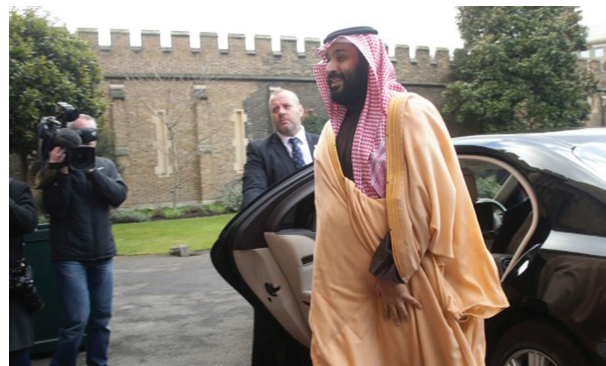
Crown Prince of Saudi Arabia Mohammed bin Salman arrives at Lambeth Palace, London, Britain, March 8, 2018.

Saudi state news agency SPA said the crown prince left