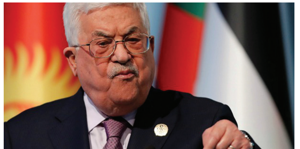
Palestinian Authority President Mahmoud Abbas.