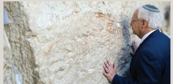
US Ambassador to Israel David Friedman at the Western Wall in Jerusalem, May 15, 2017.

Recounting how the American town of Bal Harbour once barred Jewish residents, Friedman said, "I wish I could say the old antisemitism is a thing of the past," but "with the internet, the old antisemitism has a distribution channel that the old antisemites ... could only have dreamed of. ... I worry about the old antisemitism, but I never doubt that we will prevail in our fight against it."