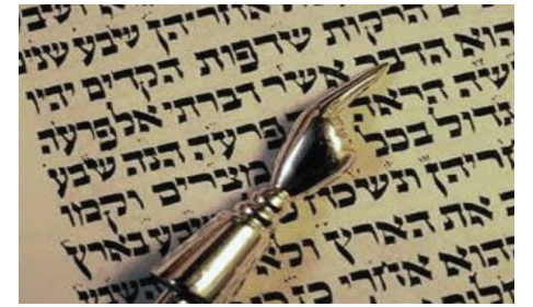
A Torah scroll.

The second law of lust is mystery. Lust is enhanced in darkness and shadows. Ironically, the more the body is covered, the more