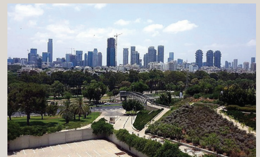
A view of the Tel Aviv skyline.

And yet, when you examine the variables used by the happiness report in the South African context, it's not hard to see why this is. According to the World Health Organization , the country's AIDS crisis is