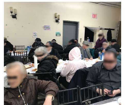
The week of chol hamoed Pesach

Please contact us now with your support and in these merits may we be blessed with a year of health, happiness, and nachas.