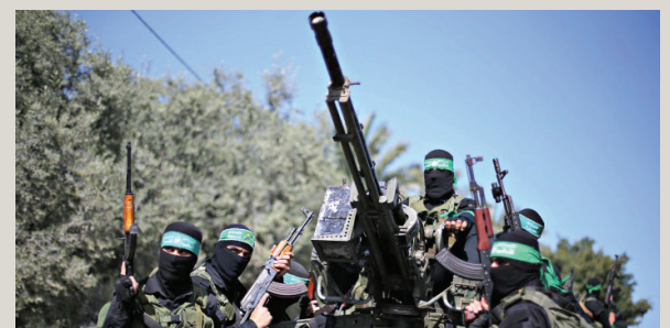
A Hamas military drill in the Gaza Strip in March 2018.

"The President should hold Qatar accountable for the destabilizing role it is currently playing in the Middle East,"