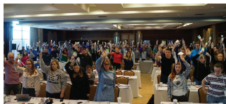
Members of the Union of Students in Ireland vote to support BDS campaign against Israel.