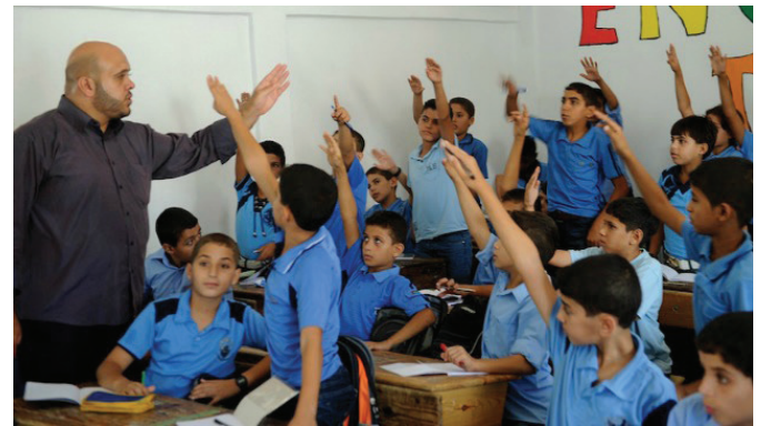
Palestinian students raise their hands in an UNRWA-run school.

As future Israeli Prime Minister Golda Meirson (Meir) told Israeli celebrants: "Our hands are extended in peace to our neighbors.