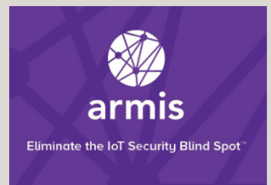
The Armis logo.

Red Dot Capital Partners, a Temasek-backed venture capital fund based in Israel, led the round with Bain Capital Ventures joining. Sequoia Capital