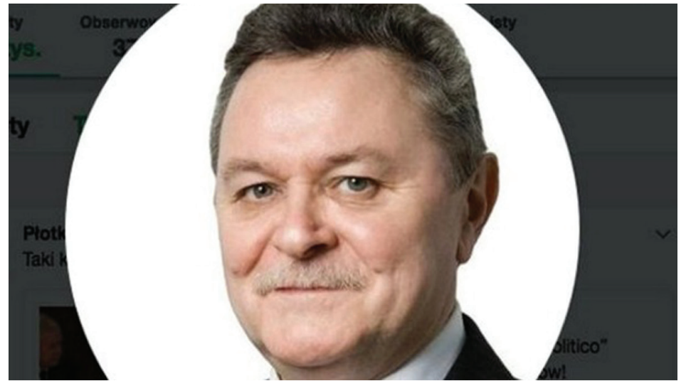
Polish businessman and former 'Poland Together' leader Kazimierz Plotkowski.