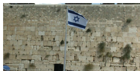
The Israeli flag at Jerusalem's Western Wall.

This recent past matters because the present figureheads of the left are either in denial about it or, in some cases, actually complicit in it. In the United States, Vermont Sen. Bernie Sanders has spoken out against the boycott, divestment and sanctions (BDS) campaign, but he has never questioned whether a political movement whose core goal is to return Jews to the situation they faced in 1945 should be considered "progressive" in the first place. In France, the leader of the populist left, Jean-Luc