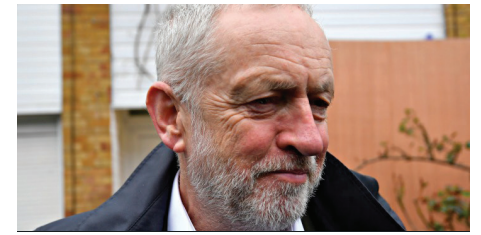
UK Labour Party leader Jeremy Corbyn outside his London home.

Last Monday, Corbyn attended a Passover seder held by the virulently anti-