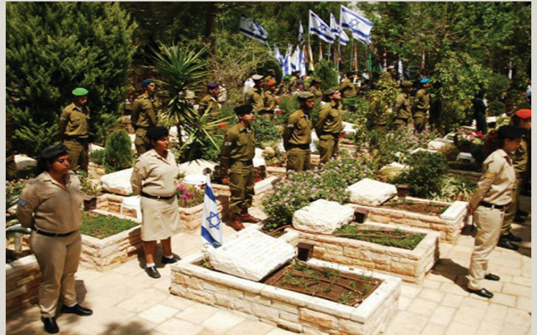
Graves of fallen IDF soldiers at the Mount Herzl military cemetery in Jerusalem.

To maximize participation, the website has been