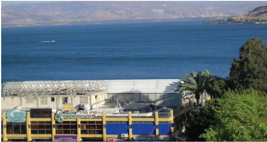
The Sea of Galilee.