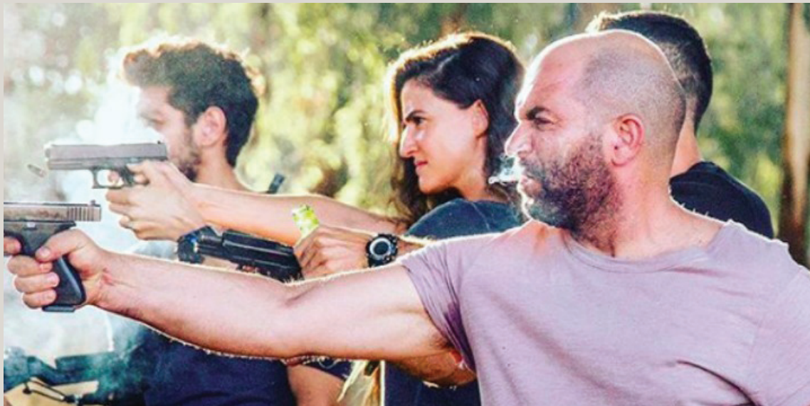
A promotional photo of the Netflix series "Fauda."