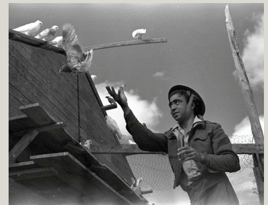
An Israeli Communication Unit soldier trains carrier pigeons in this December 1, 1949 file photo released by the Israeli Government Press Office (GPO) and obtained by Reuters on April 1, 2018.

"I think it is a duty, a duty, to all the youths and especially those who will be enlisted to the Israeli army's communication or intelligence units, to come and see how we started from nothing, with a pigeon, and what is reached today, with satellites."