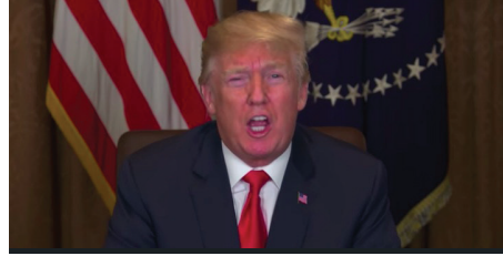
US President Donald Trump.

According to the words attributed to Abraham Lincoln, "You can fool all the people