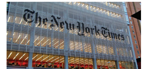
The headquarters of The New York Times.

The Times has been insisting that the Gaza riots were "ignited by isolation and economic deprivation." A good question for the newspaper's intrepid Gaza-based journalists to pursue might be who paid for the pizza and cakes, and who caused them to be delivered to the riot site? They may have been "free" to the rioters, but someone must have paid at some point for their ingredients, production, and delivery. Instead the Times account has them arriving almost magically, a kind of immaculate pizza delivery, a Domino's ex-