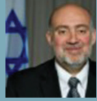
RON PROSOR NEW YORK

The five days that it took the US administration to respond to a chemical weapons attack in Syria were vital for two reasons: First, to consolidate a diplomatic coalition with two other UN Security Council member states. Second, to define the military targets that would send a clear message that the use of chemical weapons crosses a red line. And all this without undermining Syrian President Bashar Assad's regime and, as a result, changing the rules of the game with Russia.