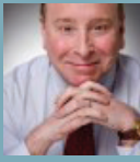
JONATHAN S. TOBIN JNS.ORG

If the sole criteria by which Donald Trump's actions in Syria should be judged are to be compared with his predecessor, then perhaps the claim of "mission accomplished" might be accurate.