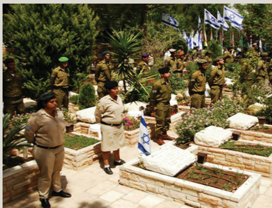
Graves of fallen IDF soldiers at the Mount Herzl military cemetery in Jerusalem.