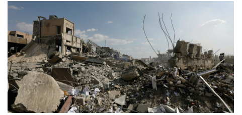
The remains of the Syrian regime's Scientific Research Centre in Damascus, April 14, 2018.

If the message Trump is sending to Assad is that he can go on killing people — though not with chemical weapons — that is just as much of an abdication of America's moral authority as Obama's spineless responses.