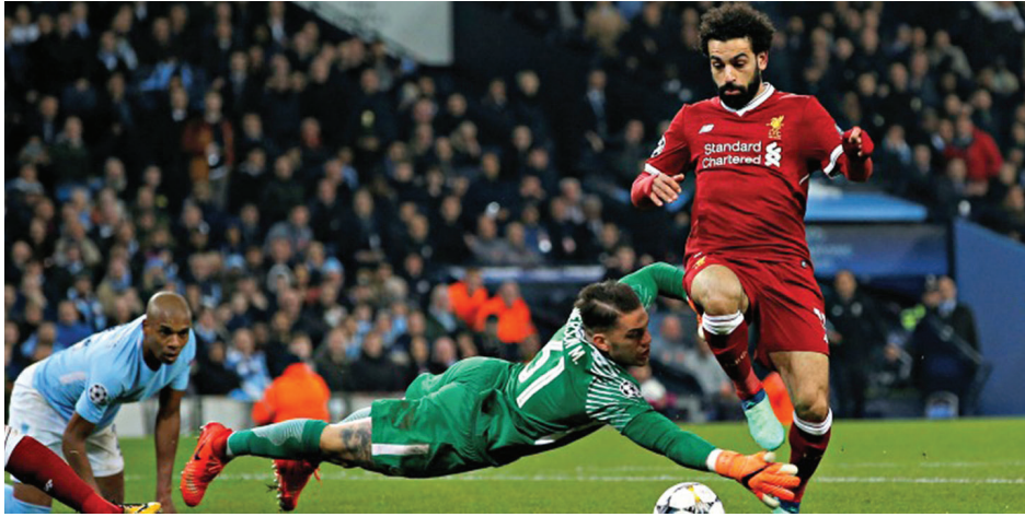
Liverpool striker Mohamed Salah scores against Manchester City in the UEFA Champions League.