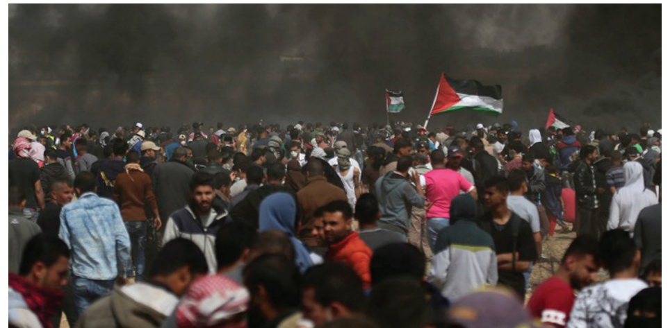
A Palestinian riot on the Israel-Gaza Strip border, April 13, 2018.