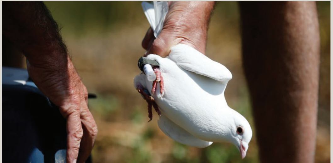
Pigeon handler Haim Wolf holds a carrier pigeon in Kibbutz Givat Brenner, Israel, April 1, 2018.

After being deserted for decades, the restored