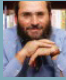
SHMULEY BOTEACH ENGELWOOD

Barack Obama is a moral man. But as president, he had an amoral foreign policy. Obama and his national security trio of John Kerry, Susan Rice, and Samantha Power regularly obfuscated on clear-cut moral issues, like whether or not Iran should be penalized for genocidal incitement against Israel; whether Hamas should be punished for terrorism; and, most importantly, whether the United States should attack Bashar Assad for gassing Arab children.