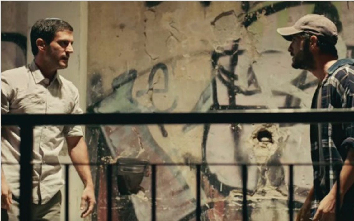
A scene from "When Heroes Fly." Photo: Screenshot.