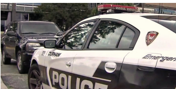
Police in Durham, NC have been barred from "military-style training" by the City Council.

"It would be a shame that we would not be allowed to interact with police departments solely because someone believes we will be tainted," he said.