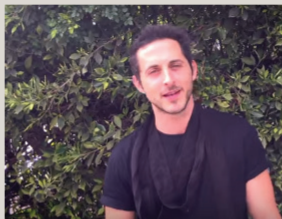
Tomer Kapon