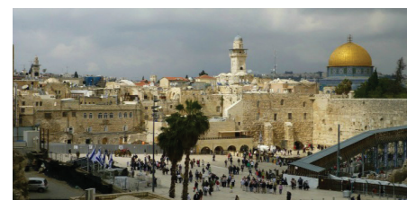
The Western Wall and Temple Mount in Jerusalem.

But such challenges, important as they are, cannot be allowed to overshadow Israel's remarkable achievements.