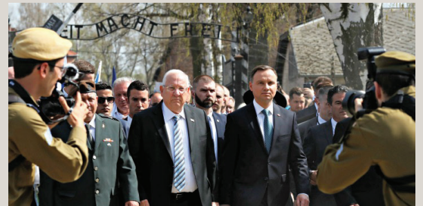
Israeli President Reuven Rivlin and Polish President Andrzej Duda arriving at the 2018 "March of the Living" at the site of the Auschwitz death camp built by the Nazis.