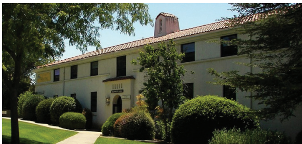
Jespersen Hall at California Polytechnic State University.

Students addressed the offensive images at an emergency town hall meeting held last Monday, after which the Drylongso Collective campus