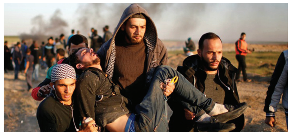
A wounded Palestinian is evacuated during clashes with Israeli troops at a protest, at the Israel-Gaza border on April 1, 2018.

The Times is on hair-trigger alert for swastikas and other fascist imagery on the pro-Trump American right. Yet here they are publishing an op-ed falsely depicting swastika and fire-bomb bearing kites as "nonviolent," as if they were a folkdance or a couscous dish. No wonder the Israeli diplomat calls it "terrible."