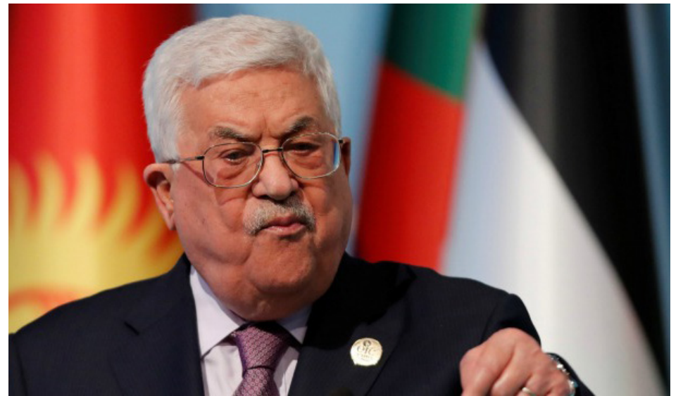
PA President Mahmoud Abbas.