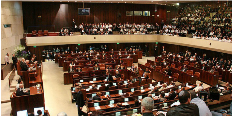
Israel's Knesset.