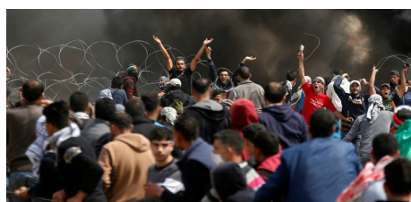
Unrest on the Israel-Gaza Strip border on Friday, April 27, 2018.

Since its founding in the late 1960s, the PFLP has been responsible for numerous terrorist attacks targeting Israelis, including airplane hijackings and suicide bombings.