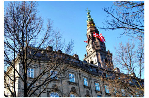
Anti-circumcision campaigners are pushing the Danish Parliament for an outright ban on the practice.

Rabbi Goldschmidt asserted that the momentum for the legislation in Iceland had come from Denmark. Danish anti-circumci-