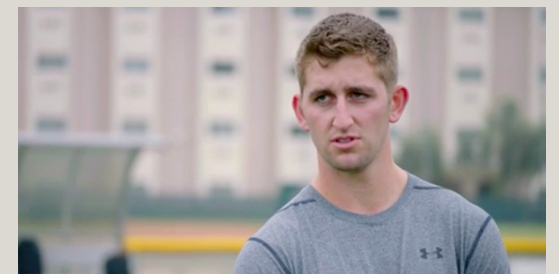
Josh Rosen.

Former UCLA quarterback Josh Rosen told NFL.com that his Jewish heritage has made him an easy target for his competitors. The 21-year-old said, “I get