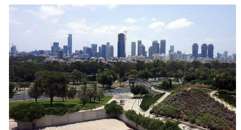
A view of the Tel Aviv skyline.

The man will be brought for a hearing on Sunday and will be charged with attempted kidnapping, assault and battery.