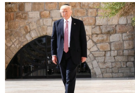
President Donald Trump visits the Western Wall in Jerusalem, May 22, 2017.

"The American Jewish community is a shining example of how enshrining freedom of religion and protecting the rights of minorities can strengthen a nation," Trump declared. "Through their rich culture and heritage, the Jewish people