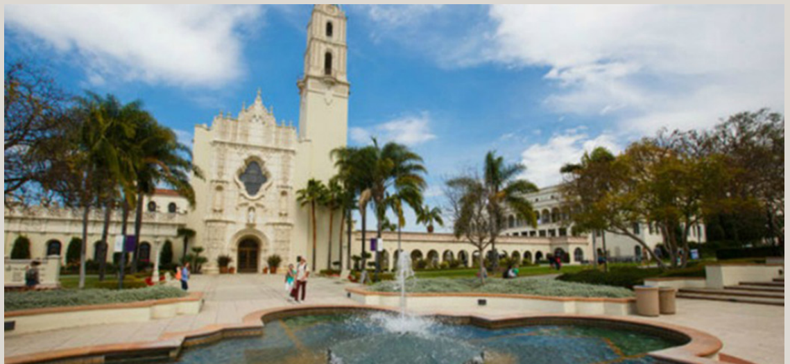
UC San Diego.

architecture. So, it's not just the border that makes the United States a delineated country. The border works in more complex ways. Yes, it's an invisible wall, but it's also heavily militarized, weaponized to perpetuate violence that is also in complex relationship to the prison-industrial complex. So the prisons, the military, and the border [impact] migration which targets specific communities, those most vulnerable to