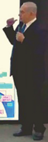
Israeli PM Benjamin Netanyahu reveals Iran's atomic archive.