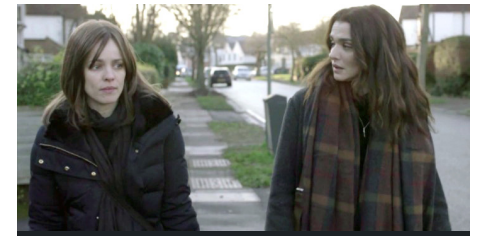
Rachel Weisz, right, and Rachel McAdams in a scene from “Disobedience.”

together in an erotic charge can provide for a far deeper understanding than a conversation or the exchange of ideas. But then, knowing someone experientially is always superior to knowing them intellectually. The heart has always been superior to the mind. That Hollywood, with its insistence on sexual lasciviousness as opposed to erotic connection, is blind to this truth speaks volumes about its blissful ignorance of relationships and how sex has been degraded by popular culture.