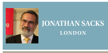
JONATHAN SACKS LONDON

Time management is more than management and larger than time. It is about life itself. God gives us one thing above all: life itself. And He gives it to us all on equal terms. However rich we are, there are still