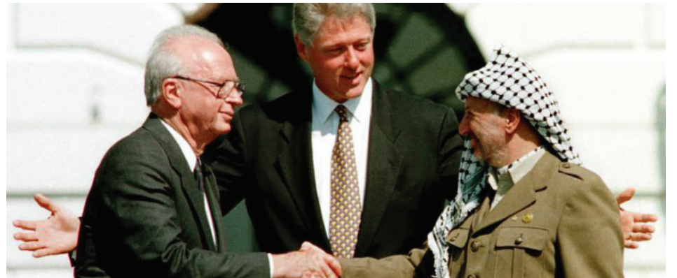
The signing of the Oslo Accords in Washington, DC, Sept. 13, 1993.

The Palestinian nationalist movement was always a mirror image of Zionism. In other words, it was born out of and in response to the Jewish national movement.