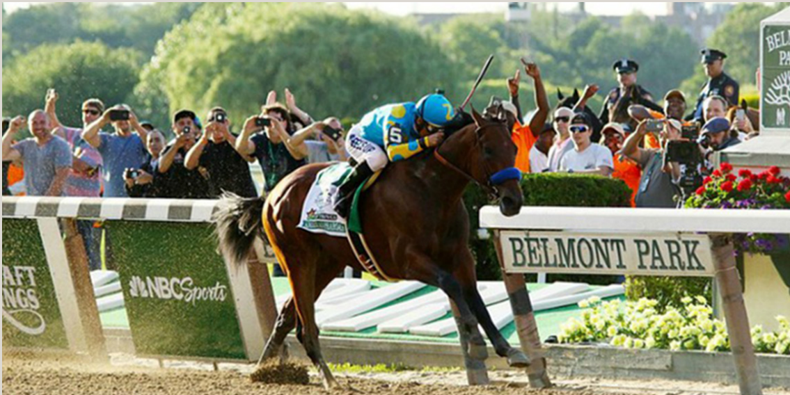
American Pharoah.