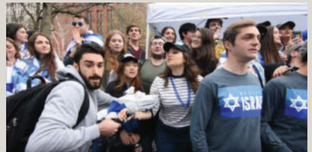
A student grabs a microphone at a Realize Israel party held on April 27, 2018.

The unnamed students — who are affiliated with Students for Justice in Palestine and Jewish Voice for Peace (JVP), respectively — were taking part in a demonstration at Washington Square Park, where hundreds had congregated