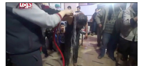
A man is washed following an alleged chemical weapons attack in Douma, Syria on April 8, 2018.