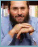
SHMULEY BOTEACH ENGELWOOD

I grew up in 1970s and '80s America. It was a time inspired by soaring declarations of America as a guarantor of liberty and guardian of freedom — best captured in JFK's unforgettable inaugural address: "Let every nation know, whether it wishes us well or ill, that we shall pay any price, bear any burden, meet any hardship, support any friend, oppose any foe to assure the survival and the success of liberty."