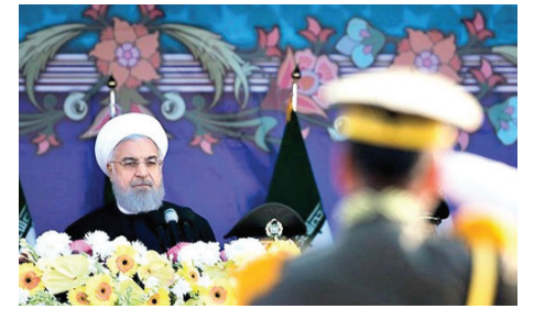
Iranian President Hassan Rouhani attending Army Day ceremonies in Tehran on April 18.

Trump has twice attacked Assad for gassing Arab children. Ambassador to the UN Nikki Haley has worked to reverse decades of anti-Israel and antisemitic behavior at the UN. The Trump administration has taken a harder line on Palestinian terror and violence.