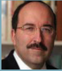
DORE GOLD JERUSALEM

Revelations over the last 10 years have left little doubt that Tehran has been seeking a nuclear weapon, no matter what its spokesmen claimed. But the revelations put forward by Prime Minister Benjamin Netanyahu on April 30 came from original official documents with the stamp of the Iranian regime.