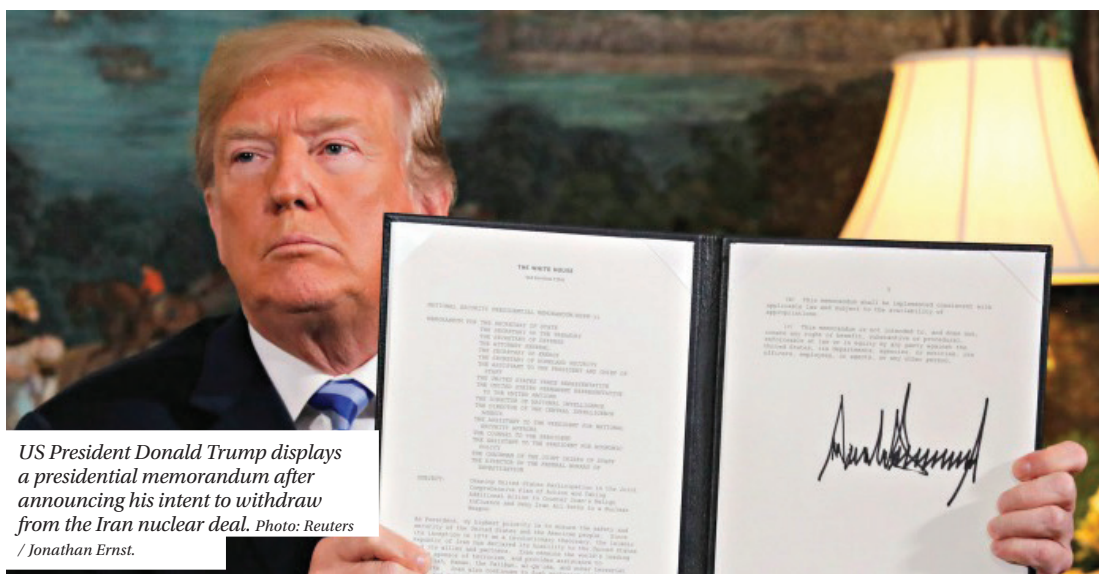
US President Donald Trump displays a presidential memorandum after announcing his intent to withdraw from the Iran nuclear deal.