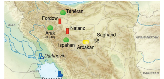
A map of nuclear facilities in Iran. Photo: Semhur via Wikimedia.

Take, for example, the assertion frequently made during these talks that Iran could not possibly have been working on a nuclear bomb because of the fatwa. Obama made reference to the fatwa on September 27, 2013. Then, on November 24, 2013, Kerry spoke about the fatwa and the fact that Iranian Foreign Minister Zarif had made reference to it. A spokesman for the US National Security Council stated at that