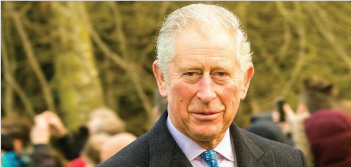
Prince Charles.