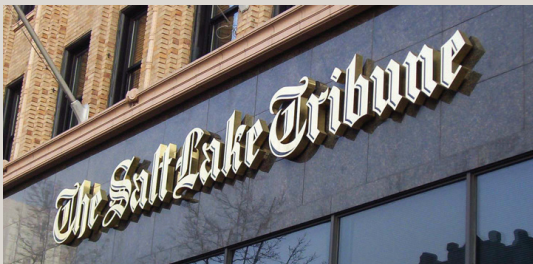
The marquis of The Salt Lake Tribune building in Salt Lake City.

Yes, Robinson is comparing the Holocaust to "little