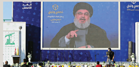
Hezbollah leader Hassan Nasrallah addresses an April 15 election rally in the Bekaa Valley via a video link.

“When Hezbollah wins, it means that Iran has won in Lebanon,” observed Hanin Ghaddar — a prominent Lebanese journalist who is now a visiting fellow at the Washington Institute for Near East Policy think tank — as results showed Prime Minister Saad Hariri’s pro-western Future Movement losing up to one-third of its parliamentary seats.