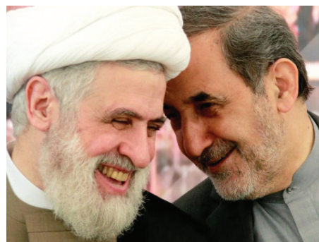
Deputy Hezbollah leader Naim Qassem (L) alongside leading Iranian regime adviser Ali Akbar Velayati (R) at a conference in Beirut in 2016.

Hezbollah's political gains in Lebanon come at a time of heightened tension between Israel and Iran in Syria, as well as growing speculation on the future direction of US policy toward Iran, as President Donald Trump exits the nuclear deal of 2015.