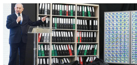
Israeli Prime Minister Benjamin Netanyahu presents thousands of documents on the Iranian nuclear program, April 30, 2018.