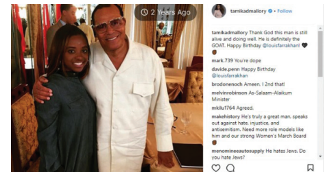
Tamika Mallory, co-president of the Women's March, posing with Nation of Islam leader Louis Farrakhan.

racism, as well as the work of human-rights defenders there."