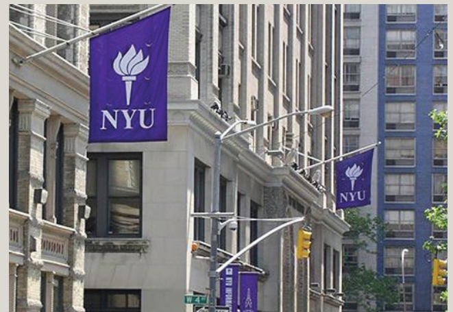
The New York University campus.

One of the anti-Israel students who was detained was arrested for burning an Israeli flag. He faced charges of second-degree reckless endanger-