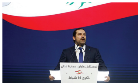
Lebanese Prime Minister Saad Hariri.

The resolutions relate to the withdrawal of all foreign forces from Lebanon and the disarmament of all militias including Hezbollah.