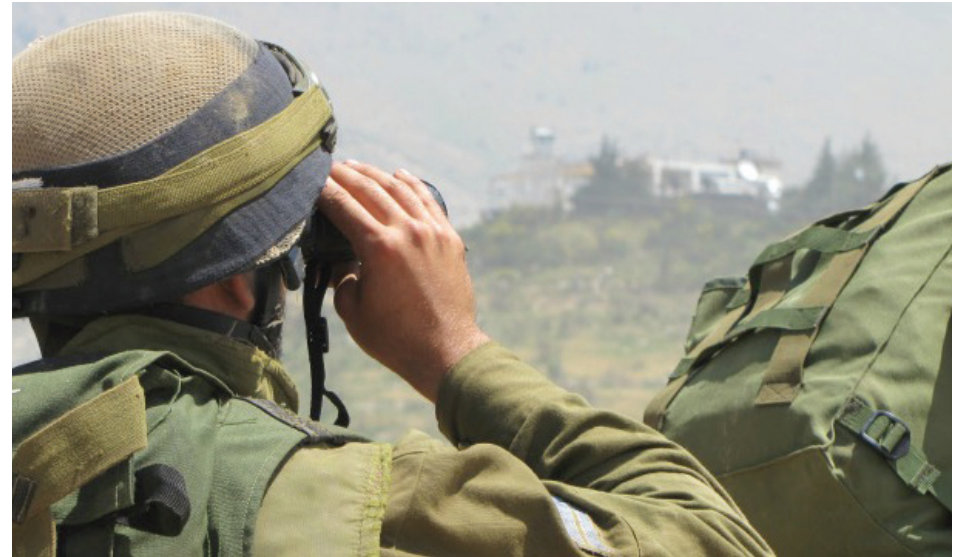
An IDF soldier looks into southern Syria from the Israeli side of the border.