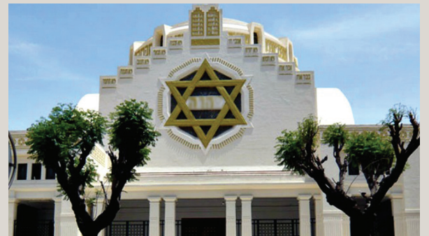
The Grande Synagogue in Tunis.

The 45-year-old man tried to stab a group of police officers standing guard at the Grande Synagogue on Avenue de La Liberté in the Tunisian capital — an imposing structure opened in 1933 that is no longer in regular use by the