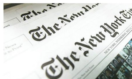
The New York Times logo.