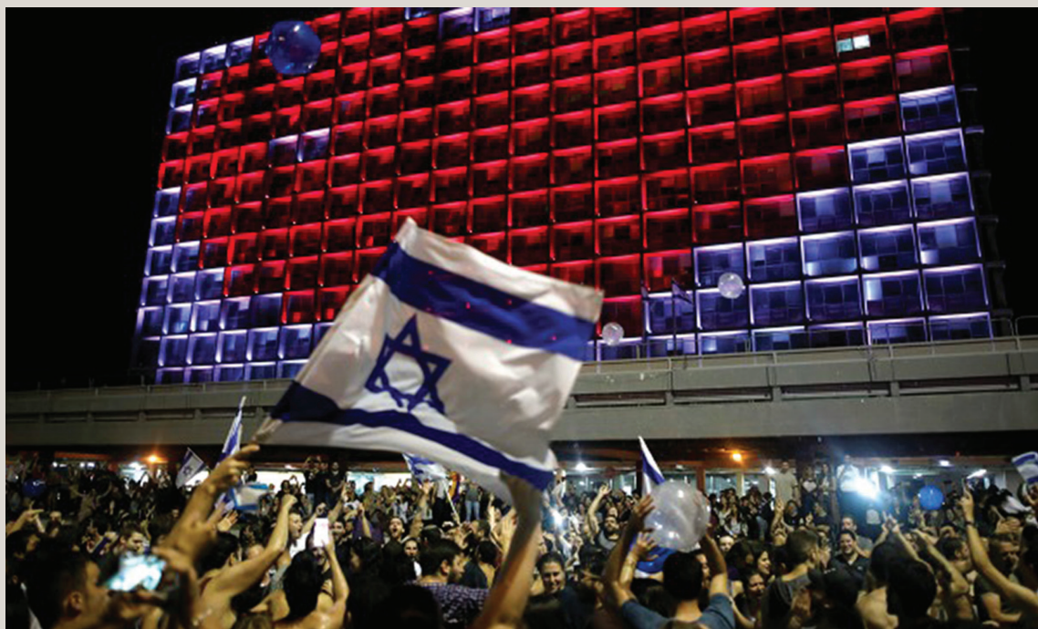
Israeli fans celebrate at Rabin Square in Tel Aviv, after Netta Barzilai won the Grand Final of Eurovision Song Contest, May 13, 2018.