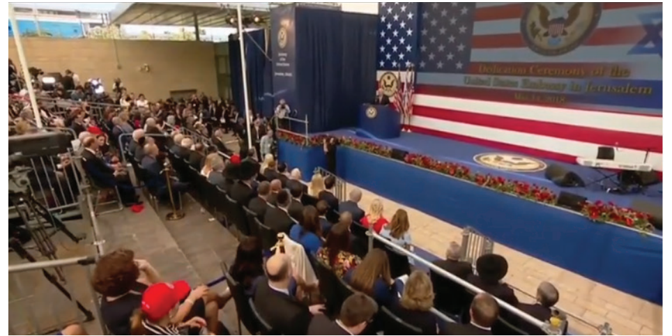
Jerusalem US Embassy opening. Photo: Screenshot