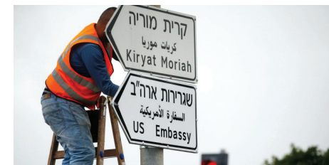
A worker hangs a road sign for the US embassy in the area of the US consulate in Jerusalem on May 7, 2018.

Commentators have been quick to attack Trump's decision based on the opposition of our European allies to withdrawing from the deal. They have largely ignored the Middle Eastern allies who are directly and immediately threatened by Iran. The Saudis have been calling for tougher action against Iran for years. In fact, they are the only ones to publicly suggest the need