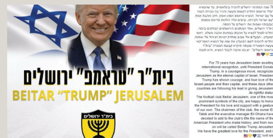
Post by Beitar Jerusalem soccer team, announcing its name change to "Beitar Trump Jerusalem."

The team, whose yellow-and-black colors feature a traditional Jewish menorah in its logo, took to Facebook to thank US President Donald Trump for recognizing Jerusalem and moving the American embassy from Tel Aviv to the capital.