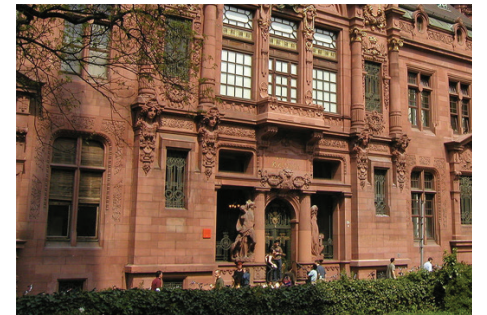
Heidelberg University.