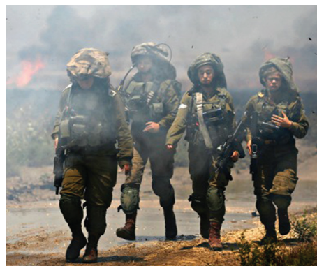
IDF soldiers on patrol near a burning field on the Israeli side of the border between Israel and the Hamas-ruled Gaza Strip.

"In some cases, including during the current wave of violence, we have seen Hamas present their fighters as innocent civilians; numerous fake incidents staged and filmed which purport to show civilians being killed and wounded by Israeli forces; and films of violence from elsewhere, eg. Syria, portrayed as violence against Palestinians," Kemp continued.