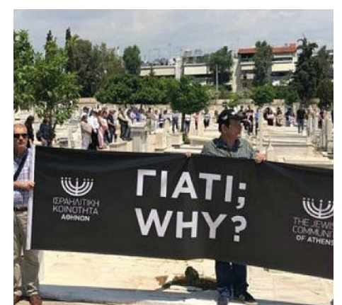
A protest held in Athens following the desecration of a Jewish cemetery.