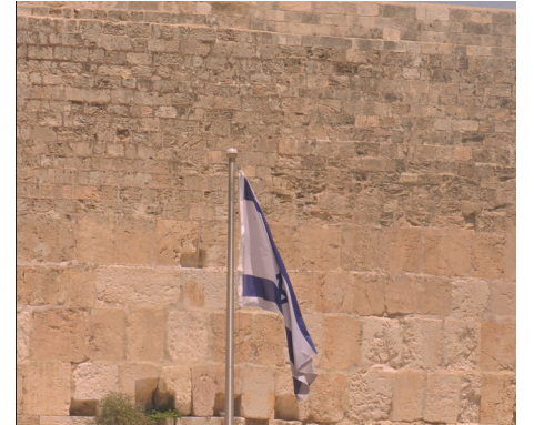
The Israeli flag at Jerusalem's Western Wall.

For eight years, President Bush had the chance to do just that. For eight years, however, he balked.