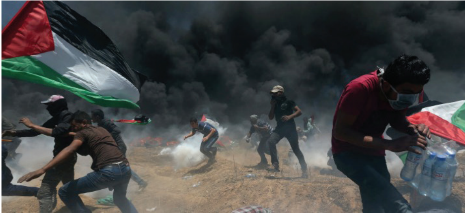
Palestinians riot on the Israel-Gaza Strip border, May 14, 2018.