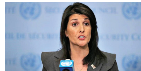
US Ambassador to the UN Nikki Haley.

Showing a photograph of the Kerem Shalom border crossing that was set ablaze by