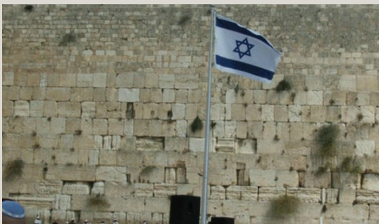
The Israeli flag at Jerusalem's Western Wall.

Six months ago, when the president declared his intention, the predictors of doom and gloom rose up. The Palestinians declared three days of rage over the