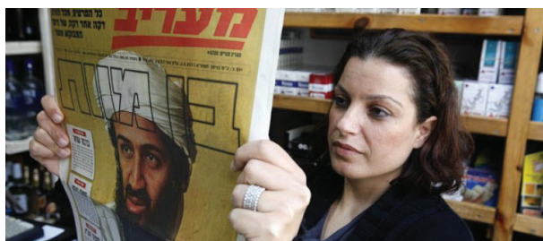
Israelis read about the death of Al Qaeda leader Osama bin Laden, in the newspaper on May 03, 2011.

Hamas called on Gazans to engage in violent protests and break through the security fence with Israel on Monday, at the same time as the US embassy inauguration festivities would occur in Jerusalem.