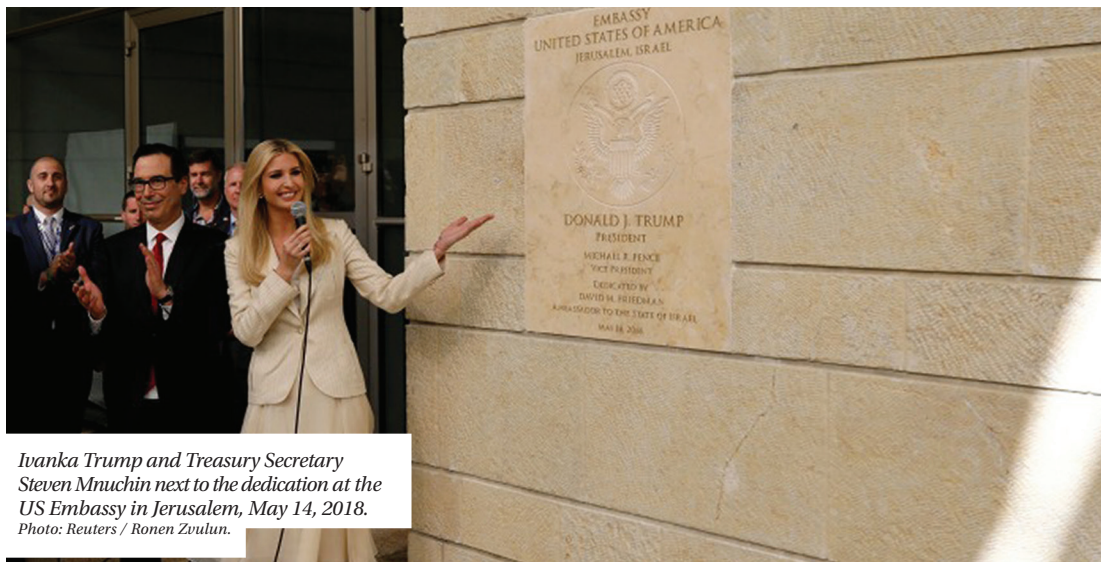
Ivanka Trump and Treasury Secretary Steven Mnuchin next to the dedication at the US Embassy in Jerusalem, May 14, 2018.