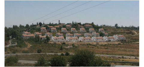
An Israeli community in Samaria.

Third, you can see Joseph’s Tomb in the heart of the city. The Palestinians are obligated to allow Jews to visit the shrine and protect it, but Jews do not have unfettered access to this holy place — something that Palestinians demand of their sacred sites. Worse, the Palestinian Authority (PA) has allowed the tomb to be repeatedly attacked and desecrated.