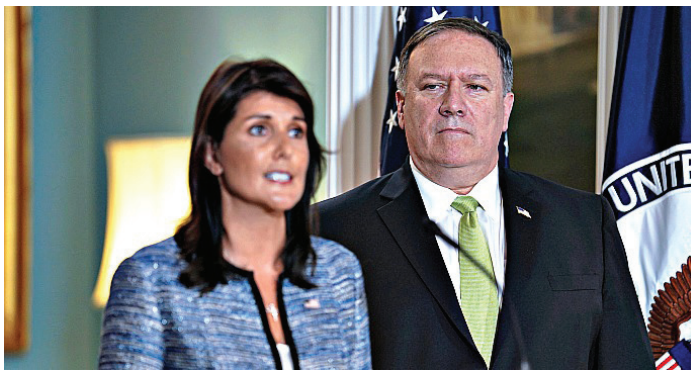
US Ambassador to the UN Nikki Haley and Secretary of State Mike Pompeo announcing US withdrawal from the UN Human Rights Council.

government welcomed the US announcement that its tenure on the Council was now at an end. "The United States has proven, yet again, its commitment to truth and justice and their unwillingness to allow the blind hatred of Israel in international institutions to stand unchallenged," Israel's Ambassador to the UN, Danny Danon, said in a statement.