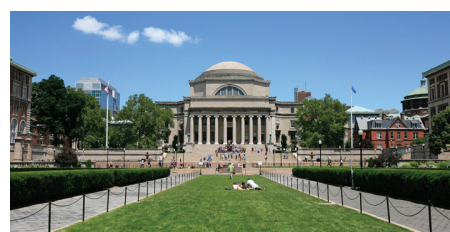
Low Memorial Library at Columbia University.

Although the list is quite long, many University of Chicago students remain unprotected from the harassment and intolerant behaviors that could impede their free speech and full participation in campus life. If in implementing its free speech statement, the university were to rely on its own harassment policy — using it as a standard for determining when a student’s freedom of expression had