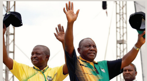
South African President Cyril Ramaphosa (r) and ANC Deputy President David Mabuza wave to supporters at the ANC's 106th anniversary celebrations.

Fear of an angry reaction from US President Donald Trump, along with the belief that "a large part of the global economy" is controlled by Jews, are among the reasons cited for the clash.