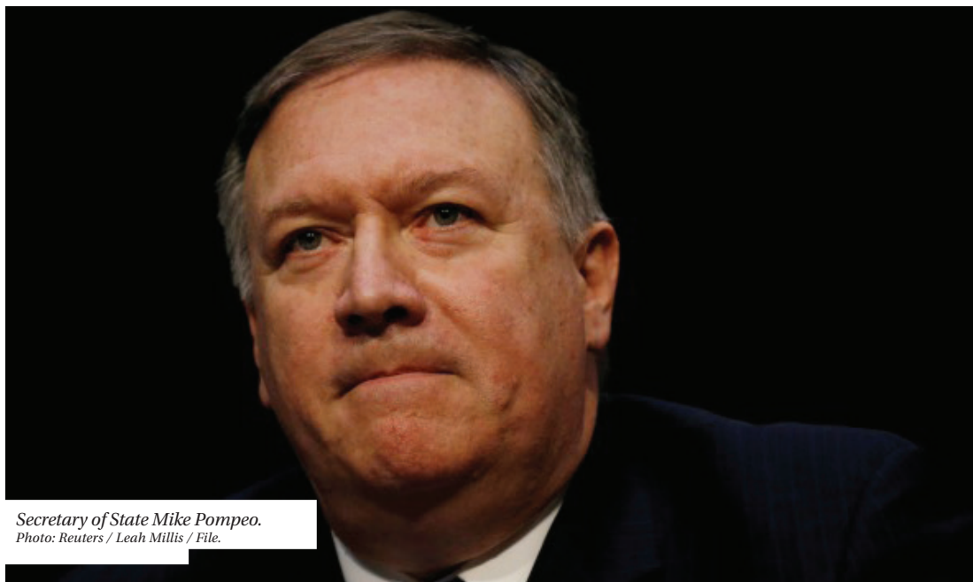
Secretary of State Mike Pompeo.