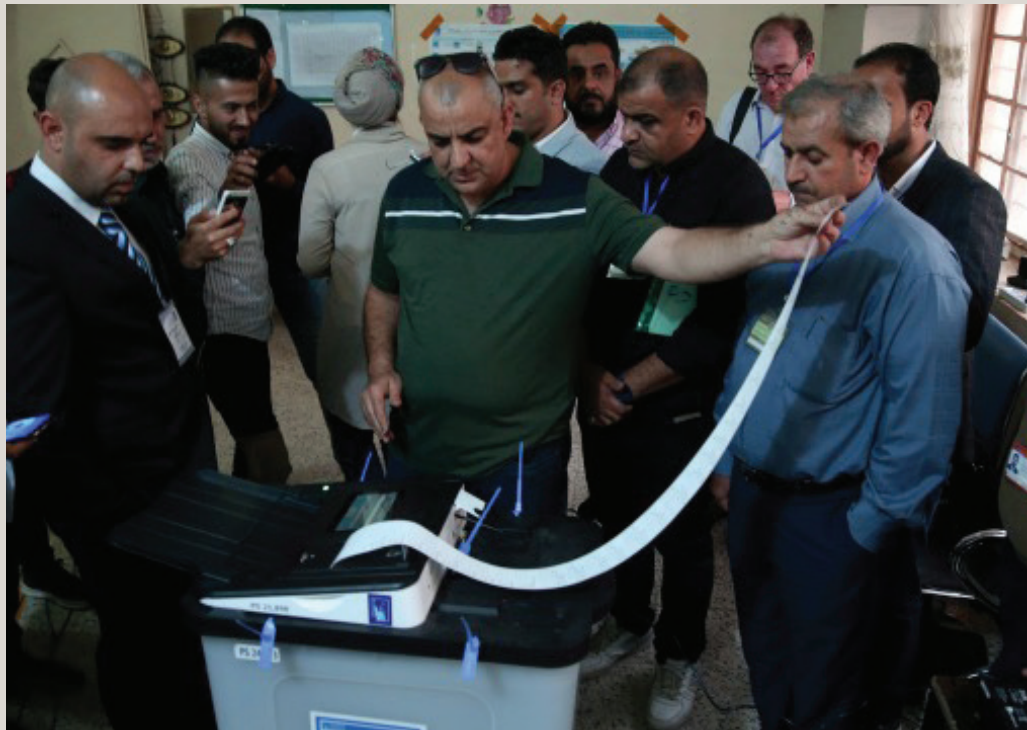
Iraq’s Independent High Electoral Commission employee closes a ballot box at a polling station during the parliamentary election in Baghdad, Iraq, May 12, 2018.

“We should not trust a group of people who are terrorizing their own people, terrorizing neighbors in Iraq, Syria, and Lebanon, and who