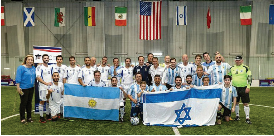
Israeli-American and Argentinian-American soccer teams at a friendly match in Las Vegas.