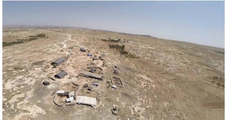
Aerial view of the illegal Nawaja outpost at Susiya.