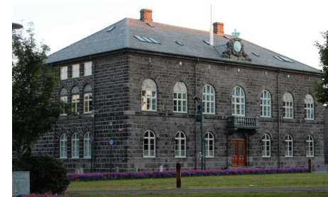
Parliament House in Reykjavik.

There are many things that can be said about the Lubavitcher Rebbe on the occasion of the 24th anniversary of his passing — which was commemorated this past Shabbat. But for now, I will focus on just one thing. The Rebbe