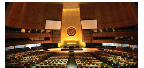
The United Nations General Assembly hall.

Yet even most of us who care about these issues tend to treat the UN's actions as mere rhetoric. While this is true, we're wrong to