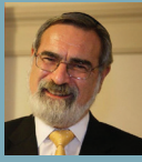
JONATHAN SACKS LONDON

Chukat is about mortality. In it we read of the death of two of Israel's three great leaders in the wilderness, Miriam and Aaron, and the sentence of death decreed against Moses, the greatest of them all. These were devastating losses.