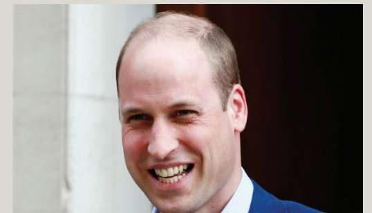
Britain’s Prince William leaves the Lindo Wing of St Mary’s Hospital after his wife Catherine, the Duchess of Cambridge, gave birth to a son, in London, April 23, 2018.

Jerusalem Affairs Minister of Knesset Ze’ev Elkin called the reference “regrettable,” and said “United Jerusalem has been the capital of Israel for 3,000 years and no distortion in the tour itinerary can change that reality.”