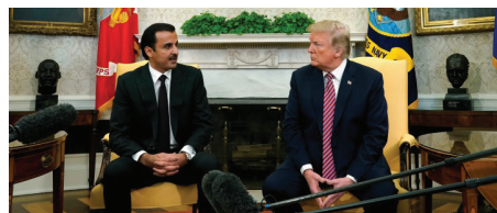
US President Donald Trump meets with Qatari Emir Sheikh Tamim bin Hamad al-Thani, 2018.

In his call with Rouhani, Emir al-Thani added that he would "never forget" Iran's solidarity with Qatar in its year-long dispute with Saudi Arabia and a coalition of allied Arab states. He assured the Iranian president that he was "personally observing" the development of closer relations with Tehran.