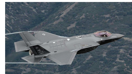
A U.S. Air Force F-35A Lightning II aircraft.

From its inception in the 1990s, the F-35