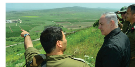
Israeli Prime Minister Benjamin Netanyahu (second from left) pictured during a security and defense tour of the strategic Golan Heights region near Israel's northern border with Syria, April 2016.

In 1970, the militarily superior, USSR-supported Syria invaded the militarily inferior