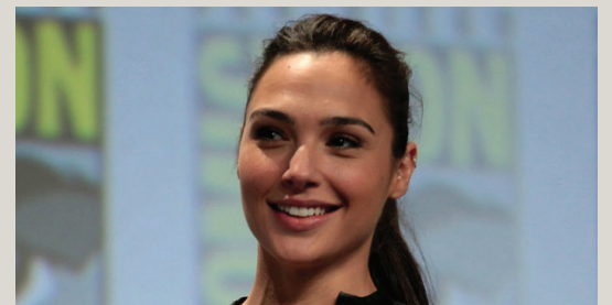
Israeli actress and ‘Wonder Woman’ star Gal Gadot.