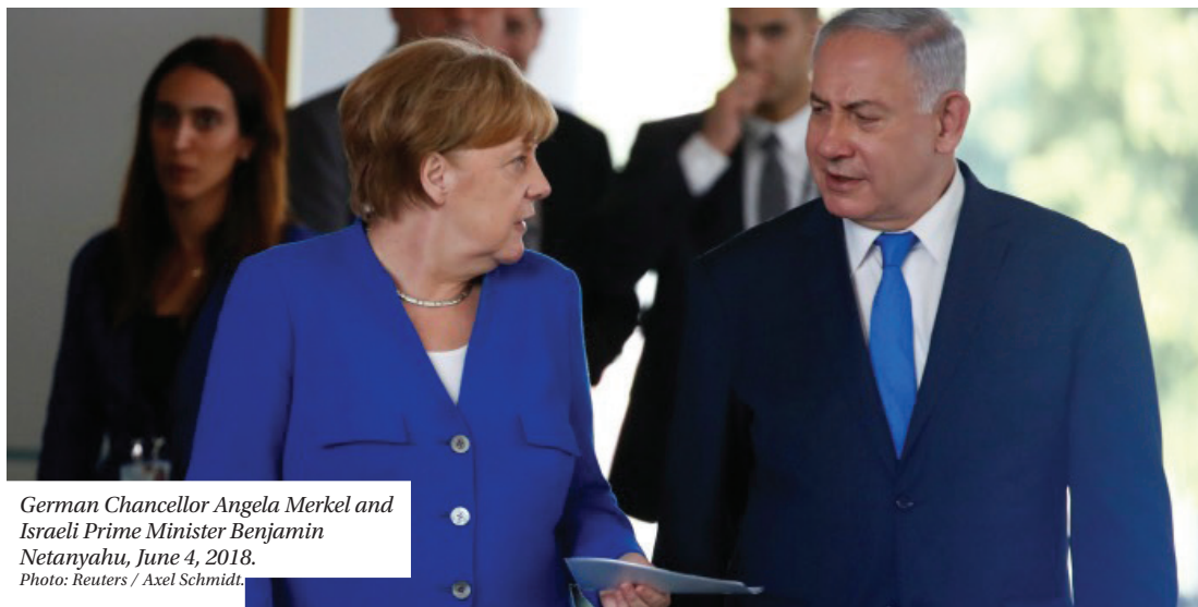
German Chancellor Angela Merkel and Israeli Prime Minister Benjamin Netanyahu, June 4, 2018.