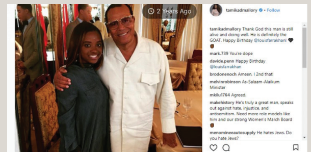
Tamika Mallory, co-president of the Women's March, posing with Nation of Islam leader Louis Farrakhan.

Mallory had been scheduled to speak at the 2018 Good Life Summit which begins in Melbourne on June 13. The event brings together high-profile politicians and advocates