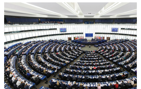
The European Parliament's debating chamber during a plenary session in Strasbourg.

Is the EU going to choose this moment to get up America's nose still further? Hardly. In my opinion, it was presumably anxious to demonstrate to Trump that, despite its earlier