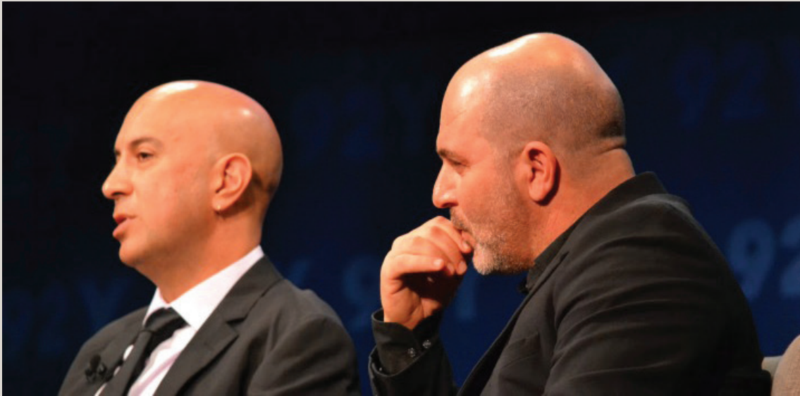
Fauda creators Avi Issacharoff and Lior Raz.