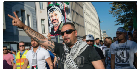
Demonstrators in Berlin carry a picture of Yasser Arafat in July 2014, protesting against the Israel Defense Forces' "Operation Protective Edge" in Gaza.