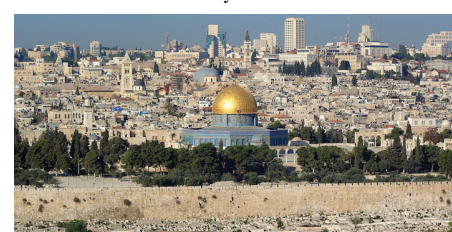
A view of Jerusalem.