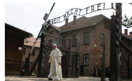
Pope Francis walks through the main gate at Auschwitz-Birkenau in Oswiecim, Poland, July 29, 2016.

While the bulk of the book deals with the United Church, the largest Protestant denomination in Canada, smaller sections