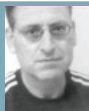
EFRAIM KARSH TEL AVIV

It is not the economic malaise in the Gaza Strip that has precipitated Palestinian violence. It is the other way around — the endemic violence has caused the Strip's humanitarian crisis. As long as Gaza continues to be governed by Hamas' rule of the jungle, no Palestinian civil society, let alone a viable state, can develop.