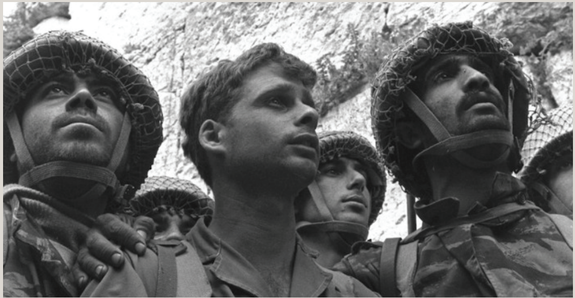
The iconic photo taken at the Western Wall shortly after its liberation in 1967.

They want the world to believe that the 1967