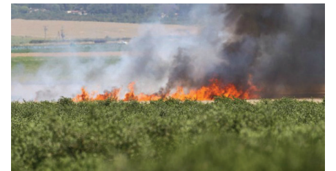
Smoke rises from Israeli agricultural fields near the Gaza Strip border, after being set on fire by a molotov cocktail kite flown over by Palestinians as they protest by the border fence on May 14, 2018.

Hundreds of flaming kites fitted with incendiaries have been flown into Israel in the past six weeks, with the intent of causing harm