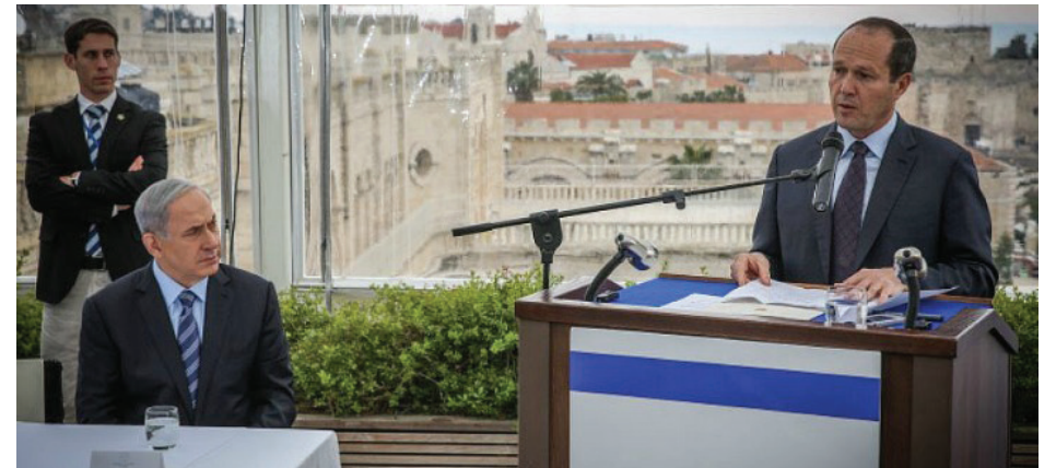
Israeli Prime Minister Benjamin Netanyahu and Jerusalem Mayor Nir Barkat hold a press conference at the Mamila Hotel in Jerusalem on Feb. 23, 2015.