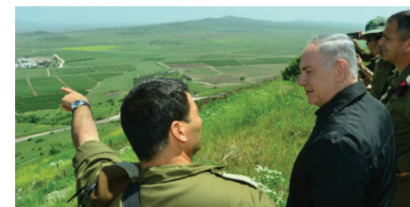
Israeli Prime Minister Benjamin Netanyahu (second from left) is pictured during a security and defense tour of the strategic Golan Heights region, near Israel's northern border with Syria, in April 2016.

The final document stating congressional recognition of the Golan as Israeli territory