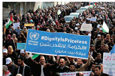
Palestinian employees of UNRWA in Gaza City demonstrate against the US decision in Jan 2018 to cut contributions to the agency