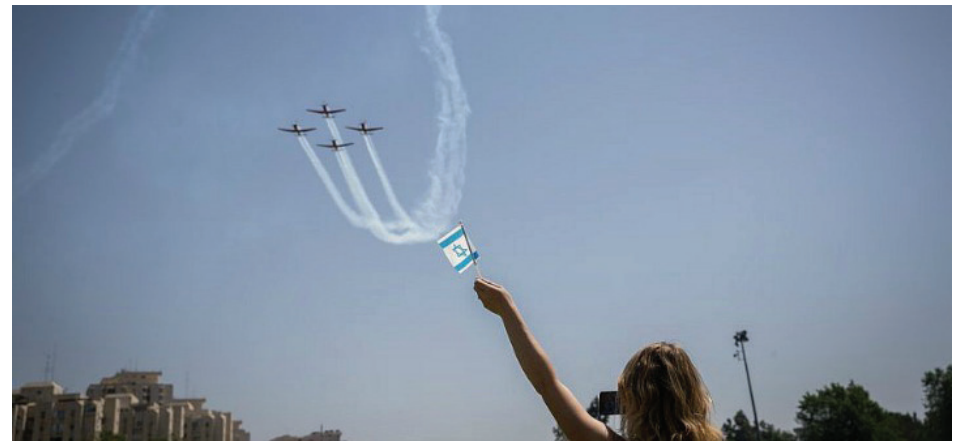
People watch the military airshow during Israel's 70th Independence Day celebrations in Saker Park in Jerusalem, April 19, 2018.