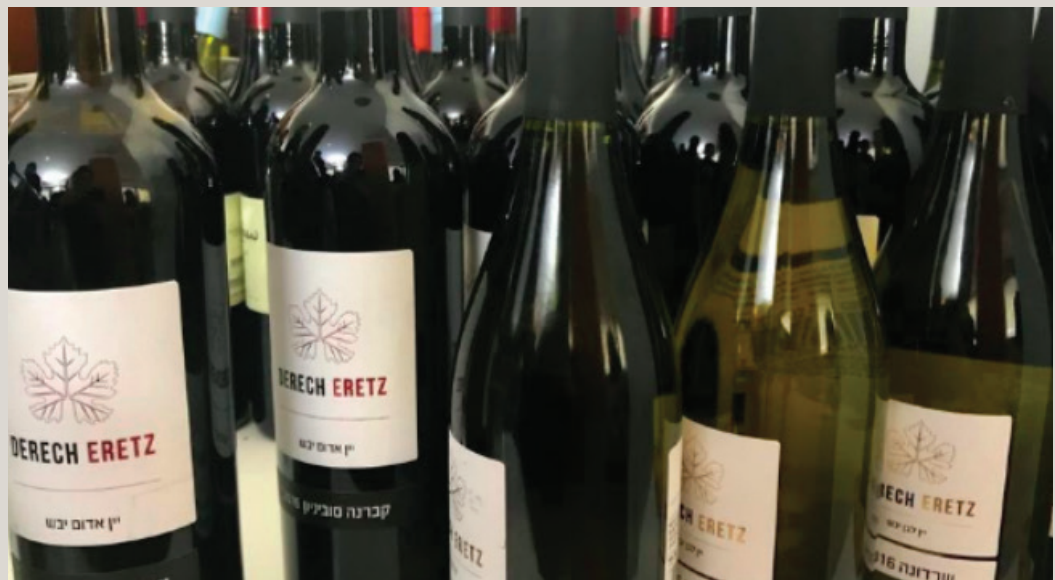
Bottles from the Derech Eretz winery at the Sommelier 2018 exhibition in Tel Aviv.

This insistence does seem, prima facie, to