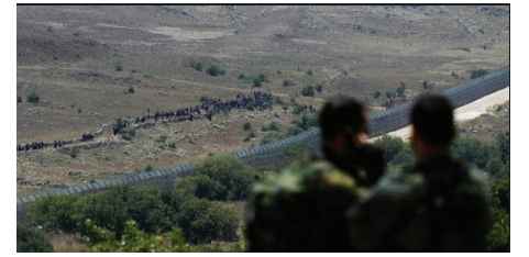
IDF soldiers look on toward people standing next to the Israel-Syria border fence in the Golan Heights, July 17, 2018.

It is in America's best national security interests to recognize the annexation of the Golan Heights as part of Israel's sovereign territory. Israel provides an island of tranquility in the chaotic world of the Middle