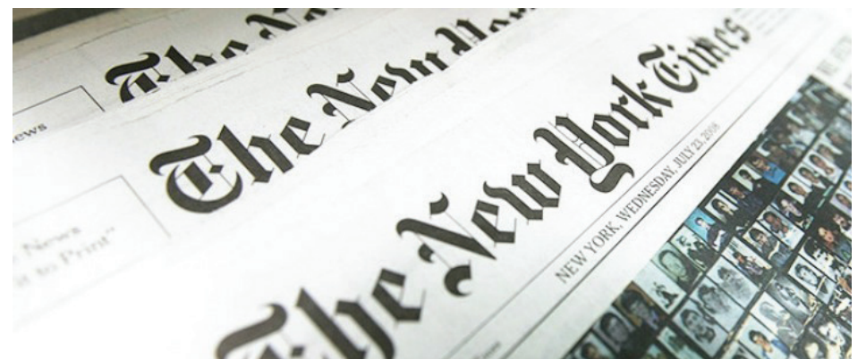
The New York Times front page.