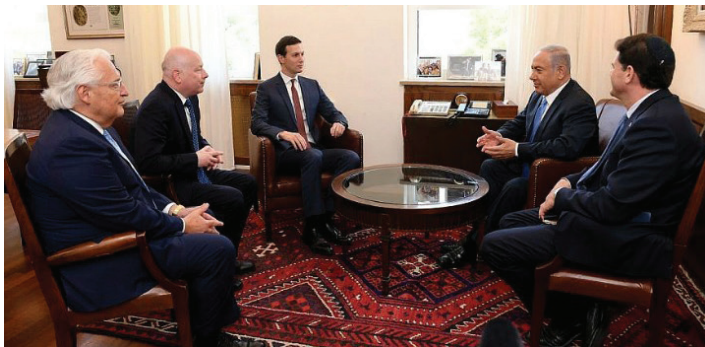
From left: US Ambassador to Israel David Friedman, Special Middle East envoy Jason Greenblatt, White House adviser Jared Kushner, Israeli Prime Minister Benjamin Netanyahu and Israeli Ambassador to the United States Ron Dermer, meeting in Jerusalem on June 22, 2018.

William Rogers, Henry Kissinger, Ronald Reagan, George H.W. Bush, Bill Clinton, George W. Bush and Barack Obama, as well