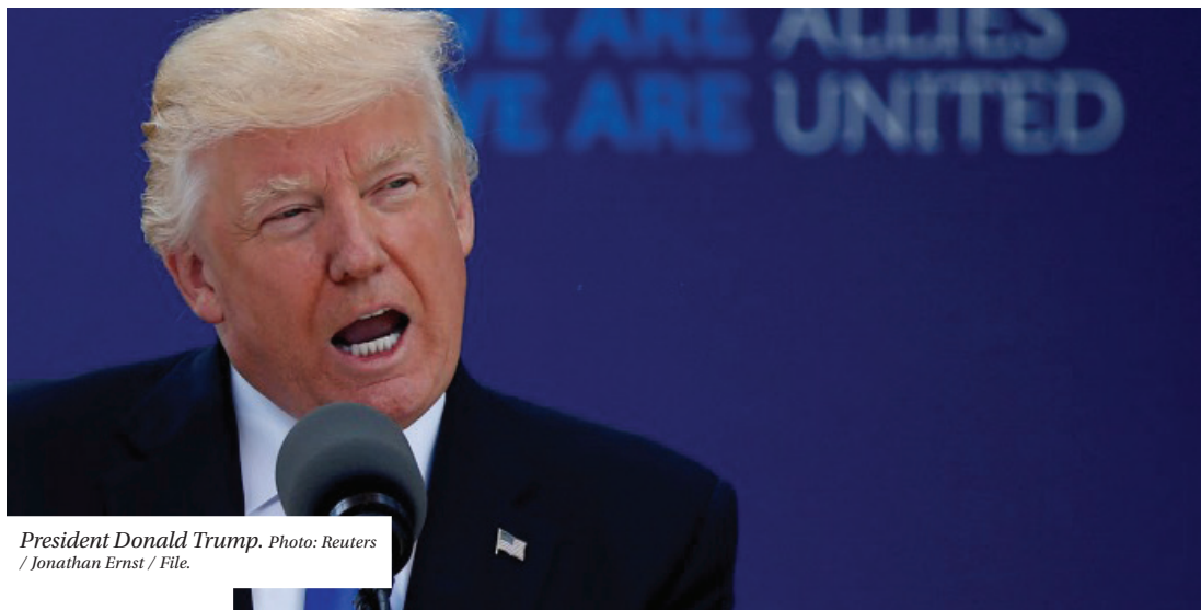
President Donald Trump.