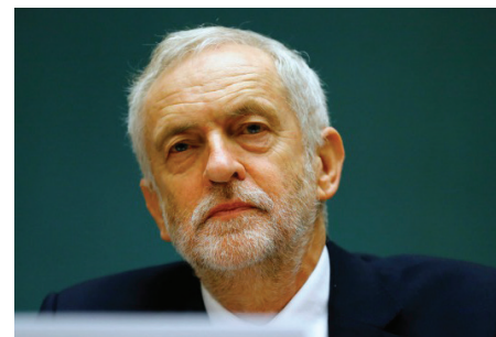
British Labour Party leader Jeremy Corbyn.

acidly on the leader of a party that is rooted in the labor movement posing happily with the ruler of a Gulf emirate whose population ratio — five disenfranchised, non-unionized, starvation-waged migrant workers for each full citizen — sounds rather like something we used to call “apartheid.” Still, choosing to bow to protocol on this one occasion, Corbyn did not raise the plight of Qatar's migrant workers during his audience with the Emir.