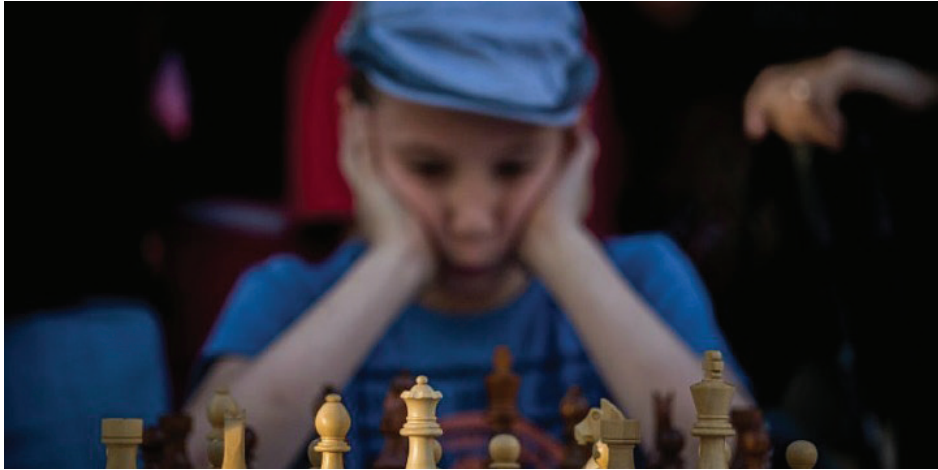
A young Israeli chess player takes part in a special chess tournament in Jerusalem marking Israel's 70th anniversary, April 30, 2018.