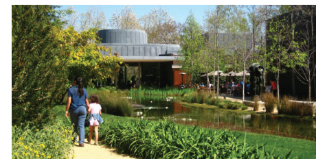
The outdoor sculpture and strolling garden at the Norton Simon Museum.