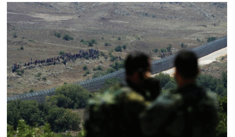
IDF soldiers look on toward people standing next to the Israel-Syria border fence in the Golan Heights, July 17, 2018.

The Jewish state has limited itself to retali-