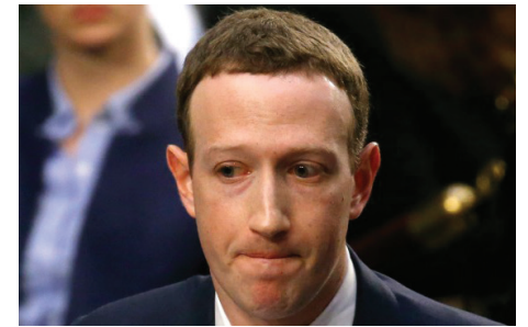
Facebook CEO Mark Zuckerberg.

and accomplished Jewish woman who is also extraordinarily dedicated to Israel. But it is too easy for Facebook to retreat behind the First Amendment, just as many academics use “academic freedom” to shield themselves from censure for their antisemitic statements.