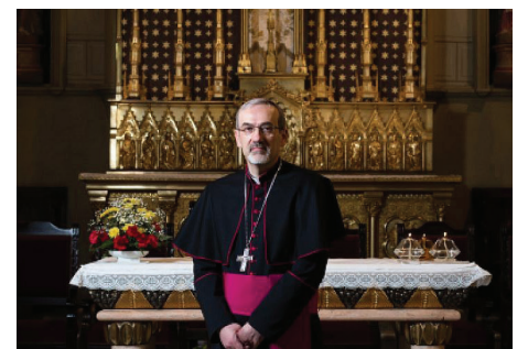
Portrait of Pierbattista Pizzaballa, Apostolic Administrator Latin Patriarchate of Jerusalem on Feb. 21, 2016.

The Roman Catholic Church is based in Vatican City, the smallest country in Europe, in which Roman Catholicism is the country's official religion, and the pope its sovereign ruler.