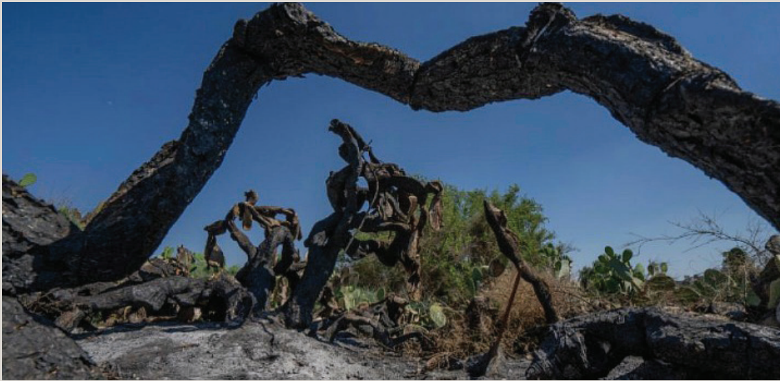
View from the scorched Be'eri forest in southern Israel, caused by the many airborne firebombs launched by Gazans, many of them children and teens, into Israel. July 20, 2018.