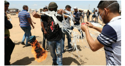
Palestinian rioters in Gaza prepare to set a kite on fire to be flown across the border into Israel, May 11, 2018.

So how does the official PA spokesman characterize this wave of arson terror? "A children's game such as kites used by peaceful