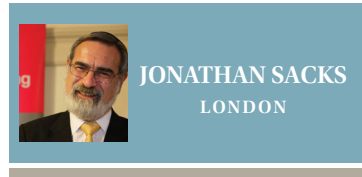
JONATHAN SACKS LONDON

A sequence of verses in this week's sedra gave rise to a beautiful Talmudic passage - one that has found a place in the siddur. It is among the readings we say after the Evening Service on Saturday night as Shabbat comes to an end. Here is the text on which it is based: