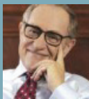
ALAN DERSHOWITZ BOSTON

indictment against Cohen accusing Trump of being his co-conspirator, Trump cannot be an unindicted co-conspirator. Moreover, the information against Cohen did not include the allegation by Michael Cohen that he was directed to pay hush money by the candidate. That self-serving accusation was made by Cohen in his statement to the judge.