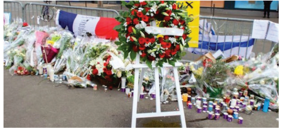
A wreath left outside the Hyper Cacher kosher supermarket in Paris on Jan. 16, 2015, to pay homage to the Jewish victims of an Islamist terror attack.