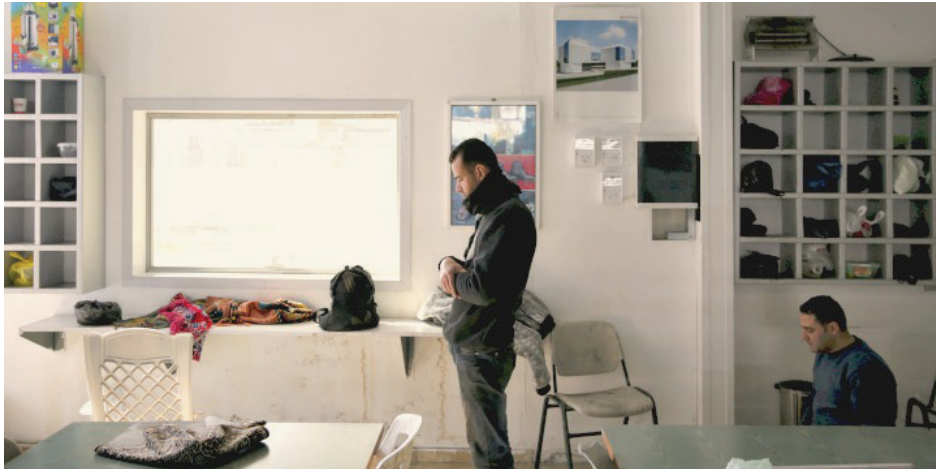
Palestinian workers praying during a lunch break at Aluminum Construction, a factory located in the industrial park of the Israeli settlement of Maale Adumim, near Jerusalem.