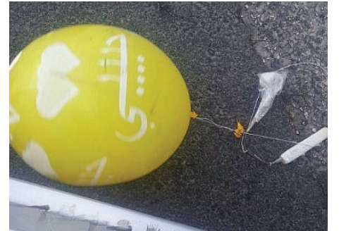
A balloon found in Beit Horon on Sept. 16, 2018.

Palestinians in the West Bank appeared to have replicated this tactic in a number of incidents, sending flammable devices into nearby Israeli communities.