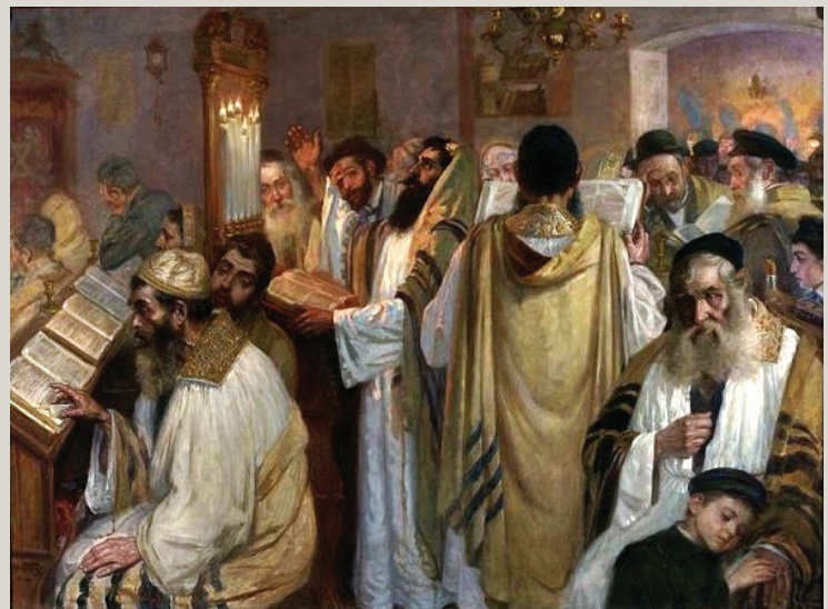
Weinles: On the eve of Yom Kippur.

The long services on the Holy Days did not exist before medieval times. They developed in part because of the constant suffering of exile, and the need to beg for relief and hope — but also because fear of being attacked forced communities to stay together for protection,