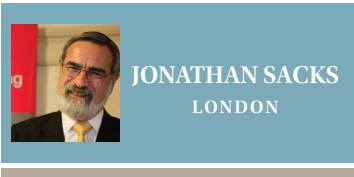
JONATHAN SACKS LONDON

In March 2015 I had a public conversation at Yale with the University's President Peter Salovey. The occasion was quite an emotional one. It celebrated the sixtieth anniversary of the Marshall Scholarships, created by the British parliament as a way of expressing thanks to the United States for the Marshall Plan, that helped Western Europe rebuild its economies after the Second World War. The scholarships fund outstanding young Americans to study at any university in the United Kingdom. So the gathering that evening was about the links between Britain and the United States, and the role of universities in cultivating that generosity of spirit, epitomised by the Marshall Plan, that understands the need to build peace, not just wage war.