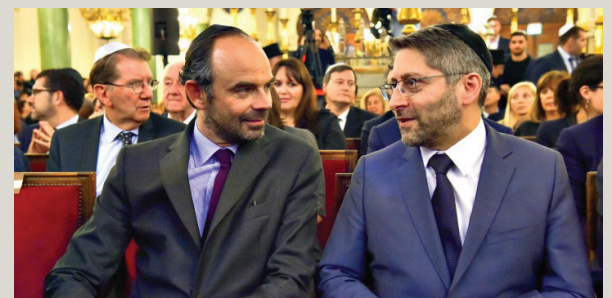
Chief Rabbi of France Haïm Korsia (R) with French PM Edouard Philippe at a pre-Rosh Hashanah service at the Buffault Synagogue in Paris.

"Wherever it is, we will fight it and we will win," Rabbi Haïm Korsia told the news outlet Actualité Juive in its latest edition, as he discussed the significance of French President