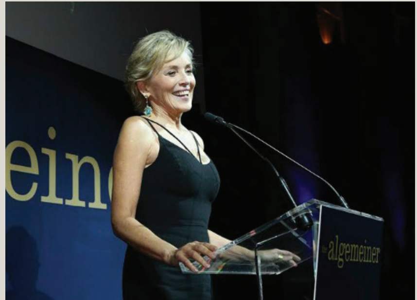
Actress Sharon Stone speaks at The Algemeiner's annual gala in New York City on Thursday.