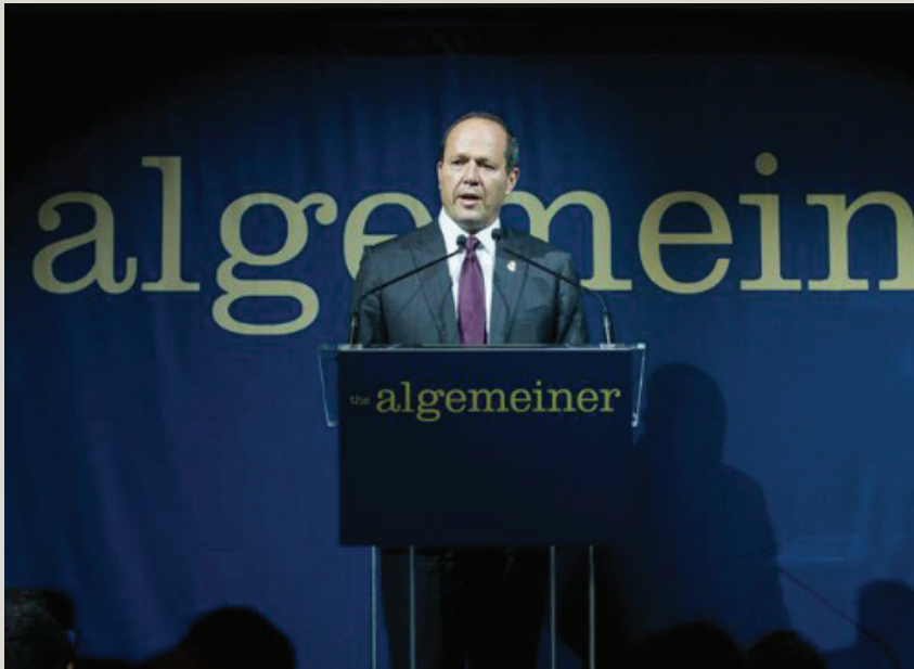
Jerusalem Mayor Nir Barkat.