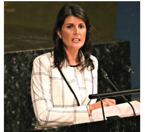
US Ambassador to the UN Nikki Haley.