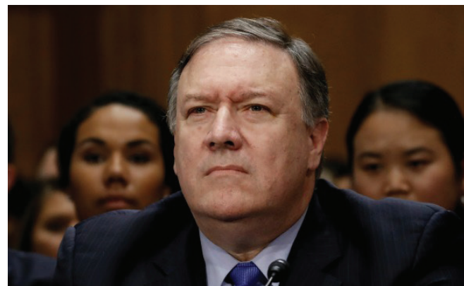
US Secretary of State Mike Pompeo.

awesome. Thumbs up. Fist bump," one agency official said of Pompeo's swagger campaign. "No."