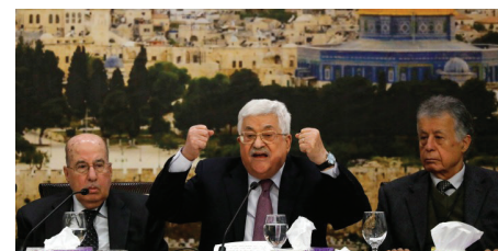
Palestinian Authority President Mahmoud Abbas speaks during a meeting of the Palestinian Central Council in Ramallah, January 14, 2018.

promoting the antisemitic boycott of Israel gave money to help the Palestinians rather than spending their money on convincing artists not to perform in Israel, pushing propaganda on college campuses, or interfering with employment opportunities for Palestinians who want to work for Israelis? I'm sure Roger Waters, Viggo Mortensen, Penelope Cruz, and the other thousand or so celebrity BDS advocates could come up with enough money to take care of the people they claim to care for so much.