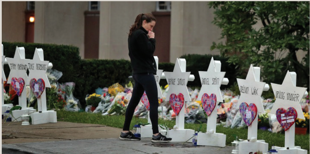
A woman reacts at a makeshift memorial outside the Tree of Life synagogue following Saturday's shooting at the synagogue in Pittsburgh, Pennsylvania, Oct. 29, 2018.

And if you somehow find yourself caught in the center – God help you, then expect hatred from all corners – but it is your prerogative and your