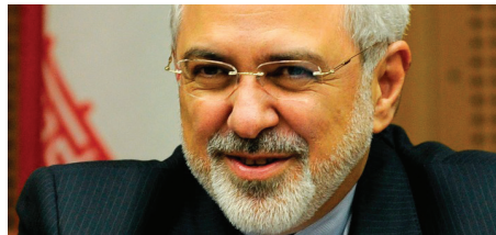
Iranian Foreign Minister Mohammad Javad Zarif.

minister of a tyrannical regime that is the world's #1 sponsor of terrorism, that swears every day that it will destroy my country & kill its 9 million citizens, that bombed the Jewish center in Buenos Aires & helped Assad murder hundreds of thousands of Muslims."