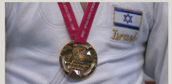
Israeli judoka Peter Paltchik's gold medal.

The judoka also called the playing of "Hatikva"