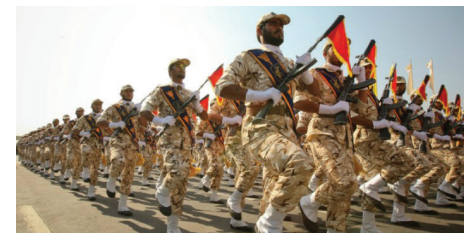
Members of Iran's Islamic Revolutionary Guard Corps march in a parade in Tehran, Sept. 22, 2011.

European countries are trying to save a 2015 nuclear deal between the Tehran regime and world powers after President Donald Trump withdrew the United States from the pact and announced the reimposition of sanctions on Iran.