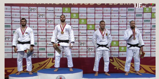
Israeli judoka Peter Paltchik's gold medal.