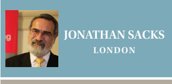
JONATHAN SACKS LONDON

The language of the Torah is, in Erich Auerbach's famous phrase, "fraught with background." Behind the events that are openly told are shadowy stories left for us to decipher. Hidden beneath the surface of Parshat Chayei Sarah , for example, is another story, alluded to only in a series of hints. There are three clues in the text.