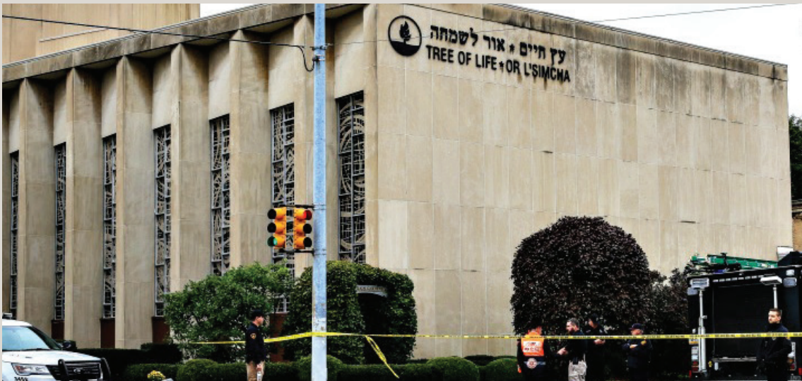
The Tree of Life synagogue in Pittsburgh's Squirrel Hill neighborhood.