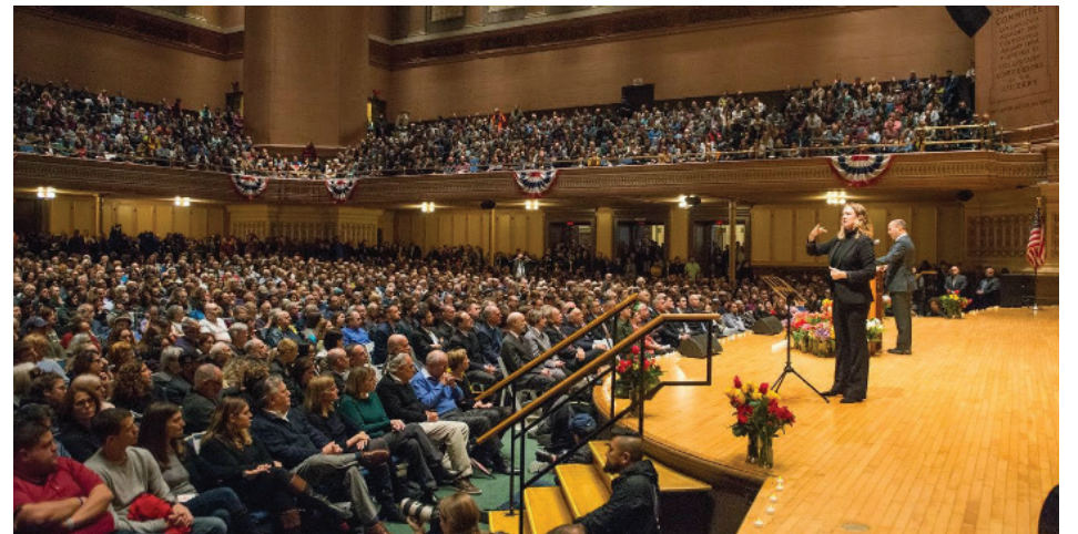
Diaspora Affairs Minister Naftali Bennett addresses a memorial vigil for the victims of the Pittsburgh synagogue massacre, Oct. 28, 2018.