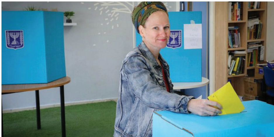
A woman casts her ballot at a voting station on the morning of Israel's municipal elections, on Oct. 30, 2018, in Efrat.