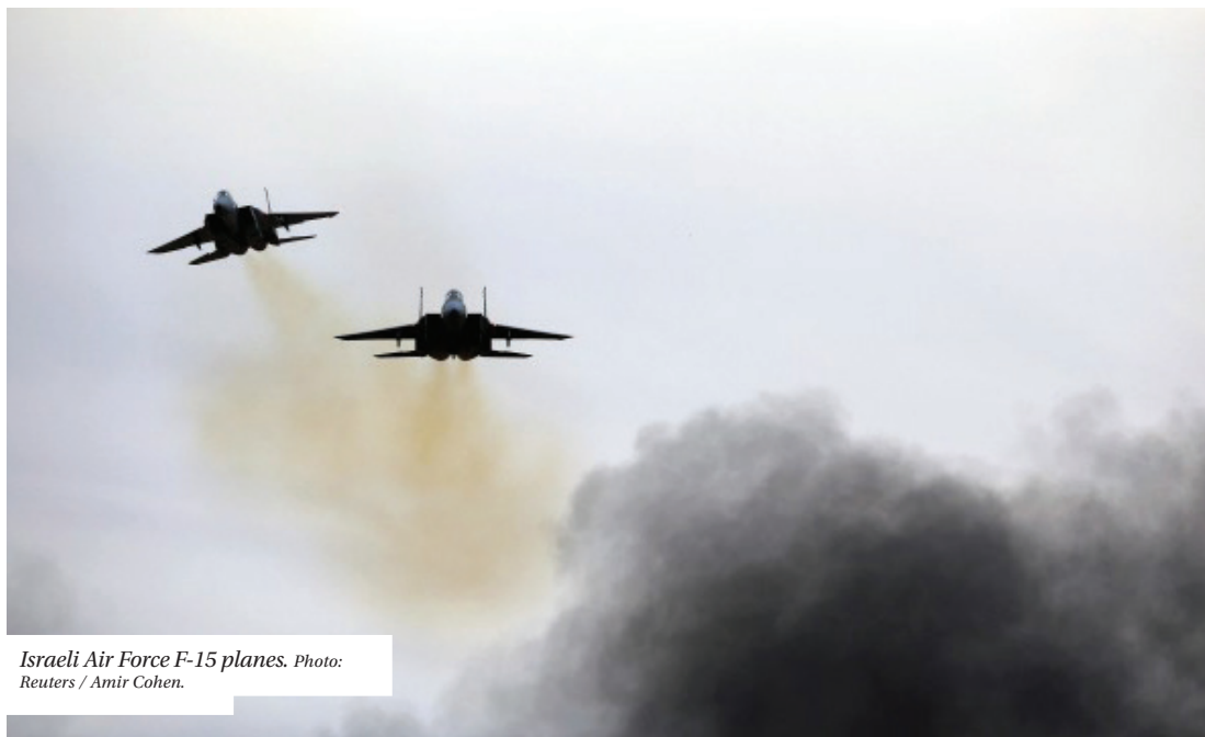
Israeli Air Force F-15 planes.