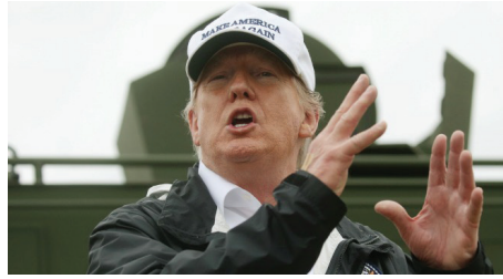
President Donald Trump talks to reporters as he visits the banks of the Rio Grande River, January 10, 2019.

To put it another way: a miracle is not necessarily something that suspends natural law. It is, rather, an event for which there may be a natural explanation, but which—happening when, where and how it did—evokes wonder, such that even the most hardened sceptic senses that God has intervened in history. The weak are saved; those in danger, delivered. More significant still is the moral message such an event conveys: that