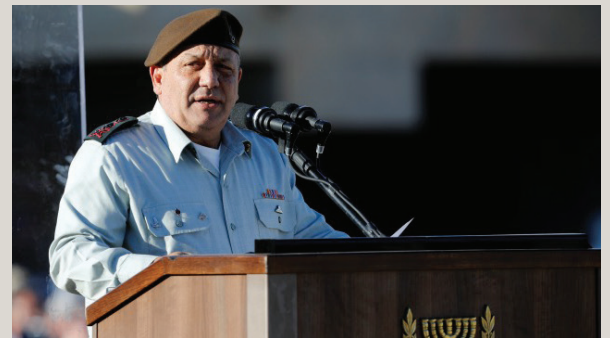
IDF Chief of Staff Lt. Gen. Gadi Eizenkot, June 20, 2018.

"Gadi, tremendous work has been done in the IDF under your command, and we still have much work ahead," Israeli Prime Minister Benjamin Netanyahu said at the ceremony at IDF Kirya Headquarters in Tel Aviv.