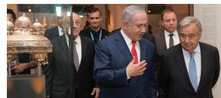
UN Secretary General Antonio Guterres with Israeli PM Benjamin Netanyahu in Jerusalem.

Characterizing payments for terror as social welfare is a deception that is frequently