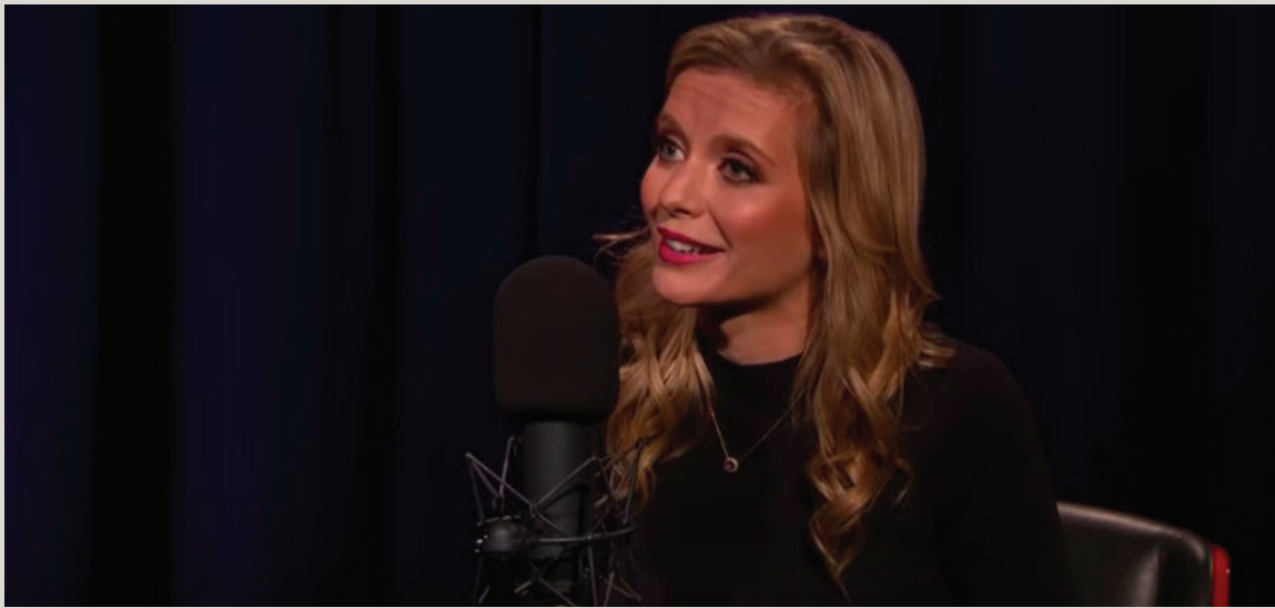
Rachel Riley during an interview with Britain's Channel 4 News.