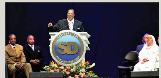
Nation of Islam leader Louis Farrakhan addressing the organization’s national convention in 2017.

An individual prison could have paid up to $25,000 for the Nation of Islam to perform weekly Jummah services for one year. These services would not include literature, which the BOP also purchases from the Nation of Islam. Among the literature the