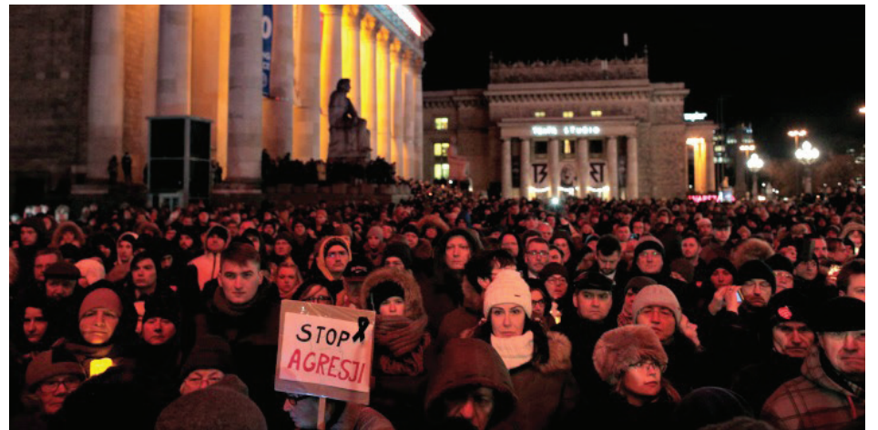
Thousands of people gathered in Gdansk following the murder of Mayor Pawel Adamowicz to protest violence and hatred.