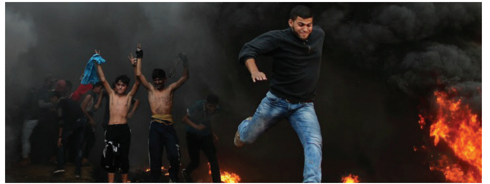
A Palestinian rioter on the Israel-Gaza Strip border, Oct. 26, 2018.

In the more than 10 years it has ruled the Gaza Strip, Hamas has done nothing to improve the lives of the Palestinians under its control. Instead, it has stolen international aid to fund its terrorist agenda, kidnapped Israeli soldiers and civilians, launched thousands of