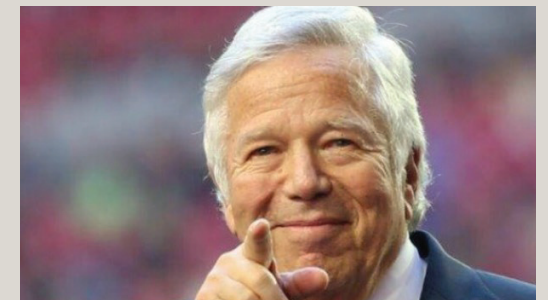
Robert Kraft.

Kraft visited the Tree of Life*Or L'Simcha Synagogue in Pittsburgh last month on Shabbat to pay his respects to the 11 Jewish victims of the Oct. 27 shooting. The visit was followed by an address to another area congregation.