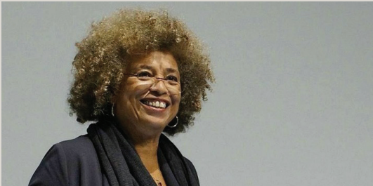
Angela Davis.

Angela Davis — born in 1944 in Alabama like Rosa Parks — grew up under the dark shadow of Jim