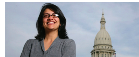
Congresswoman-elect Rashida Tlaib (D-Mich.).

"The ZOA urges Democratic Congressional leaders Senator Charles Schumer (D-N.Y.), Speaker of the House Rep. Nancy Pelosi (D-Calif.) and other Democrats to