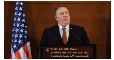
US Secretary of State Mike Pompeo speaks to students at the American University in Cairo, Egypt, Jan. 10, 2019.

We should also not forget that Pompeo's predecessor devoted his final foreign policy address to attacking Israel. John Kerry preferred