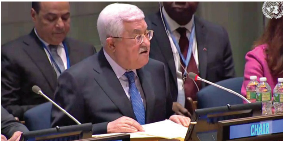
Palestinian Authority President Mahmoud Abbas addressing the G-77 meeting at the UN headquarters in New York, Jan. 15, 2019.