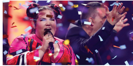
Israel's Netta Barzilai after winning the 2018 Eurovision song contest May 12, 2018.

The Jewish state earned the right to host Eurovision this year when Israeli singer Netta Barzilai won the 2018 contest in Portugal.