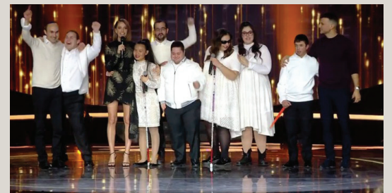
The Shalva Band on Saturday night's "Rising Star."