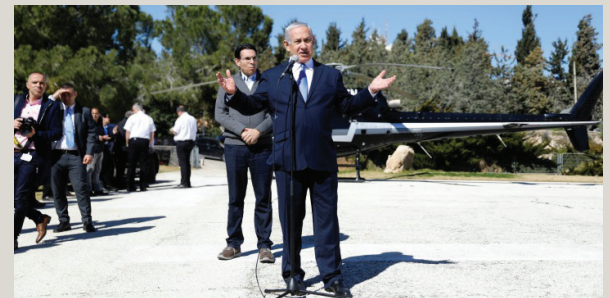
Israeli PM Benjamin Netanyahu addresses a visiting delegation of UN ambassadors in Jerusalem, Feb. 3, 2019.

"A great shift has taken place in the Middle East," Netanyahu told the diplomats in a briefing before they toured Israel's northern border. "That shift is the rise of the aggressive theocracy of Iran that seeks to conquer the Middle East, elimi-