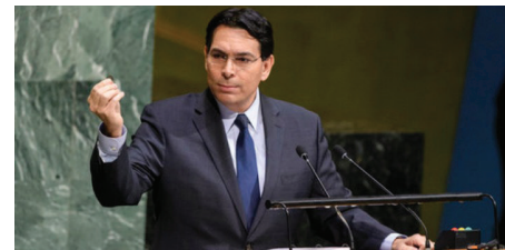
Israeli Ambassador to the United Nations Danny Danon addresses the U.N. General Assembly.

In Israel, they will have an extensive tour of the nation to learn about the land, Jewish history and Zionism; get briefings on current security issues; and partake in high-level talks and meetings.