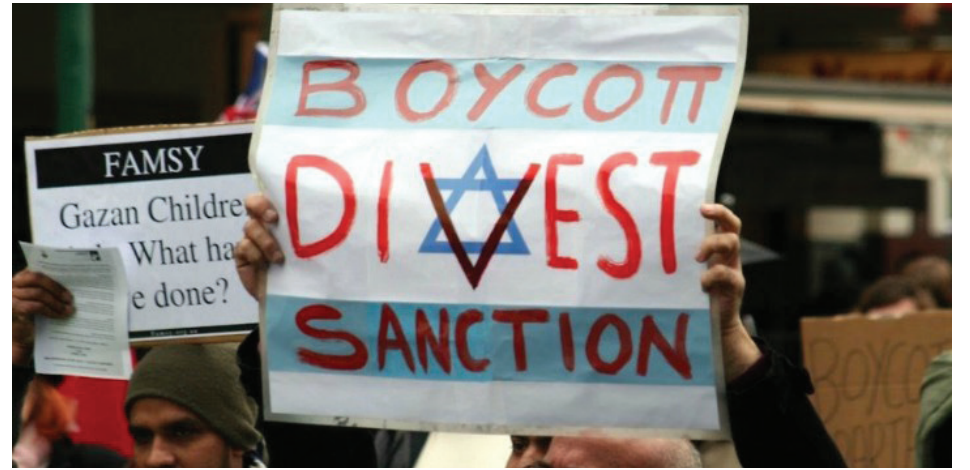
A pro-BDS demonstration.