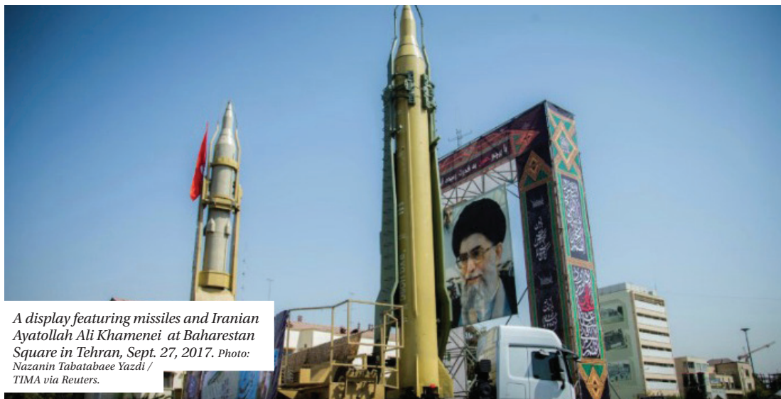
A display featuring missiles and Iranian Ayatollah Ali Khamenei at Baharestan Square in Tehran, Sept. 27, 2017.