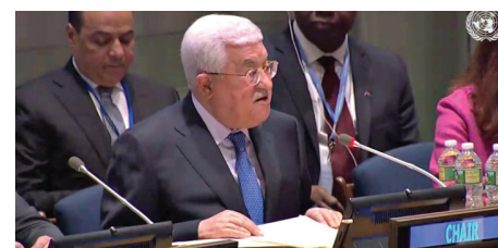
Palestinian Authority President Mahmoud Abbas.

PA head Mahmoud Abbas said it himself when he declared in July, "even if we have only a penny left, we will give it to the martyrs,