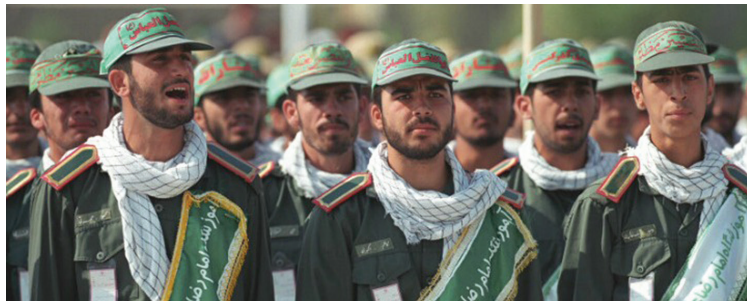
Members of the Iranian Revolutionary Guard Corps.

The establishment of the Islamic Republic of Iran exactly 40 years ago was a revolutionary success and a resounding intelligence failure. Western intelligence agencies, among them the Mossad, which for