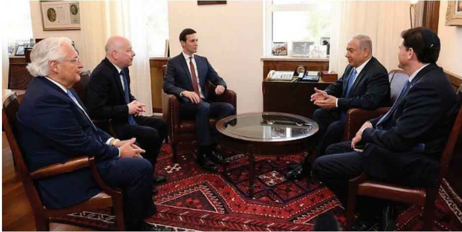
US Ambassador to Israel David Friedman, Special Middle East envoy Jason Greenblatt, White House adviser Jared Kushner, Israeli Prime Minister Benjamin Netanyahu and Israeli Ambassador to the United States Ron Dermer, meeting in Jerusalem on June 22, 2018.