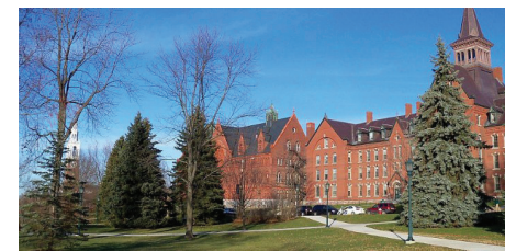
Scene on the campus of the University of Vermont in Burlington, Vt.