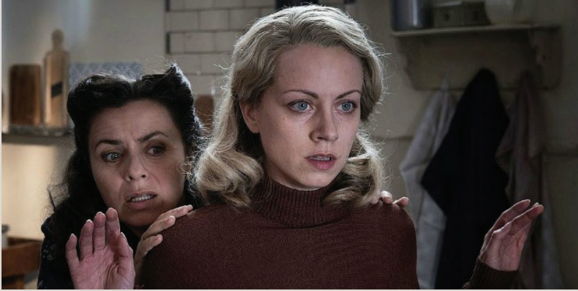
A scene from "The Invisibles."