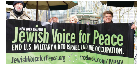
Members of extreme anti-Zionist group Jewish Voice for Peace.

If there is any doubt about JVP’s interest in the destruction of Israel, one need only read their