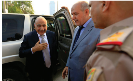
Iraqi Prime Minister Adel Abdul Mahdi arrives for the opening of Baghdad International Fair, Nov. 10, 2018.

Many Iraqi lawmakers, including the speaker of Parliament, demanded that an investigative committee be established and that officials who had come into contact with the "Zionist entity" be punished to the full extent of the law. Every political and public figure in the country was outspoken about their opposition to the normalization of ties with Israel — everyone, that is, except for one