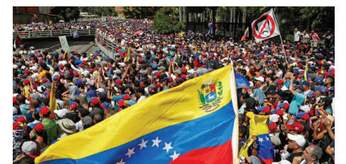
An opposition rally in Caracas, Venezuela, Jan. 23, 2019.