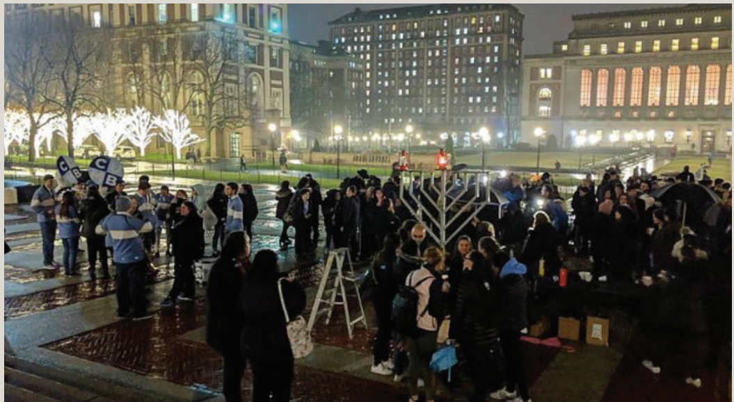
Members of the Columbia University community gather on Sunday at the public menorah-lighting, organized by Chabad at Columbia University outside Low Memorial Library, on the first night of Hanukkah, Dec. 2, 2018.

The difference between today's immigrants and those who came from Europe a century or more ago is not one about their ability or value, or even their capacity to assimilate if given the chance. America was built on the diversity and strength of its immigrants. The overwhelming majority of Hispanic immigrants today are, in that respect, no different from the Jews who arrived a century