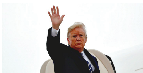
US President Donald Trump on 2018 midterm elections campaign trail.

He said some of the forces moving out of Syria will go to the base in Iraq and "ultimately some will be coming home."