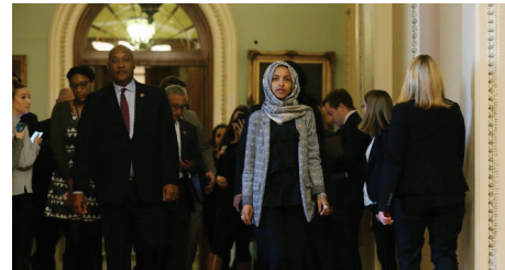
US Rep. Ilhan Omar (D-MN).