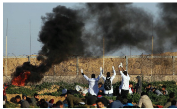
Palestinian medics raise up their hands as they try to evacuate a wounded demonstrator during protest at the Israel-Gaza border fence, January 11, 2019.

Over the past year, in deciding on policy and actions regarding Gaza, Israel has had to grapple