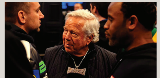
Feb 17, 2019; Charlotte, NC, USA; New England Patriots owner Robert Kraft during the 2019 NBA All-Star Game at Spectrum Center.

The 77-year-old billionaire businessman, who according to police was captured on video engaging in sex acts with a worker at a massage parlor in Jupiter,