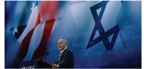
Israeli Prime Minister Benjamin Netanyahu at the 2018 AIPAC conference in Washington, D.C.

for one camp in Israel or one political faction in the United States, even when those stances are the most sensible. After all, if you are interested in preserving as much of a bipartisan consensus on Israel as possible, that inevitably is going to mean a willingness to forgive members of Congress that stray on key votes. It also means understanding that seeking to welcome Democrats and trying to strengthen their pro-Israel members, rather than writing them all off as an already hopelessly Corbynized band of radicals and antisemites, is absolutely necessary.