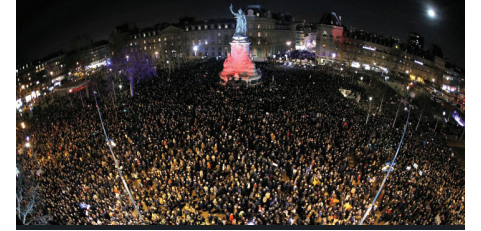
Demonstrators gather for the rally against antisemitism in the Place de la République in Paris.

The message is clear, dangerous, and bleak: antisemitism's introduction into political discourse by a member of Congress incurs no cost and perhaps yields rewards. Omar is already a hero in Jew-hating corners of America: neo-Nazi David Duke has gushed,