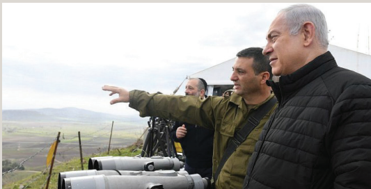
Israeli Prime Minister Benjamin Netanyahu and Security Cabinet members get a tour with the Northern Front Command in the Golan Heights on Feb. 6, 2018.

Indyk tweeted that Russian President Vladimir