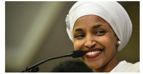
Rep. Ilhan Omar (D-Minn.).

Another example would be the Jews of Austria at the turn of the twentieth century. Despite receiving full rights from the Austro-Hungarian emperor Franz-Joseph I in 1867, the Jewish community couldn’t shake the