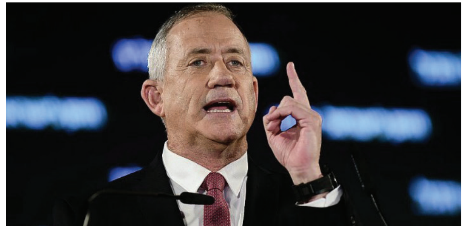
Benny Gantz, head of the Blue and White Party, in Tel Aviv on Feb. 19, 2019.