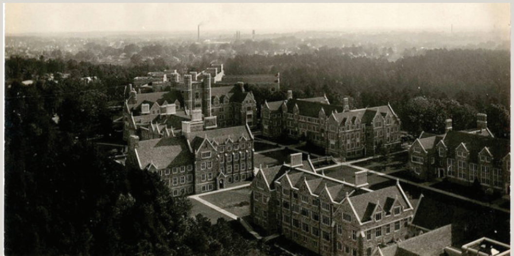
The Duke University campus.