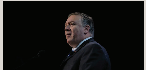
US Secretary of State Mike Pompeo speaks at the American Israel Public Affairs Committee (AIPAC) policy conference in Washington, DC, March 25, 2019.

In a speech to a major pro-Israel US lobby group in Washington, Pompeo accused Britain's opposition Labour Party of tolerating antisemitism, calling it a "national disgrace."