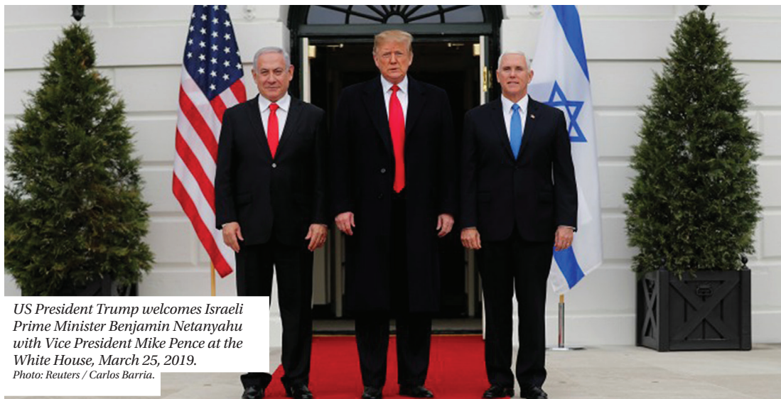
US President Trump welcomes Israeli Prime Minister Benjamin Netanyahu with Vice President Mike Pence at the White House, March 25, 2019.