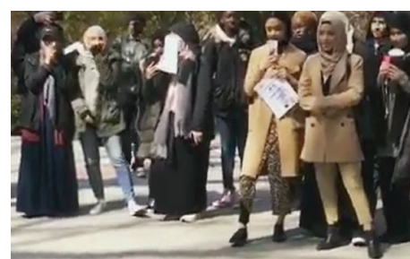
Vigil held at Brooklyn College by BC Socialists on March 19.

The solidarity vigil, organized by BC Socialists after a white supremacist gunman killed 50 people in Christchurch on March 15, attracted some 30 to 40 people, according to photos and videos posted online by the BC Student Union. Some members of the Islamic Society at BC — which held its own, university-promoted vigil on March 21 for victims of the massacre — were in attendance, BC Socialists said.