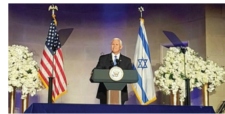
Vice President Mike Pence at the celebration marking the opening of the US embassy in Jerusalem and Israel's 70th anniversary in Washington, D.C. on May 14, 2018.

— anyone who aspires to the highest office in the land should not be afraid to stand with the strongest supporters of Israel in America. It is wrong to boycott Israel and it is wrong to boycott AIPAC."