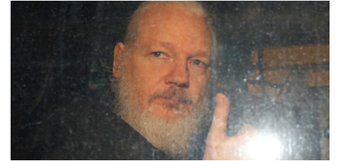
WikiLeaks founder Julian Assange is seen after was arrested by British police in London, Britain April 11, 2019.

When the fugitive WikiLeaks founder Julian Assange first holed up in the Ecuadorean embassy in London seven years ago, “Brexit” was an unknown word, Donald Trump was still hosting The Apprentice , and the Iran nuclear deal was just a twinkle in the eye of Barack Obama. So when, last week, British police officers carried a horizontal Assange out of the embassy’s doors and into a world greatly changed since the last time he breathed in the fresh morning air, one couldn’t help reflecting that those changes would not quite have been the same without his contribution.