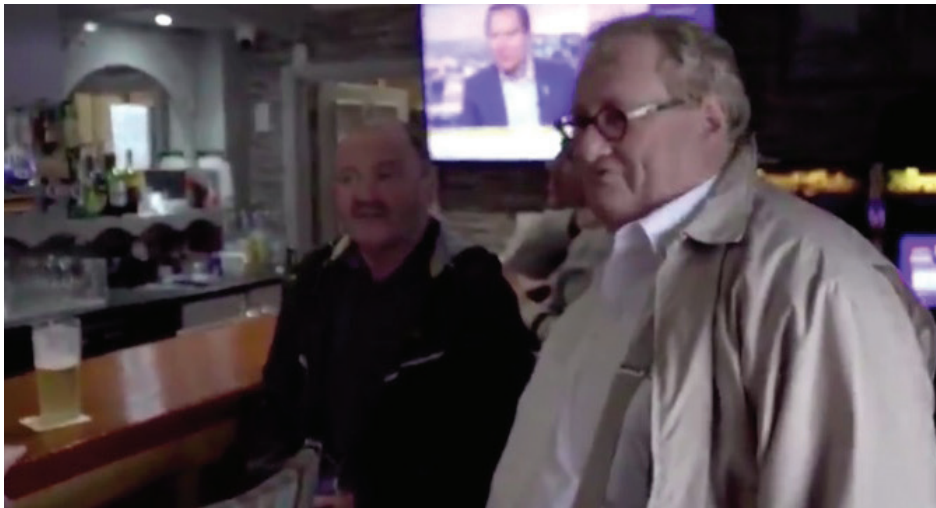
Tuvia Tenenbom speaking with locals at a bar in Northern Ireland.