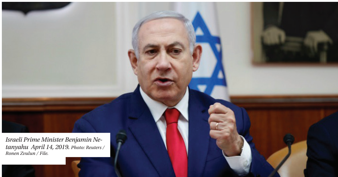
Israeli Prime Minister Benjamin Netanyahu April 14, 2019.