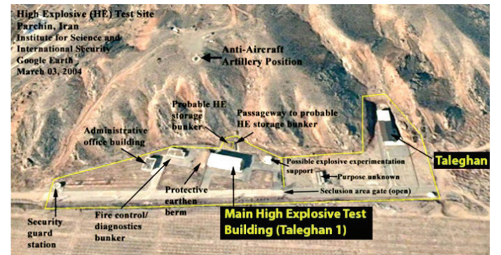
An aerial map from 2004 showing Iran's clandestine nuclear activities at the Parchin military complex near Tehran.

These failures of the IAEA show that the agency that is supposed to verify Iran's compliance with the deal has given too much leeway to the Islamic Republic. It would appear that the IAEA's role in the nuclear deal is to validate it, not to verify it.