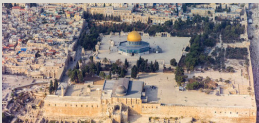
An aerial view of the Temple Mount in the Old City of Jerusalem.

After Israel's victory in the 1967 Six-Day War, some on the left turned Israel from the Middle East's plucky David facing reactionary Arab kings and dictators into a colonial Goliath, oppressing "third-world" Palestinian Arabs. The Soviet-inspired 1975 UN General Assembly resolution equating Zionism with racism certified "anti-Jewish statism."