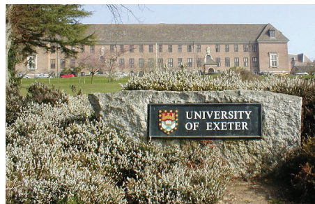
The University of Exeter.