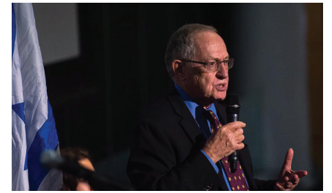
Alan Dershowitz speaking at Columbia University.

Such double standards and manifestations of antisemitism occur every year at the UN General Assembly, which singles out Israel for attack more than any other nation on earth (when many of those other nations are guilty of true war crimes and human rights violations). In recent years, there has not even