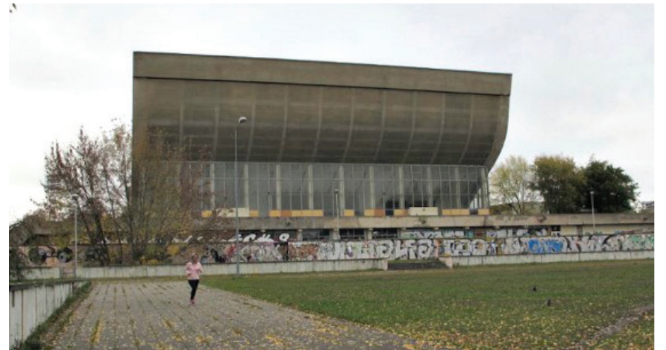
A view of the abandoned "sports palace" built by Soviet authorities on top of a 15th-century Jewish cemetery in Vilnius. Photo: Screenshot.