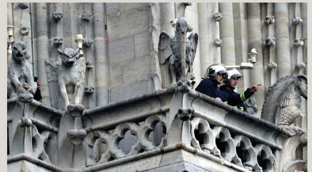
Parisian firefighters working in Notre Dame Cathedral after a devastating fire destroyed the roof of the historic landmark.