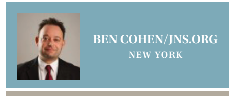
BEN COHEN/JNS.ORG NEW YORK