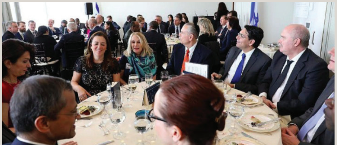
Ambassador Danny Danon with fellow diplomats participate in pre-Passover Seder held at the United Nations.

The Talmud is more interested in actual discussion and debate in an unstructured way. After all,