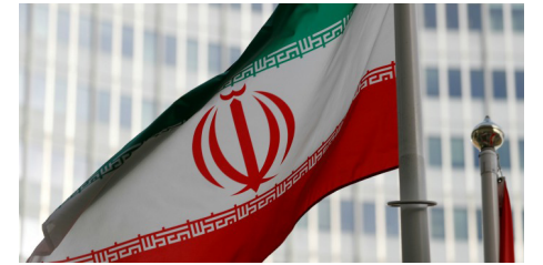
Iranian flag in front of the International Atomic Energy Agency (IAEA) headquarters in Vienna, Austria, March 4, 2019.

Hawks such as Netanyahu, who has repeatedly accused Iran of seeking Israel's destruction, point to Tehran's past to argue that it can never be trusted. The Islamic Republic's previous secrecy might explain why uranium traces were found at a location that was never declared to the IAEA.