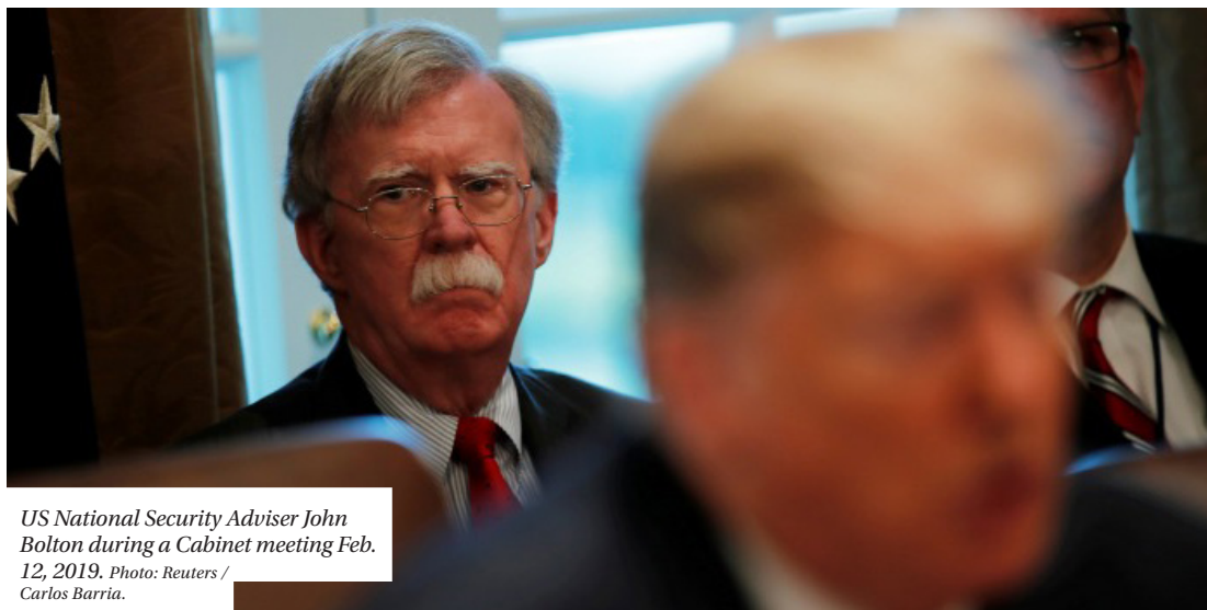
US National Security Adviser John Bolton during a Cabinet meeting Feb. 12, 2019.