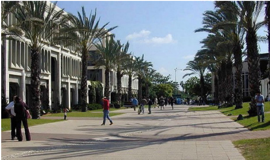
Leigh Engineering Faculty Boulevard, Tel Aviv University.