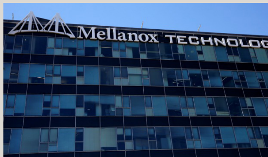
The logo of Mellanox Technologies is seen at the company's headquarters in Yokne'am, in northern Israel on July 26, 2016.

In March, Mellanox announced a deal with Nvidia to be acquired by the latter for $6.9 billion. The deal is