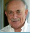
ISI LEIBLER JERUSALEM

The decision to hold Israel's second election of 2019 was disgraceful and should have been avoided. Indeed, one of the big questions that could be critical for the outcome are the voters who are fed up with our dysfunctional politics and will simply not bother casting their ballots.