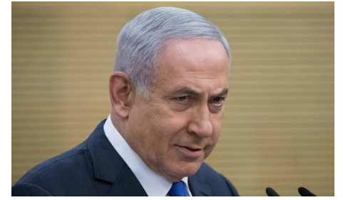
Israeli Prime Minister and Likud Party head Benjamin Netanyahu delivers a statement to the media at the Knesset on May 27, 2019.

In the context of what we face, it would surely be counterproductive to divest ourselves of him at this time when existential threats challenge us and agreements with the Americans and Russians could either have good or disastrous implications for us in the