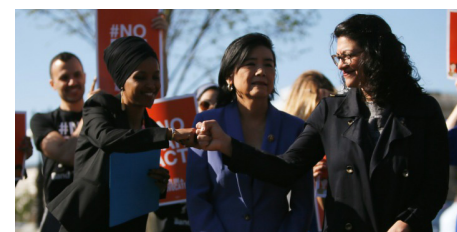
Rep. Ilhan Omar (D-MN) shares a fist bump with Rep. Rashida Tlaib (D-MI) in Washington, DC, April 10, 2019.

Yet academics are easy targets for counterattack. The careers and reputations of some of these people can be damaged without much effort. Had there been an Israeli anti-propaganda agency, it could, for instance, have identified academic boycotters who plagiarized some of their work or had erroneous footnotes in their articles, and gone