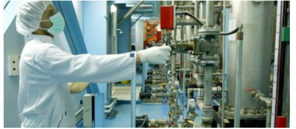
An IAEA inspector at an Iranian nuclear facility.