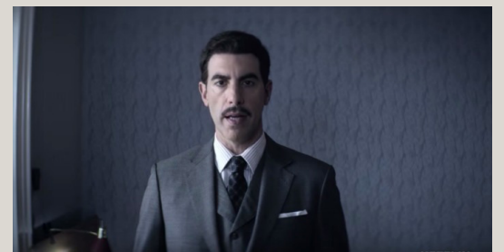
Sacha Baron Cohen in the trailer for "The Spy."

Cohen, who currently stars as Mossad agent Eli Cohen in the Netflix miniseries "The Spy," told The New York Times, "I used to be reluctant to play anyone Jewish, because I didn't want to be typecast as the Jewish actor. There are other Jews in Hollywood besides me. But somehow, people thought of me as 'a Jewish actor' even after I played Borat, the most outwardly antisemitic character probably since Leni