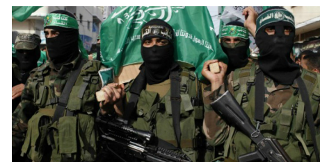
Hamas terrorists.

Israeli Foreign Minister Yisrael Katz tweeted, “I welcome the decision of the United States of America to put additional sanctions on the Islamic Revolutionary Guard Corps, Hamas, ISIS and Al-Qaeda. This is the right way to stop the Terror-State of Iran and its proxies.”