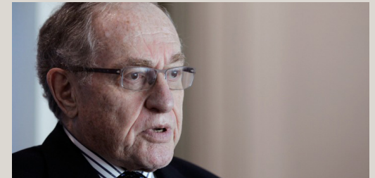
Harvard University law professor Alan Dershowitz.

Many left-wing Democrats — even some who had opposed President Obama's decision to push the anti-Israel resolution through the Security Council and who had urged Obama to move the embassy to Jerusalem — thoughtlessly condemned the move without providing coherent arguments. For them it was enough that this was President Trump who had ordered the relocations of the embassy. If the same actions had been taken by a