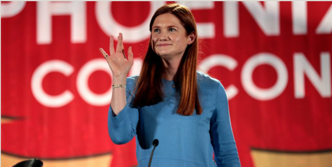
Bonnie Wright.