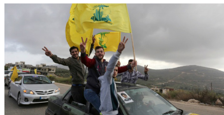
Hezbollah supporters in Marjayoun, Lebanon, May 7, 2018.

The BBC report itself refers to the airstrike's targets as "bases, arms depots, and vehicles" belonging to a militia. This was certainly an airstrike aimed at a specifically military target and not civilians.