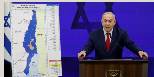
Israeli Prime Minister Benjamin Netanyahu delivers a statement in Ramat Gan, near Tel Aviv, Sept. 10, 2019.

Netanyahu cited the context of Trump administration's peace plan, set to be unveiled immediately after the Knesset