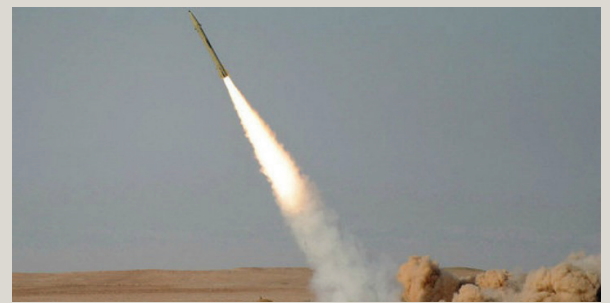
Iran test-fires a Fateh-110 missile in July 2012.

As Iranians took to the streets this week to commemorate 40 years since the US embassy takeover in 1979, Iran announced new violations of the nuclear deal it signed in 2015. The rogue Islamic Republic admitted that it now operates 60 advanced IR-6 centrifuges and is working on a new type of centrifuge that will work 50 times faster than what is currently permitted under the deal.