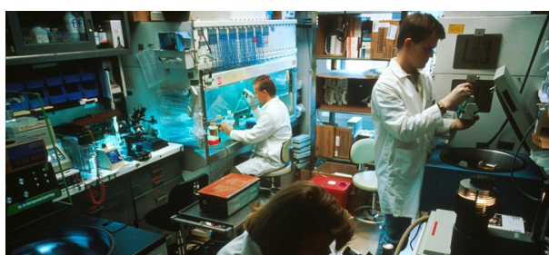
Scientists at work in laboratory.