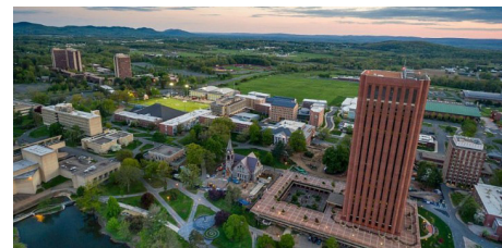
The campus of the University of Massachusetts at Amherst.

This statement represented a capitulation in the effort to protect the "intellectual indepen-