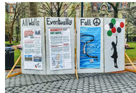
A display erected by Penn Students for Justice in Palestine during its “Israeli Apartheid Week” campaign.