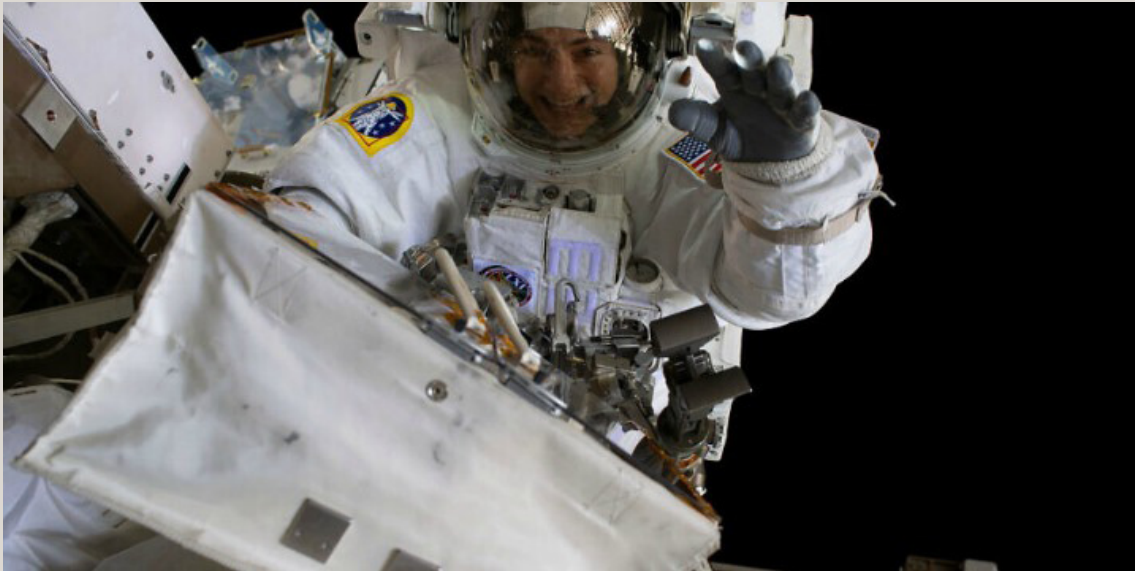
NASA astronaut Jessica Meir waves at the camera during a spacewalk with fellow NASA astronaut Christina Koch (out of frame). They ventured into the vacuum of space for seven hours and 17 minutes to swap a failed battery charge-discharge unit (BCDU) with a spare during the first all-woman spacewalk, Oct. 18, 2019.