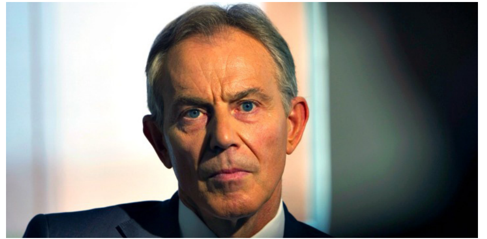
Former British Prime Minister Tony Blair.