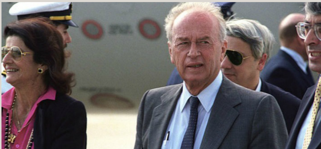
Yitzhak Rabin (center).