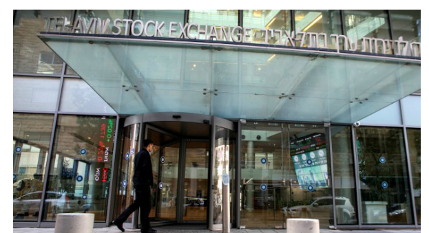
A man enters the Tel Aviv Stock Exchange, Jan. 29, 2017.

It’s not that we Arabs have no scientists. In fact, we have millions, but they primarily work for the preservation of racist and tyrannical regimes. Clinging to the provincial theories