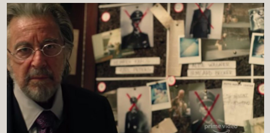
Al Pacino in a teaser trailer for "Hunters."

"This is not murder," says Pacino with a thick accent in the clip before his character is shown drawing an "X" through a photograph of a uniformed Nazi. "This is mitzvah." The video also shows various scenes of violence.