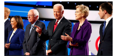
Senator Kamala Harris, Senator Bernie Sanders, former Vice President Joe Biden, Senator Elizabeth Warren and South Bend Mayor Pete Buttigieg before the fourth Democratic US 2020 presidential debate Oct. 15, 2019.

Anyway, the idea of withholding aid to Israel as a punishment for settlement activity long predates the Trump presidency. George H.W. Bush's secretary of state, James A. Baker III, pushed it in 1992. It's not even new coming from either Republican or Democratic presidential candidates; Republican Ron Paul and Democrats Dennis Kucinich and Jesse Jackson both at various times have been outspokenly critical of Israeli policies and US levels of aid to Israel. And in any discussion of fault for recent strains in the US-Israel relationship, mention must also be made of President Obama, who advanced an Iran nuclear deal over strenuous Israeli objections and who, as a lame duck, failed to veto a UN Security Council Resolution condemning Israel.