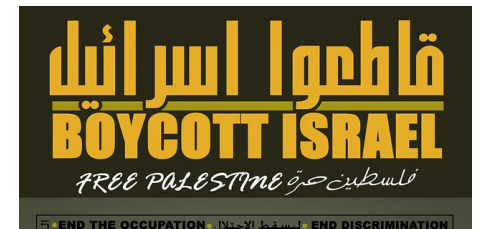
“Boycott Israel”

America has all too readily ignored genocidal antisemitism before. Before the massacre of six million Jews in the Holocaust, American universities welcomed leaders from Nazi Germany — even though their horrifying racist ideology was well-known — while