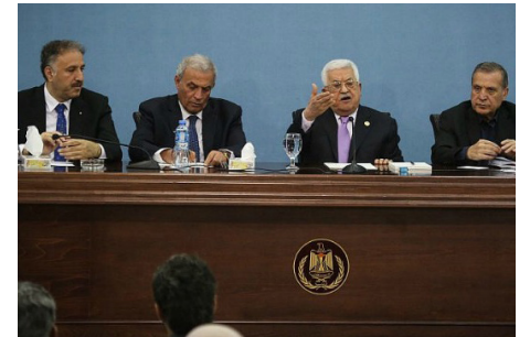
Palestinian Authority leader Mahmud Abbas speaks during a meeting with journalists in the West Bank city of Ramallah on July 3, 2019.

Meanwhile, during Israel's last war in Gaza in 2014, with Hamas rockets lighting