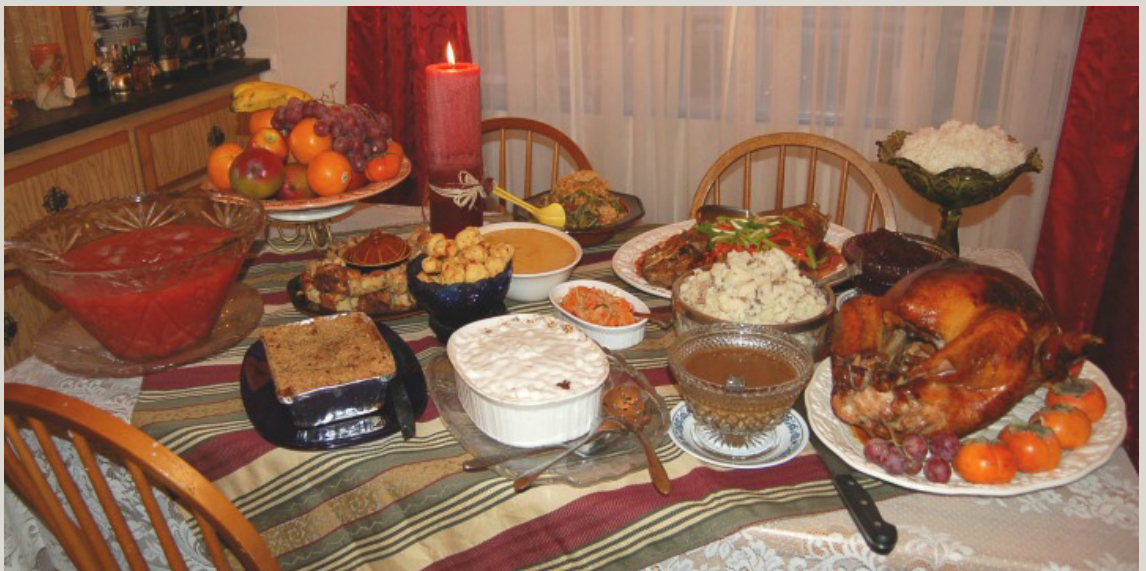
A Thanksgiving dinner.

And since today's Jews have ancestors from all over, she suggests an international potluck Thanksgiving. "The Persians can bring their rice and the Russians their sauerkraut. That way, we learn about Jewish culinary traditions from around the world, and best of all, no one person has to do all the cooking."