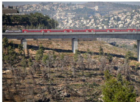
A view of the new Tel Aviv-Jerusalem fast train just outside of Jerusalem, Sept. 25, 2018.

The CSOC draws attention to problems as they are detected. Operators can then