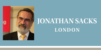
JONATHAN SACKS LONDON

It's a haunting question. Why did Isaac love Esau? The verse says so explicitly: "Isaac, who had a taste for wild game, loved Esau, but Rebecca loved Jacob" (Gen. 25:28). Whichever way we read this verse, it is perplexing. If we read it literally, it suggests that Isaac's affections were governed by no more than a taste in a particular kind of food. Surely that is not the way love is earned or given in the Torah.