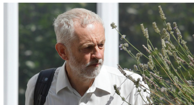
Britain’s opposition Labour party leader Jeremy Corbyn leaves his house in London, Aug. 6, 2018.

opponents of Israel “make their points,” as the Times describes; it undercuts the validity of those points, discrediting them.