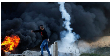
Palestinian supporters of Hamas participated in a violent rally marking the 31st anniversary of the founding of the terror organization that runs Gaza, in the West Bank city of Nablus, on Dec. 14, 2018.

Hamas is more tolerant of PIJ than of its Sunni ally/rival, Fatah, the controlling faction in the Palestinian Authority (PA). In 2007, Hamas and Fatah went to war over who