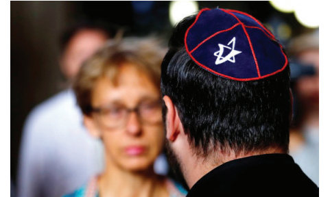
A member of Berlin’s Jewish community speaking to journalists at the trial of a Syrian immigrant who assaulted a man wearing a kippah. Illustrative.

Critically, both the EU survey of Jews and the ADL survey of non-Jews underline the distribution of antisemitic attitudes on the extremes of left and right, as well as across different religious and ethnic communities. Of the hundreds of Jewish respondents questioned by the EU who had personally experienced antisemitic harassment, 30 percent said the perpetrator was someone with “Muslim extremist” views, 21 percent