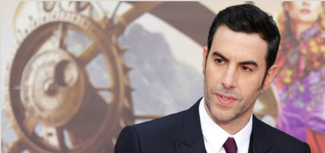
Actor Sacha Baron Cohen arrives at the European Premiere of Alice Through the Looking Glass at a cinema in London, Britain, May 10, 2016.