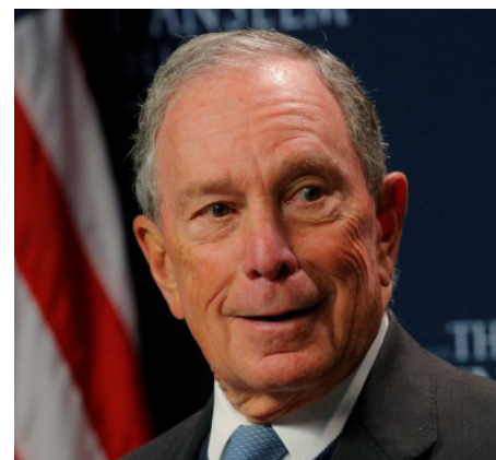
Former New York City Mayor and possible 2020 Democratic presidential candidate Michael Bloomberg speaks at the Institute of Politics at Saint Anselm College in Manchester, New Hampshire, US, January 29, 2019.

The progressives—or Democratic Socialists, who some bluntly call themselves—are setting the agenda for the party on issues such as universal health care, free college tuition, aggressive taxation, climate change, open immigration and even Israel. Why Israel became a foreign-policy priority can only be imagined, but three of the candidates—