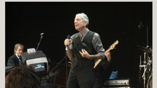
Leonard Cohen in concert in 2008.