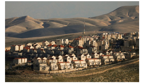
A general view picture shows houses in the Israeli settlement of Maale Adumim, in the West Bank, Feb. 15, 2017.

The Palestinians are not easily disabused of their fantasies; however, the president's actions have punctured them. For the first