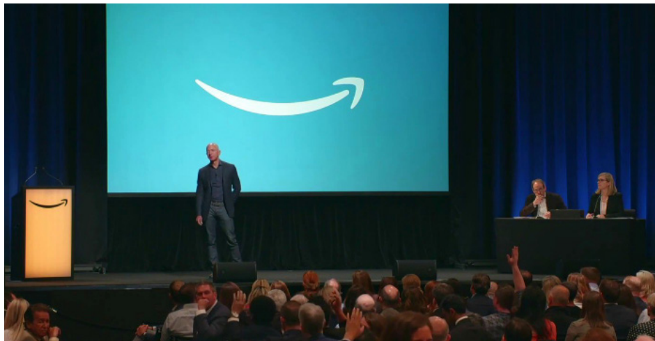
Amazon CEO Jeff Bezos at the 2019 annual shareholders meeting in Seattle.