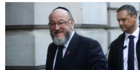
Rabbi Ephraim Mirvis, Britain's chief rabbi, London, Nov. 10, 2019.

Nine lawmakers quit Labour in February, citing its leadership’s handling of the accusations among their reasons, and in