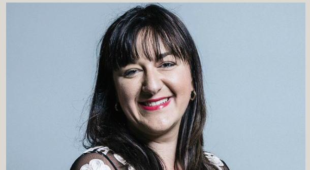
Jewish MP Ruth Smeeth.

Ruth Smeeth — who has represented the Stoke-on-Trent North electoral district for the Labour party since 2015 — told local broadcaster StokeonTrentLive that she had been threatened by fanatics on both the left and right ends of the political spectrum.