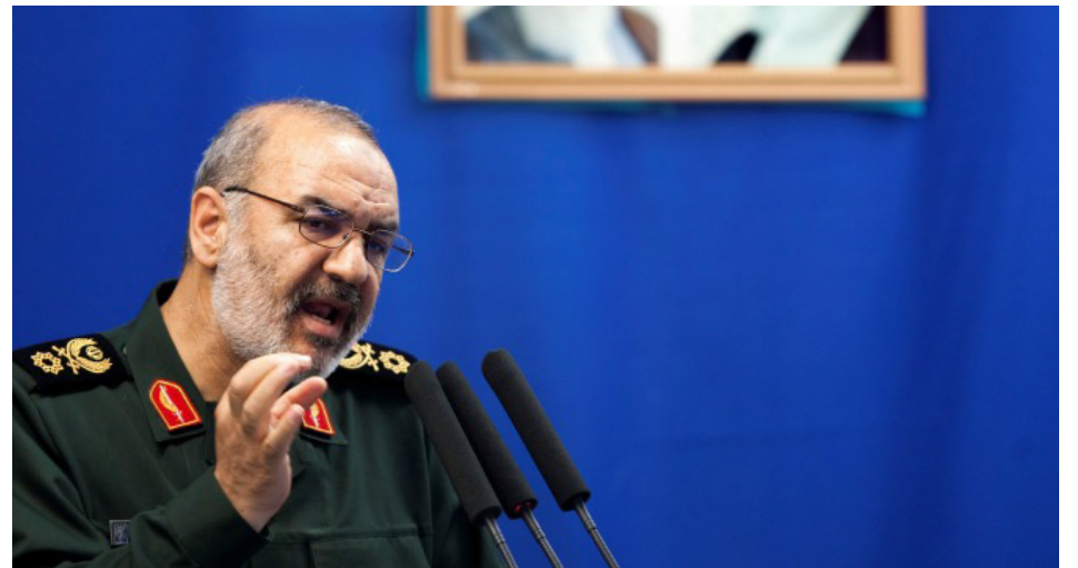
Hossein Salami, deputy head of Iran's Revolutionary Guard, speaks during Tehran's Friday prayers, July 16, 2010.