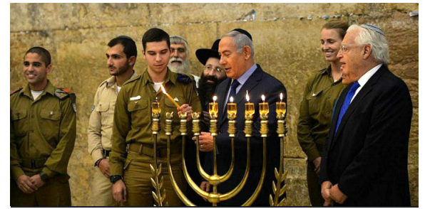
Israeli Prime Minister Benjamin Netanyahu lights the Hanukkah menorah at the Western Wall on Dec. 6, 2018, with U.S. Ambassador to Israel David Friedman watching.

As far as most of academia and much of the organized Jewish world is concerned, the right response to the antisemitic garbage masquerading as human-rights advocacy from groups like Students for Justice in Palestine is a meek request for dialogue. We are told by those who claim to understand young Jews that the worst thing they can do is to call out these hate groups for what they are, and that they should avoid at all costs any advocacy that would involve confronting or calling out