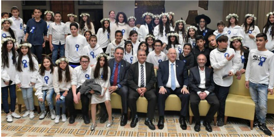
Israel's President Reuven Rivlin hosted an annual bar and bat mitzvah event for children who have been injured in terrorist attacks, complete with a performance by 2018 Eurovision Song Contest winner Netta Barzilai, Dec. 19, 2019