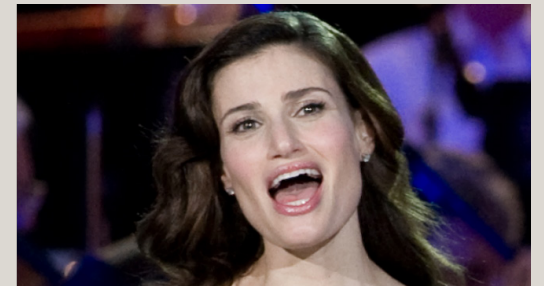
Idina Menzel.

Menzel, who also stars in this month's film "Uncut Gems," explained in the track description, "I was trying to teach him what the prayer was to light the candles for the menorah at Hanukkah. I