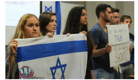
Pro-Israel activists face down disruptive protesters at a University of California Irvine event with Reservists on Duty, May 3, 2018.

University administrators have repeatedly failed to address this problem adequately, primarily because they have not understood when and how anti-Zionism becomes antisemitism. Equally important, administrators have not appreciated that failure to protect students who express the Zionist part of their Jewish identity from persistent and pervasive harassment and discrimination will subject the universities to legal liability under Title VI of the Civil Rights Act. Trump's Executive Order made both of these points abundantly clear. It clarified for universities that, as the IHRA definition provides, the following are some contemporary examples