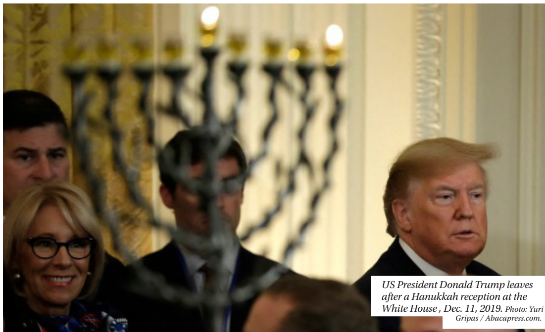
US President Donald Trump leaves after a Hanukkah reception at the White House, Dec. 11, 2019.