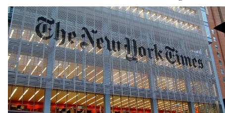
The headquarters of The New York Times.

This, too, is not accurate. For example in 2015, the president of Israel, Reuven Rivlin, said in a major policy address, "We are all here to stay — Haredim and secular Jews, Orthodox Jews and Arabs.... we must ensure that no citizen is discriminated against, nor