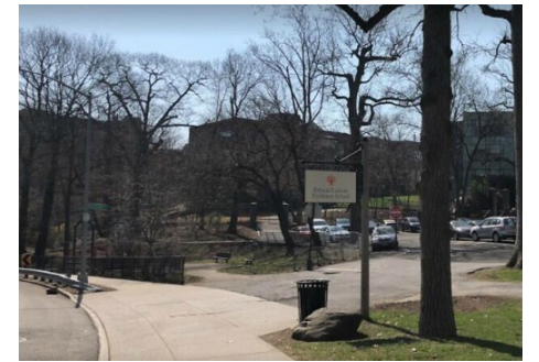
Fieldston School in Riverdale, N.Y.

The magazine outlined various issues Jewish parents had with the school, including the fact that following the deadly shooting at the Tree of Life*Or L'Simcha Synagogue in Pittsburgh last year, the school sent out a letter that did not include the word "antisemitism" and highlighted the positive reaction by