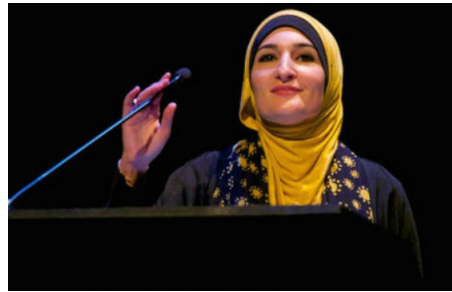
Linda Sarsour.

In 2015, Sarsour spoke at a rally organized by Farrakhan, the Nation of Islam leader who has a long history of antisemitic statements