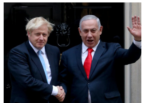
British Prime Minister Boris Johnson welcomes Israeli Prime Minister Benjamin Netanyahu outside Downing Street in London, Sept. 5, 2019.

"Hag Hanukkah Sameach," the prime minister concluded.