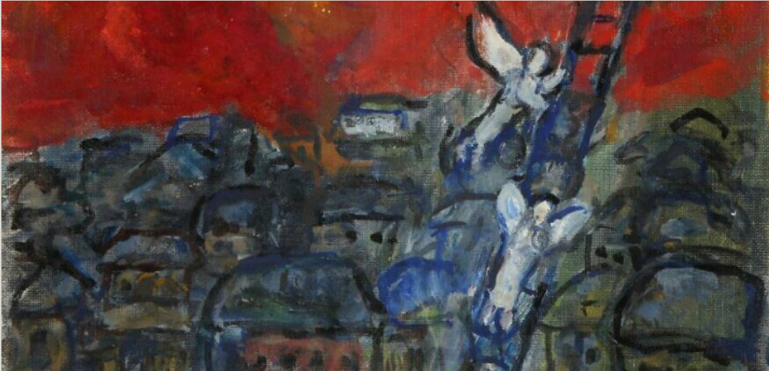
A view of "Jacob's Ladder"—a painting by the world-renowned Jewish artist Marc Chagall, which will be put up for auction on Jan. 25.