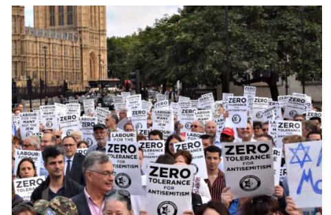
British Jews protesting in London against Labour Party leader Jeremy Corbyn.

At the same time, the bizarre affections of Trump for Jews and Israel, and the excessive embrace between Trump and Prime Minister