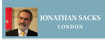
JONATHAN SACKS LONDON

Miketz represents the most sudden and radical transformation in the Torah. Joseph, in a single day, moves from zero to hero, from forgotten, languishing prisoner to viceroy of Egypt, the most powerful man in the land, in control of the nation's economy.