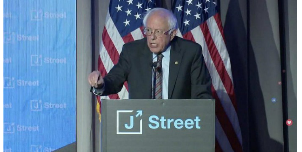
Sen. Bernie Sanders speaking at a past J Street National Conference in Washington, D.C.