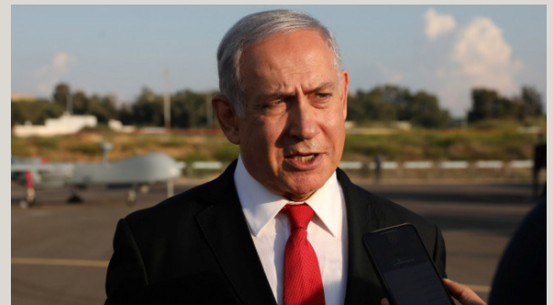
Israeli Prime Minister Benjamin Netanyahu delivers a statement to the media at the Palmachim Air Force Base near Rishon LeZion, Oct. 27, 2019.

The right-wing leader, who is fighting for his political life in a March election, made the allegation with Judaism's holy Western Wall as a backdrop during a candle-lighting