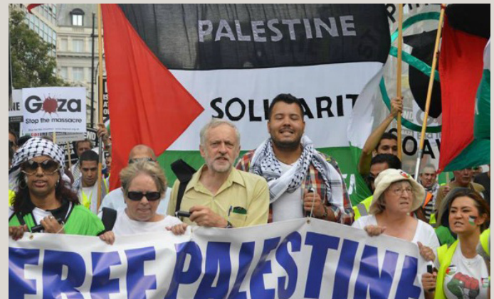
Jeremy Corbyn leads a pro-Palestinian demonstration in London in 2014, one year before becoming Labour Party leader.

Also: Is the Times suggesting that antisemitism is only about Judaism, the religion of the Jewish people? When the Nazis were ascendant in Europe, millions of Jews — secular and observant alike — were sent to concentration camps and murdered. Following World War II, hundreds of thousands of