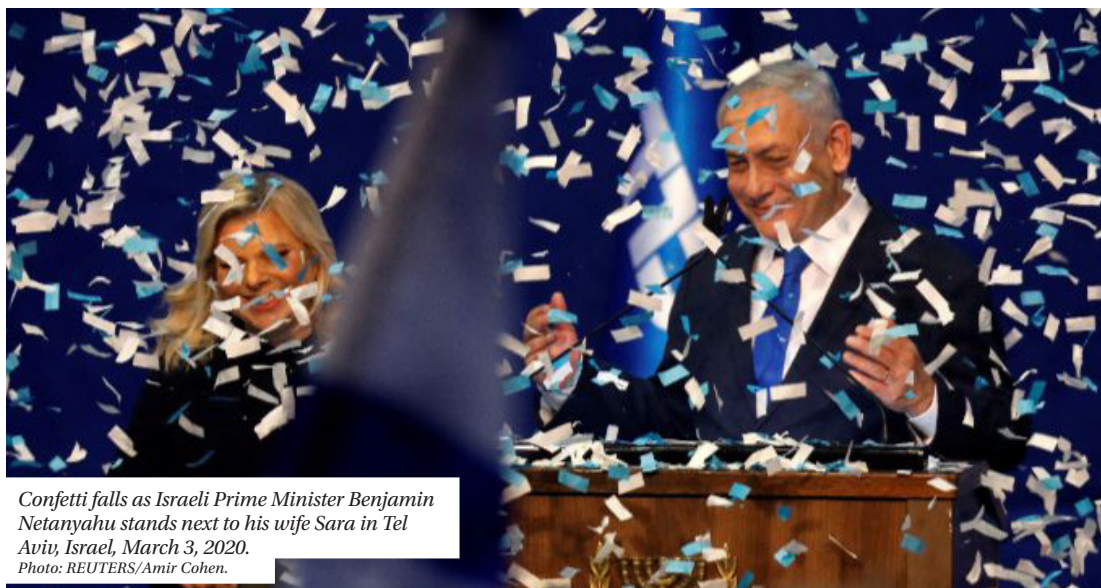
Confetti falls as Israeli Prime Minister Benjamin Netanyahu stands next to his wife Sara in Tel Aviv, Israel, March 3, 2020.