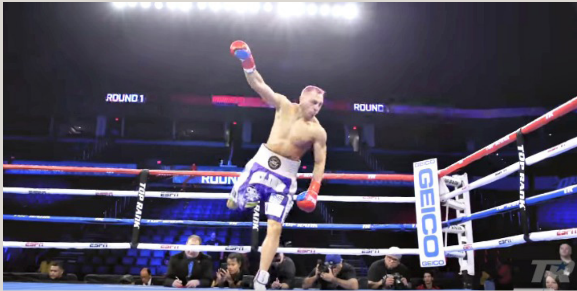
Cletus 'Hebrew Hammer' Seldin performs a victory spin following his 26 second K/O of Nelson Lara in 2018.