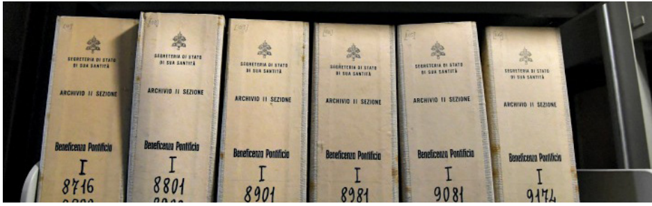
The Vatican opened the secret wartime archive of Pope Pius XII on March 2, 2020.