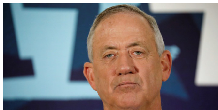
Benny Gantz, head of Blue and White party, delivers a statement in Tel Aviv, Israel, Nov. 20, 2019.

As Gantz commiserated with his supporters, Labor Party head Amir Peretz blamed the Blue and White leader for the disappointing election result.