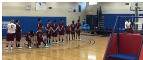
Two Brooklyn College students kneeling during a rendition of Israel's national anthem on Feb. 23, 2020.