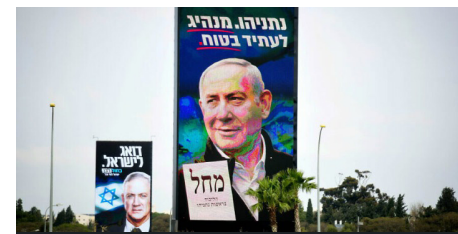
View of an election campaign billboards, in Tel Aviv on Feb. 24, 2020.

The significance of the Joint List not only turning out to be the third-largest party in the Knesset, but gaining two seats since September, is that if the current apparent stalemate — thanks, again, to Yisrael Beiteinu chairman Avigdor Lieberman — leads to a national-unity government between Likud and Blue and White, Odeh will become the head of the opposition. As such, he will be given full access to the most sensitive material relating to Israel's security and defense. It's a frightening prospect, considering that his party includes and has defended Heba Yazbak, a Knesset member who lauded Lebanese terrorist Samir Kuntar as a "martyr." In 1979, Kuntar participated in the cold-blooded killing of an Israeli family in Nahariya.