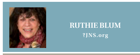
RUTHIE BLUM ?JNS.org

Keeping in mind that the results of Israel's Knesset elections are not final, the tally indicates that the attempt to oust Prime Minister Benjamin Netanyahu has failed abysmally. It remains to be seen whether his party's victory on Monday means that his bloc has enough of a majority to form a government. While the initial numbers were encouraging — with Likud outnumbering its key rival Blue and White by four mandates and the right-wing bloc surpassing the left-wing block by five — throughout Tuesday's ongoing vote count and verification, the picture continued to fluctuate. By late afternoon, it appeared that Netanyahu's victory was amazing, but not sufficient.