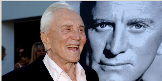
Late actor Kirk Douglas.

Mr. Douglas immediately chose the role of Pharaoh and with his trademark ability to get inside the mind of even evil figures and show how they