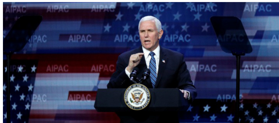
US Vice President Mike Pence delivers remarks at the annual AIPAC conference at the Washington Convention Center in Washington, DC, March 2, 2020.