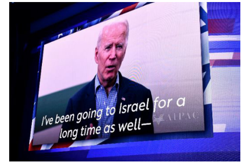
Former vice president and Democratic presidential candidate Joe Biden addresses the annual AIPAC Policy Conference, March 1, 2020.

"Palestinians need to eradicate incitement on the West Bank," he said. "They need to end the rocket attacks from Gaza. They need to accept once and for all the reality and the