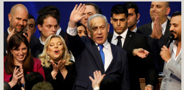
Israeli Prime Minister Benjamin Netanyahu stands next to his wife Sara as he waves to supporters in Tel Aviv, March 3, 2020.

The largely-Arab Joint List party won 15 seats and the