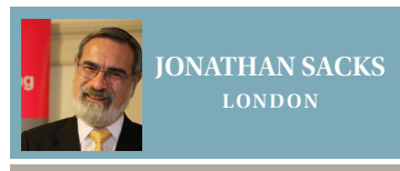
JONATHAN SACKS LONDON

Tetzaveh, with its elaborate description of the “sacred vestments” which the Priests and the High Priest wore “for glory and for splendour,” seems to run counter to some fundamental values of Judaism.