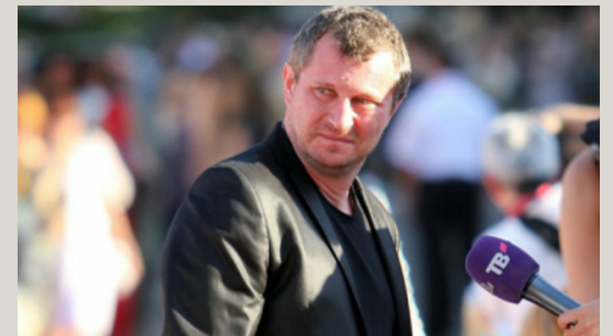
Filmmaker Vadim Perelman.

Set in 1942, the film is about a Belgian Jew in a German concentration camp who claims to be Persian to avoid being executed. The prisoner tries to save himself by agreeing to teach Farsi, a language he does not know and subsequently makes up, to a Nazi officer who hopes to open a restaurant in Iran after the war.