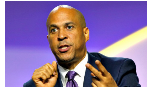
US Senator Cory Booker.

There is a way back for Cory. He can apologize for having broken his promises to the pro-Israel community. He can acknowledge that being silent in the face of genocide,