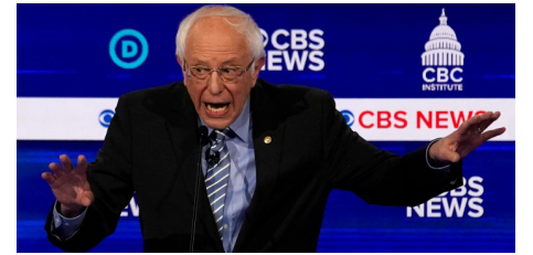
Democratic US presidential candidate Senator Bernie Sanders in South Carolina, Feb. 25, 2020.

Benjamin Netanyahu has his share of detractors in Israel and abroad, but it's a rather perfunctory dismissal of a man who is surely a