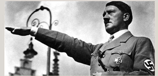
Adolf Hitler giving a Nazi salute.