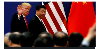
US President Donald Trump and China's President Xi Jinping in Beijing, China, November 9, 2017.

these transfers are forced or voluntary, the same analyst pointed out the widespread fear that refusal to participate would lead to detention in one of the brutal "re-education" camps operated by the regime. As has been the case since the founding of the People's Republic of China in 1949, fear of its excesses remains the state's most powerful weapon in dealing with its subjects.