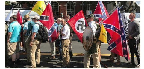
White supremacists at the 'Unite the Right' rally in Charlottesville, Virginia, August 12, 2017.