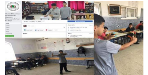
Images from an educational Facebook page showing Palestinian children using slingshots in Palestinian Authority schools.

An e-learning portal operated by the Palestinian Authority's Education Ministry even uses the example of rockets fired at Israeli