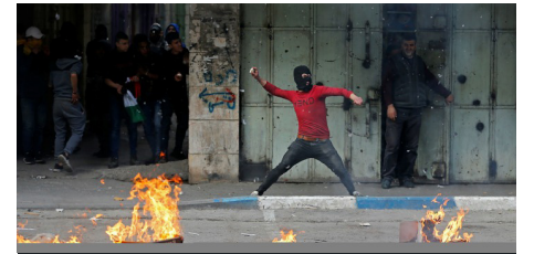
A Palestinian rioter hurls stones at Israeli troops in the West Bank city of Hebron, Feb. 6, 2020.

Maher, who loathes President Trump, gave him credit for recognizing Jerusalem as Israel’s capital: “I hate to agree with Donald Trump ... it doesn’t happen often, but I do. I don’t know why Israel — it has been their