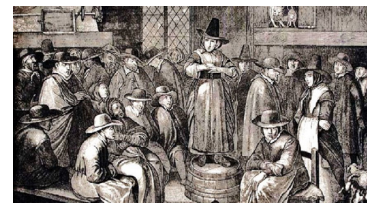
Quakers

After World War I, Quakers had won German gratitude for opposing the Versailles Peace Treaty as well as helping feed starving Germans. As Rufus Jones