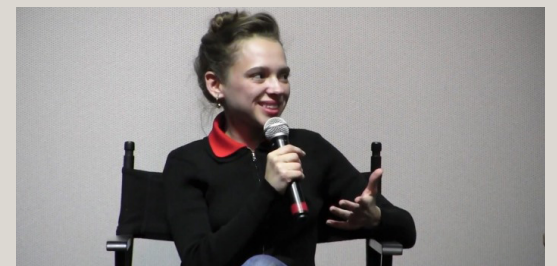
Israeli actress Shira Haas in 2018.

Haas, 24, explained that her 86-year-old grandmother was in quarantine without any family members, but added "today we did a zoom call