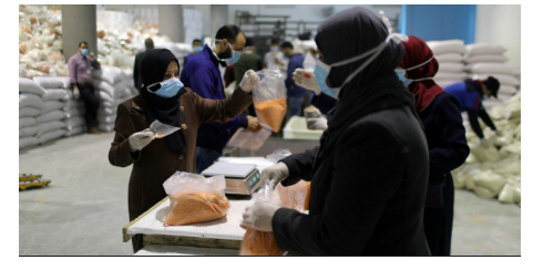
Workers pack food supplies to be distributed and delivered by the United Nations Relief and Works Agency (UNRWA) to the homes of Palestinian refugees as a precaution against the spread of coronavirus disease (COVID-19), in the northern Gaza Strip March 31, 2020.

One can’t blame Loubani, however. His record and agenda are clear. But one should blame The Washington Post .