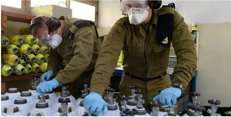
Israel Defense Forces soldiers helping to fill and deliver oxygen tanks as part of the country's efforts to combat the coronavirus epidemic.