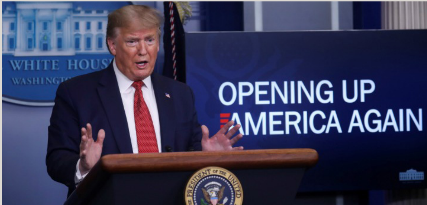
US President Donald Trump answers questions about his administration's plans for “Opening Up America Again” during the daily coronavirus task force briefing at the White House in Washington, US, April 16, 2020.

For example, we’ll need to know from our local authorities: How many people are you