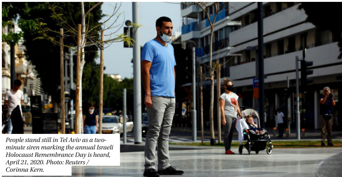
People stand still in Tel Aviv as a two-minute siren marking the annual Israeli Holocaust Remembrance Day is heard, April 21, 2020.