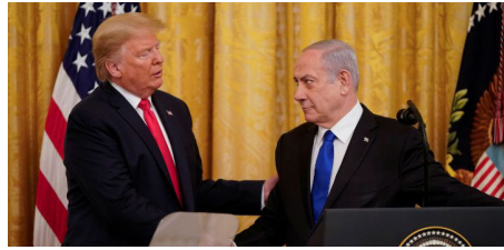
US President Donald Trump shakes hands with Israel's Prime Minister Benjamin Netanyahu in Washington, US, January 28, 2020.

Moreover, the deal states that both leaders "will act in full agreement with the