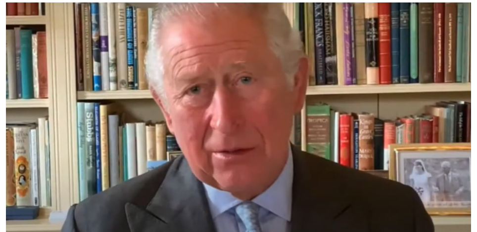
Britain's Prince Charles addresses the National Yom HaShoah UK Commemoration via video, April 20, 2020.