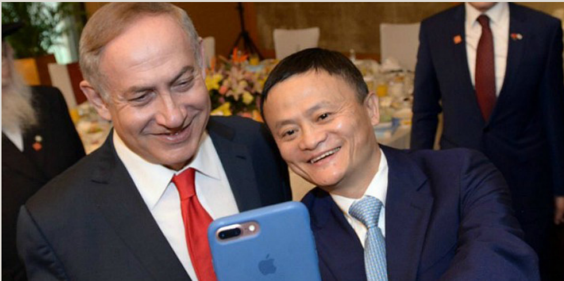
Israeli Prime Minister Benjamin Netanyahu takes a selfie with chairman of Alibaba, Jack Ma, during a meeting with leaders of large corporations in China, during Netanyahu's visit to China on March 20, 2017.