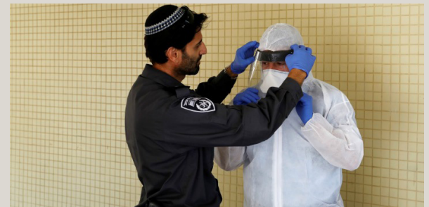
An Israeli police officer helps a Health Ministry inspector put on protective gear before they go up to the apartment of a person in self-quarantine as a precaution against the spread of the coronavirus, in Hadera, Israel, March 16, 2020.