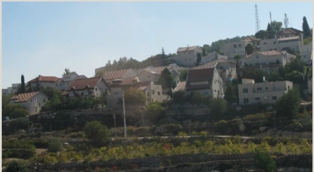
Efrat in Gush Etzion.