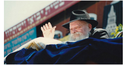
Menachem Mendel Schneerson — the Lubavitcher Rebbe — at the Lag BaOmer parade in Brooklyn, New York, May 17, 1987.

"So I did the Seder by myself. On my own. It was the worst and most bitter Seder I have ever had. I just sat there crying the whole way through. Weeping. It wasn't Pesach. It was Tisha B'Av. I did not have to eat Maror. I — my entire life! — was Maror. Yes, I went through the Haggadah and ate the Matzah; but the