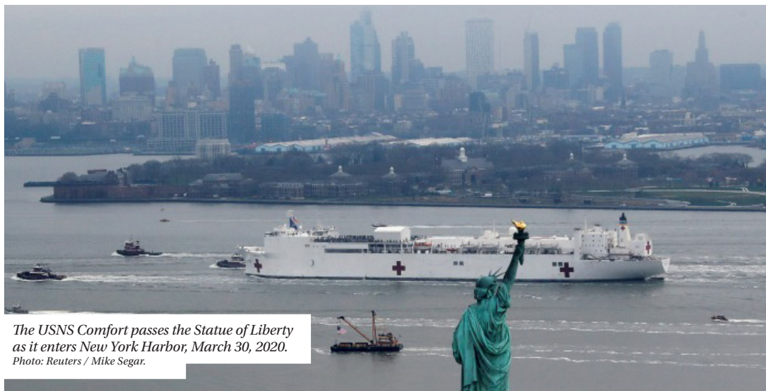
The USNS Comfort passes the Statue of Liberty as it enters New York Harbor, March 30, 2020.