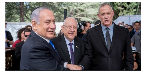
Israeli President Reuven Rivlin, Prime Minister Benjamin Netanyahu and Blue and White leader Benny Gantz.

The voters, in the meantime, are fed up with hearing about the same old promises and messages. Members of the Israeli public are united by their lack of patience with our political system, yet they are largely divided between two camps. One camp seeks stability and the status quo in the areas of defense, international affairs, and areas of key national