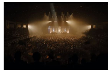
A scene from the HBO miniseries The Plot Against America.

HBO's "The Plot Against America" (the first two episodes have already aired) is a remarkably fine and chilling adaptation of the Philip Roth novel by the same name. It was created and written by Ed Burns and David Simon, the same TV tandem that gave us "The Wire." Roth's political thriller presented them with the challenge