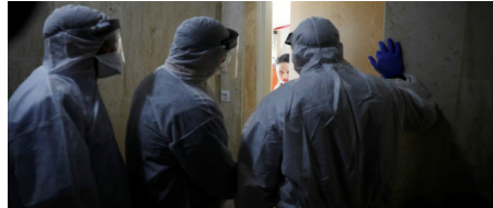
Health Ministry inspectors in Hadera, Israel, March 16, 2020.

known, but Moshe Bar Siman-Tov, the director-general of the Health Ministry, said it was "in working order."