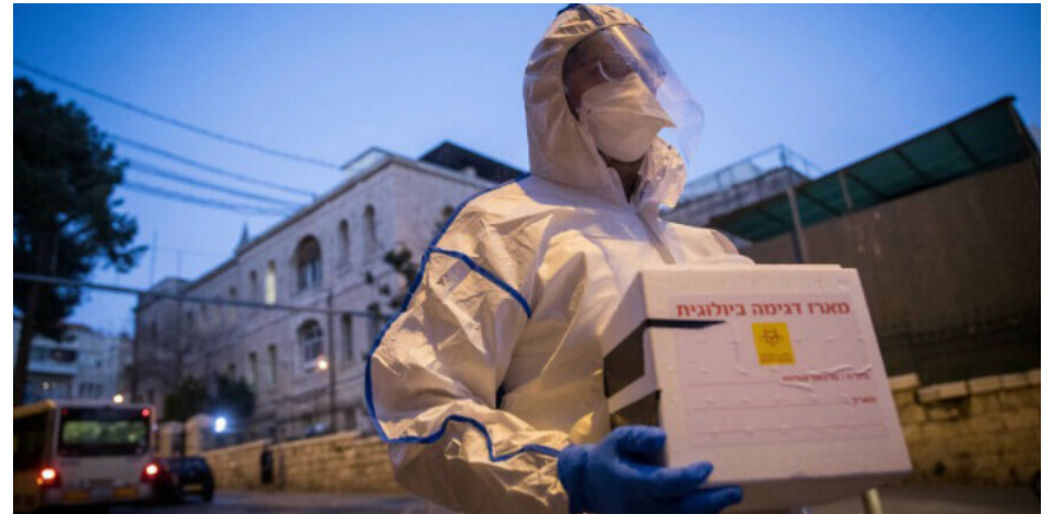
A Magen David Adom worker on the way to test a patient with symptoms of COVID-19 (coronavirus), in Jerusalem, March 16, 2020.