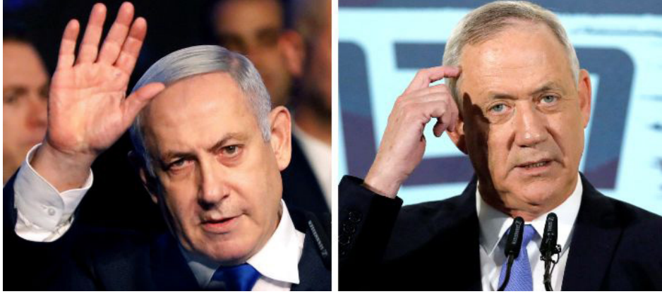
A combination picture shows Israeli Prime Minister Benjamin Netanyahu in Tel Aviv, Israel, November 17, 2019; and leader of the Blue and White party Benny Gantz in Tel Aviv, Israel, November 20, 2019.