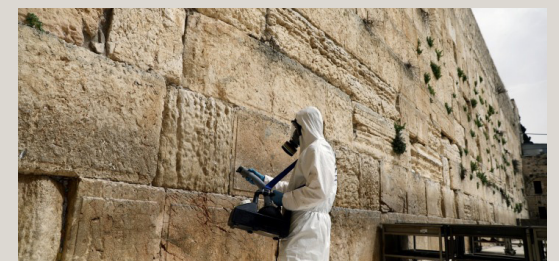
A laborer sanitizes the stones of the Western Wall as part of measures to prevent the spread of the coronavirus disease (COVID-19), in Jerusalem's Old City, March 31, 2020.

Workers in hazmat suits and gas masks sprayed