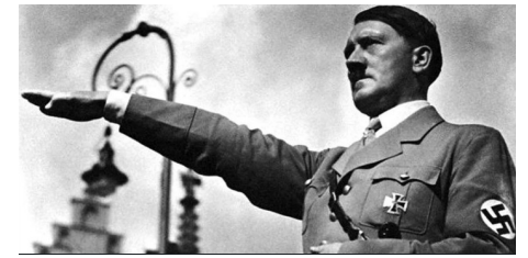
Adolf Hitler giving a Nazi salute.

I found this message strange. What did it mean? Why is the emphasis on unnamed fascists who carried out the Final Solution? As is the case for too many memorials created by the Polish, Austrian, and German governments, there is no reference to Jews. Yes, Hitler was responsible for the death of millions of people, but it was only the Jews and the Roma whom he sought to exterminate. This was a pretty pathetic way to distinguish the house of the world's greatest mass murderer.