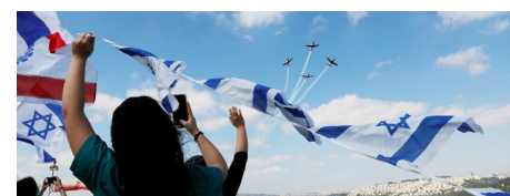
Medical workers react as Israeli Air Force planes fly over Jerusalem, as part of Israel's 72nd Independence Day celebrations, April 29, 2020.

Another security reality that has ingrained