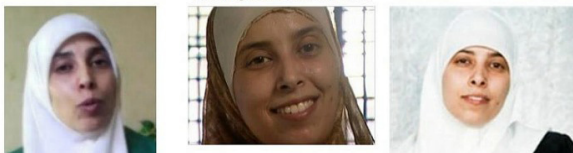
An FBI "Most Wanted Terrorist" poster for Palestinian terrorist Ahlam Ahmad al-Tamimi, one of the masterminds of the Aug. 9, 2001 bombing of the Sbarro pizzeria in Jerusalem.

Conspiring to Use and Using a Weapon of Mass Destruction Against a United States National Outside the United States Resulting in Death and Aiding and Abetting and Causing an Act to be Done