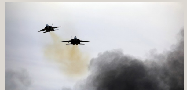
Israeli Air Force F-15 planes.

"Syria is paying an increasing price due to the Iranian presence on its territory for a war that is not [Syria's]," they added.