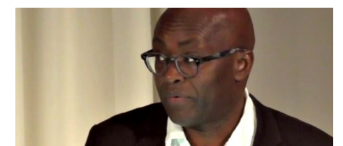
South Africa-based academic Prof. Achille Mbembe.