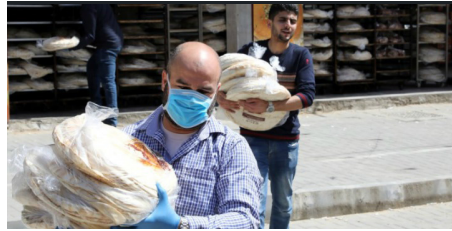
Workers load bread on a bus to sell it to people close to their homes after Jordan announced it would extend a curfew indefinitely, amid concerns over the spread of coronavirus disease (COVID-19), in Amman, Jordan March 24, 2020.

The vast majority of media outlets in Arab countries are state-controlled, and they serve to protect and preserve the regime in power. There is often an official representative