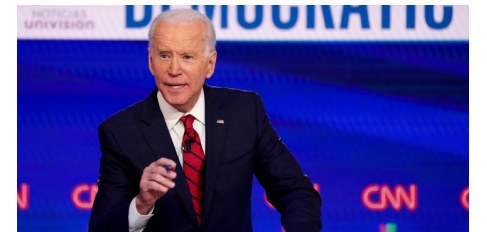
Democratic US presidential candidate and former Vice President Joe Biden, in Washington, DC, March 15, 2020.

But while Biden, Blinken, and company may talk of two states and hope that they can outlast Prime Minister Benjamin Netanyahu in office — something Obama failed to do — they may also understand that their chances of making the Palestinians negotiate seriously remain nonexistent. The constant bickering with the Israeli government that was the hallmark of Obama's Middle East policy may return. But in practice, Biden is likely to find himself managing the conflict in a manner that is similar to that of Trump in that he is