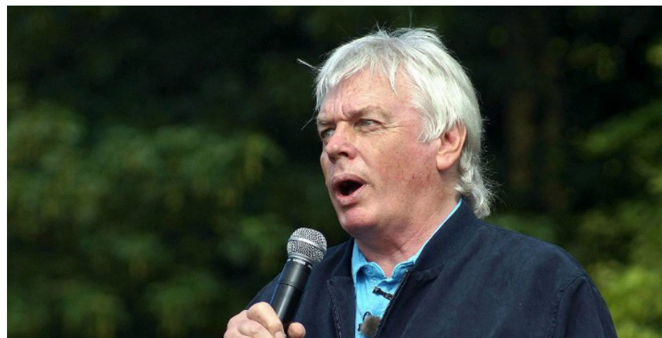
David Icke.