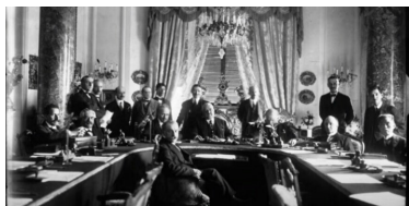
Delegates at the San Remo conference in 1920.

This article was first published by the Jewish Journal.