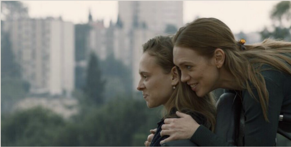
A still from the Israeli film "Asia."