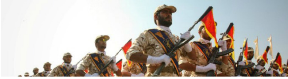
Members of Iran's Islamic Revolutionary Guard Corps march in a parade in Tehran, Sept. 22, 2011.