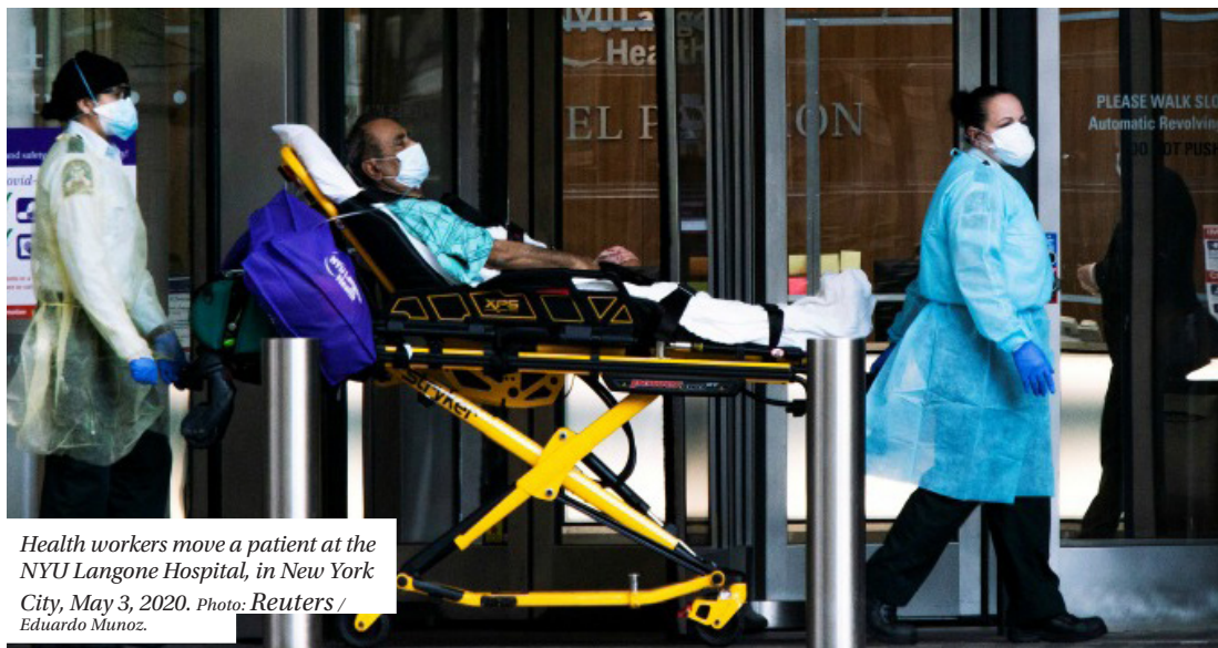
Health workers move a patient at the NYU Langone Hospital, in New York City, May 3, 2020.