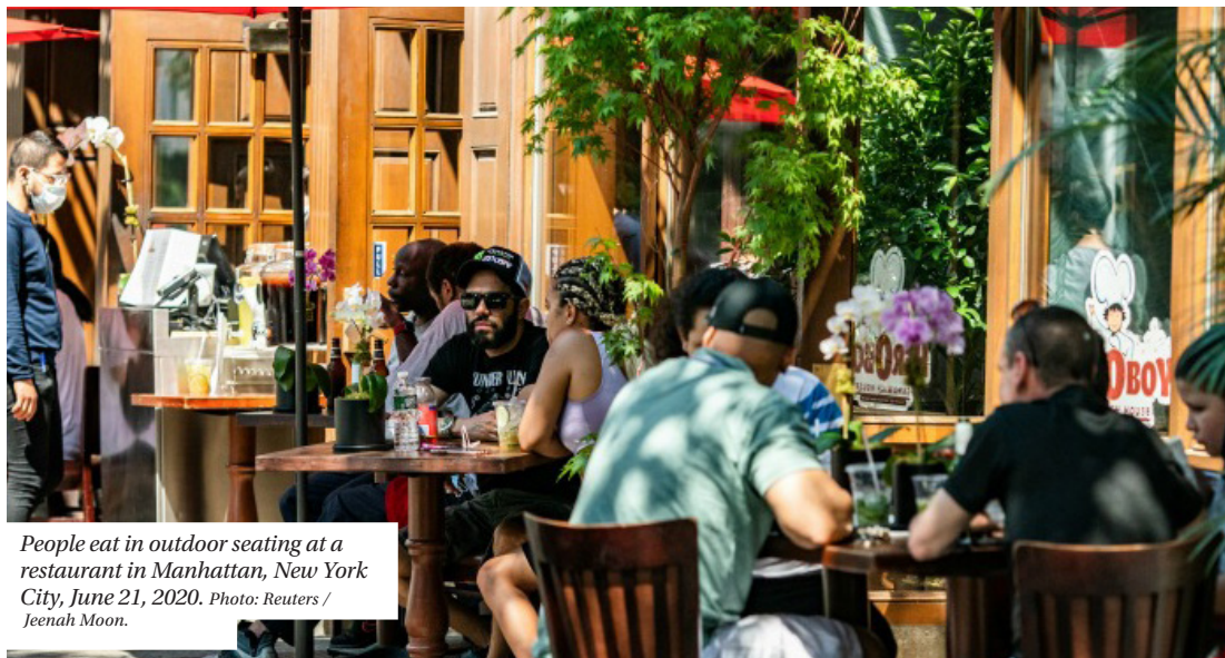
People eat in outdoor seating at a restaurant in Manhattan, New York City, June 21, 2020.