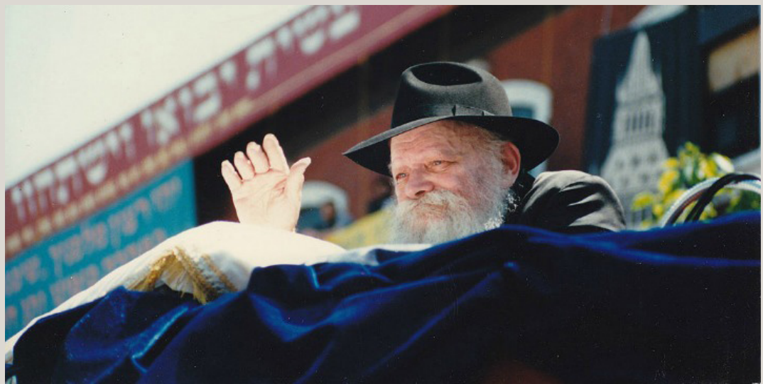
Menachem Mendel Schneerson — the Lubavitcher Rebbe — at the Lag BaOmer parade in Brooklyn, New York, May 17, 1987.

All of this is impressive, and his achievements