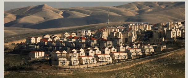
A general view picture shows houses in the Israeli settlement of Maale Adumim, in the West Bank, Feb. 15, 2017.

A senior administration official said on Monday that the US ambassador to Israel, David Friedman, will be in Washington to meet officials including Secretary of State Mike Pompeo, senior White House adviser Jared Kushner and Middle East envoy Avi Berkowitz. President Donald Trump could also join in.