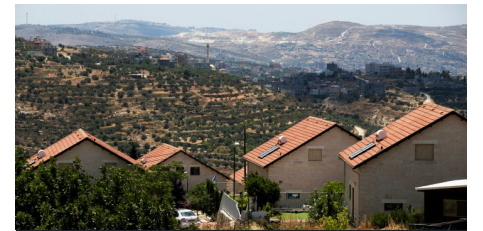
Houses are seen in the Israeli settlement of Itamar, near Nablus, in the West Bank, June 15, 2020.

Furthermore, the Geneva Conventions may not even apply at all. Legal scholars such as Eugene Kontorovich point out that bilateral treaties between Israelis and Palestinians have the effect of overruling the Geneva Conventions by mutual agreement,