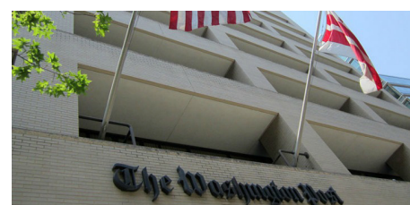
The former Washington Post building.