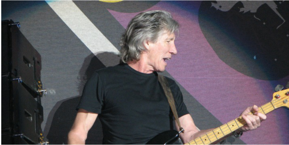
Roger Waters.