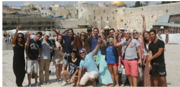
Taglit-Birthright Israel trip participants visit the Western Wall in the Old City of Jerusalem, Aug. 18, 2014.

Forces’ soldier taking her oath with a Bible in one hand and an Israeli-made weapon in the other; a kibbutz founded by Holocaust survivors, producing milk and honey aplenty.