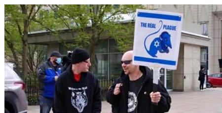
A man holding an antisemitic sign at a protest in Columbus, Ohio.

The shift of focus from the coronavirus to racism happened in "a few days," Quer said, and yet "the antisemitic discourse is just as powerful and the sources responsible for disseminating it have adapted [their] antisemitic narratives to the changing social context."