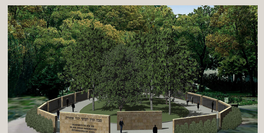
A model of the Holocaust memorial