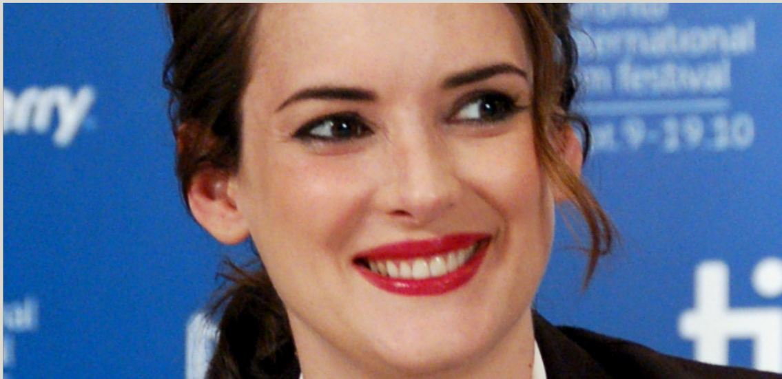
Winona Ryder.