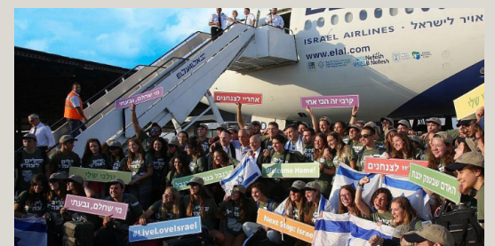
New immigrants arrive in Israel, many coming alone to serve in the nation’s military.

The announcement comes in the wake of an unprecedented spike in interest from North American Jews to move to Israel, with Nefesh B’Nefesh reporting its highest number of applications in May since the organization’s founding in 2002.