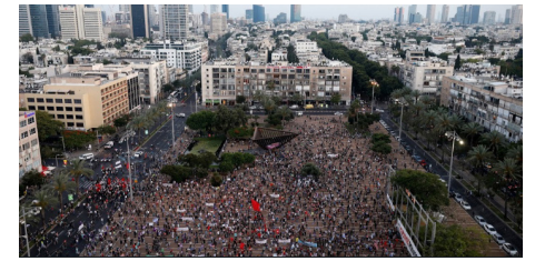
Demonstrators protest — amid coronavirus restrictions — against Israeli Prime Minister Netanyahu’s plan to annex parts of the West Bank in Tel Aviv, Israel, June 6, 2020.

While their foreign office huffs and puffs, EU member states are less decided as to how they’ll respond to an Israeli annexation bid. Austria, Hungary, and the Czech Republic seem OK with annexation. Germany, for one, has indicated it won’t support sanctions against Israel. But others have insisted on a harder line: European elder statesman Jean Asselborn, veteran foreign minister of little Luxembourg, has already called on Europe to unilaterally recognize a Palestinian state on