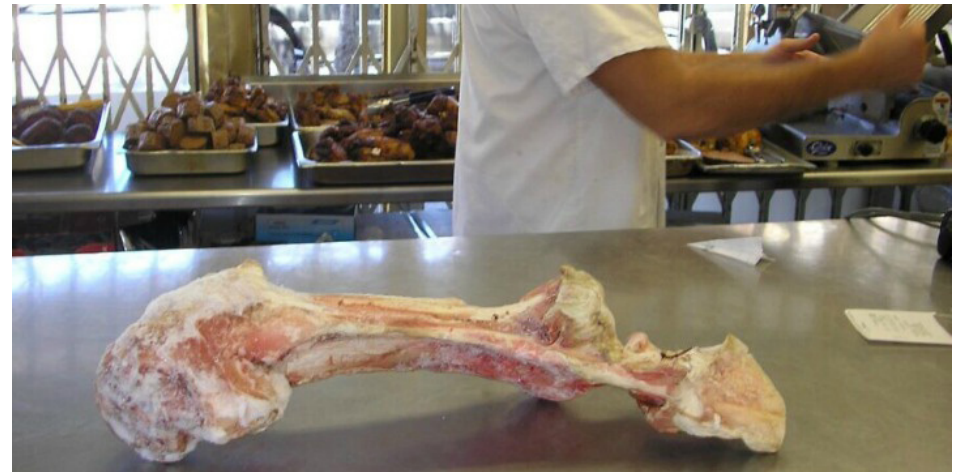
Meat at a kosher butcher shop.