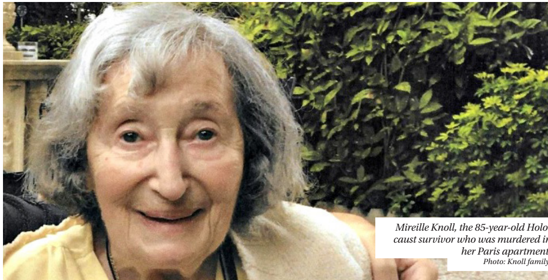
Mireille Knoll, the 85-year-old Holocaust survivor who was murdered in her Paris apartment.