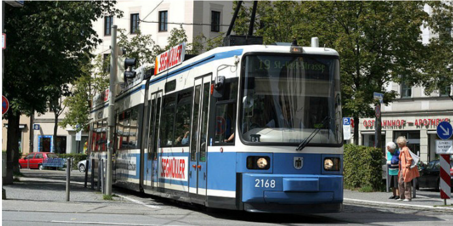
A tram in Munich, Germany.