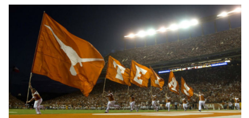
University of Texas football game.

UT's failure to speak out appears in stark contrast to promises by university officials last month to condemn all acts of hate, such as