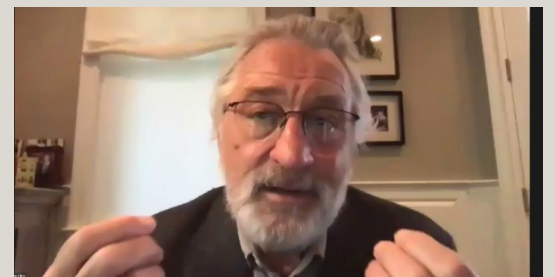
Robert De Niro during a webinar with Tel Aviv University students.

The Oscar winner’s most recent trip to Israel was