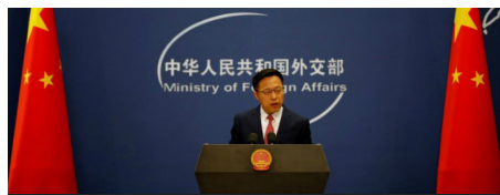
Chinese Foreign Ministry spokesman Zhao Lijian attends a news conference in Beijing, China April 8, 2020.

Another example proving this premise was Chinese mariner Zheng He, who traveled into the Indian Ocean in the early 15th century in an attempt to establish a long-term Chinese presence there. The Indian and Pacific Oceans