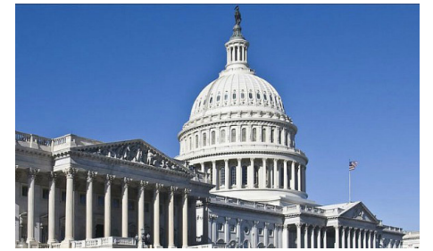
The House of Representatives Building and the East Portico of the US Capitol.

Writing about UT, Benjamin Baird of the Middle East Forum has noted: "No such constraints deter these professors from presenting ahistorical, one-sided accounts of the Middle East. Whether designing anti-Israel curricula for secondary education, accepting funds from Islamist organizations, teaching from radical sources, or producing