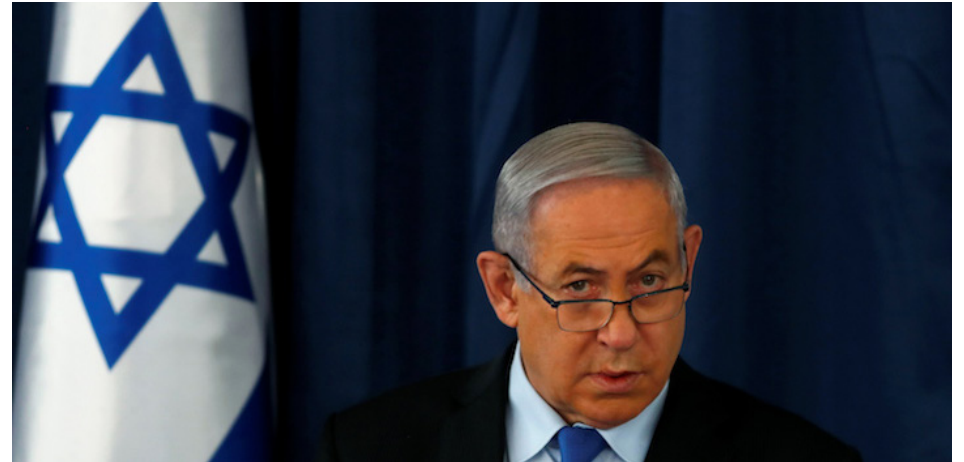
Israeli Prime Minister Benjamin Netanyahu holds the weekly cabinet meeting in Jerusalem June 28, 2020.