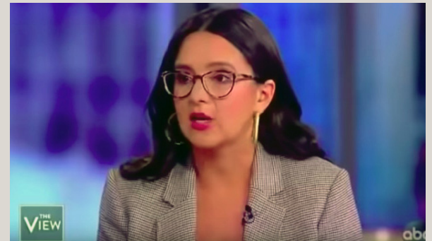
Bari Weiss on 'The View'

Weiss, a graduate of Columbia University, is the author of the 2019 book How To Fight Anti-Semitism . For the