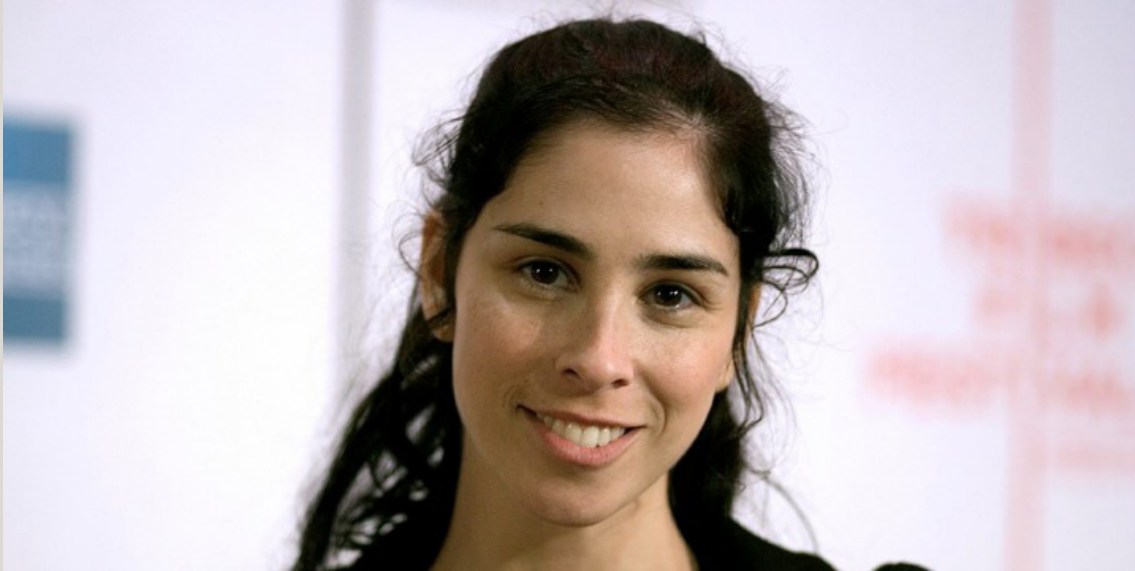
Sarah Silverman.