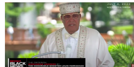
Louis Farrakhan during his Fourth of July address "The Criterion" on Revolt TV.

So we believe it's fair to ask why there hasn't been any condemnation or criticism by African-American leaders of Louis Farrakhan's hateful rhetoric. Why do they remain silent, when he defames not only Jews but others, including the LGBTQ community? He has spread falsehoods about those who are working to find a cure for the coronavirus pandemic, which so far has killed more than 130,000 Americans, a large number of them Blacks. As Martin Luther King, Jr. reminded us all, "He who accepts evil without protesting against it is really cooperating with it."