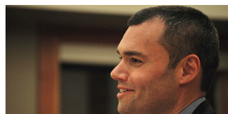
Peter Beinart.