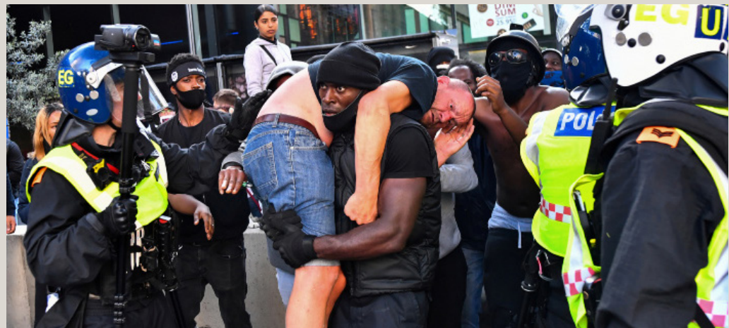
A protester carries an injured counter-protester to safety, near the Waterloo station during a Black Lives Matter protest following the death of George Floyd in Minneapolis police custody, in London, Britain, June 13, 2020.

The impact of slavery was a multi-century tragedy that required more than an Emancipation Proclamation to undo the damage done to its victims. The failure to reconstruct the post-Civil War South in such a manner as to disenfranchise the forces of white supremacy was a catastrophe that led to a century of Jim Crow laws and racist segregation. Along with such overt prejudice were more subtle forms of de facto discrimination,